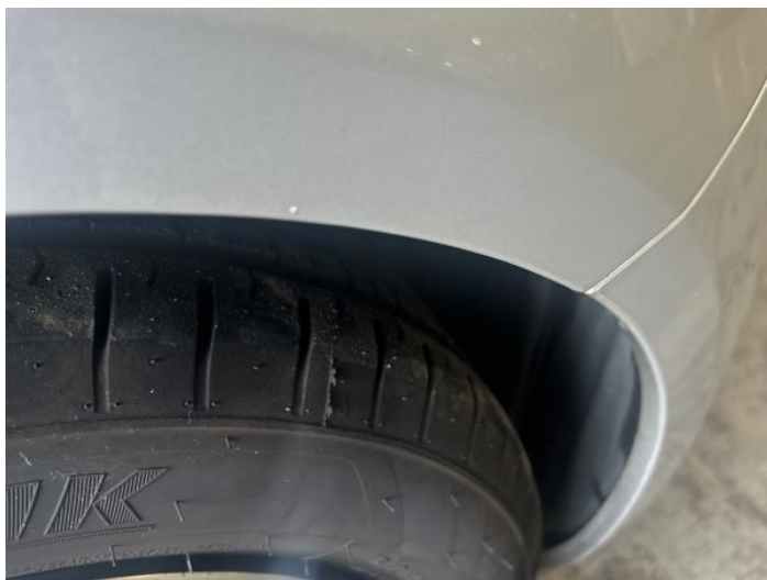
1: Wing osf Chipped 1 To 5