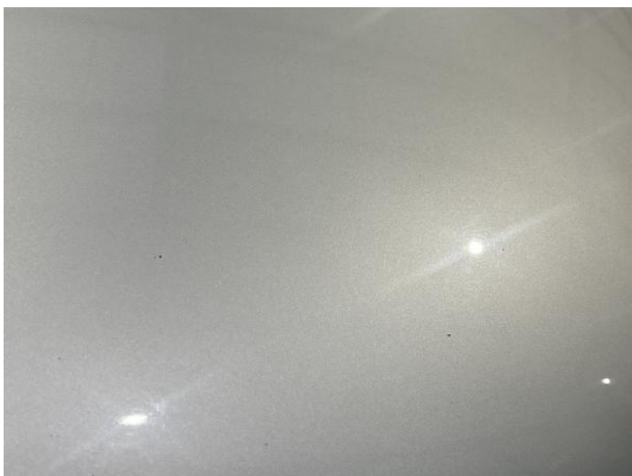
11: Bonnet Chipped 1 To 5