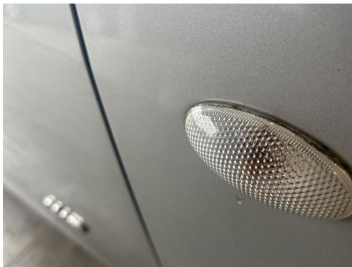
2: Wing osf Dented 2 Or Less UpTo 10mm