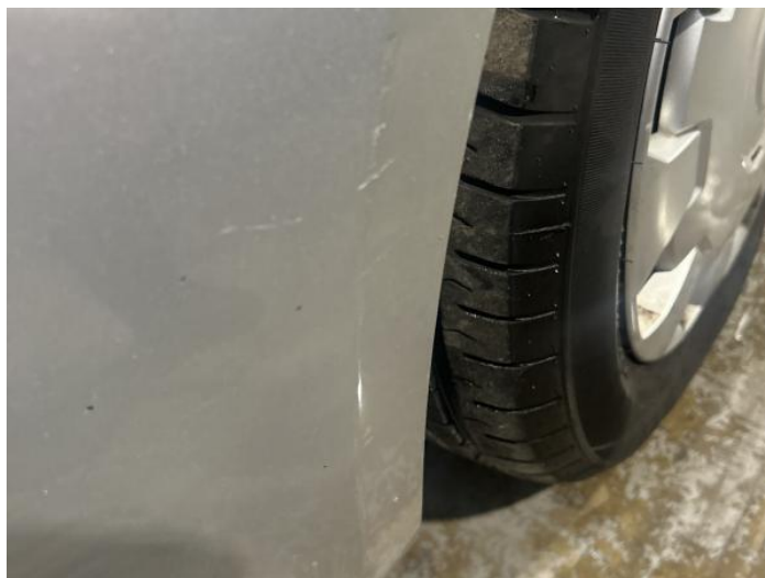
10: Bumper Front Scratched UpTo 25mm Thru Paint