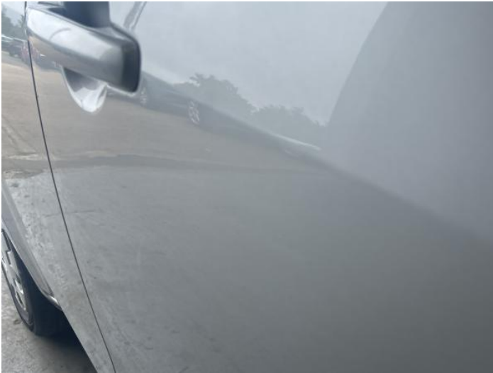
3: Door osf Dented 2 Or Less UpTo 10mm