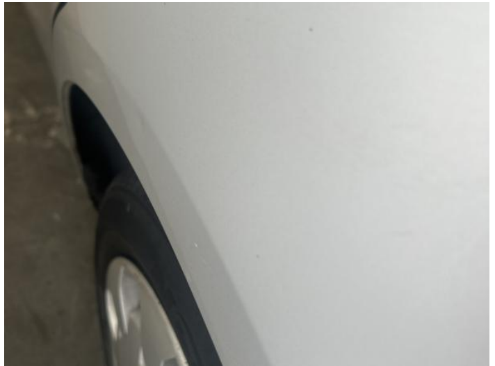
6: Qtr Panel nsr Dented 2 Or Less UpTo 10mm