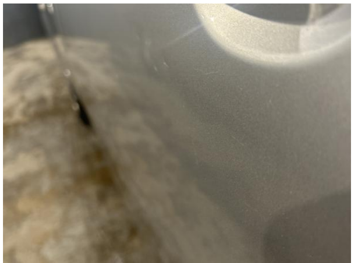
8: Door nsr Dented 2 Or Less UpTo 10mm