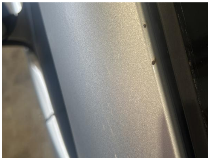
12: A Post os Chipped 1 To 5