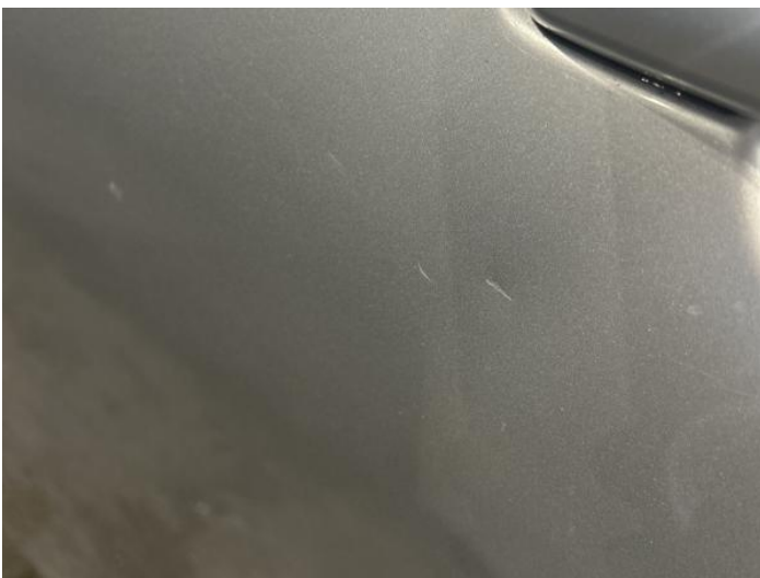
7: Door nsr Chipped 1 To 5