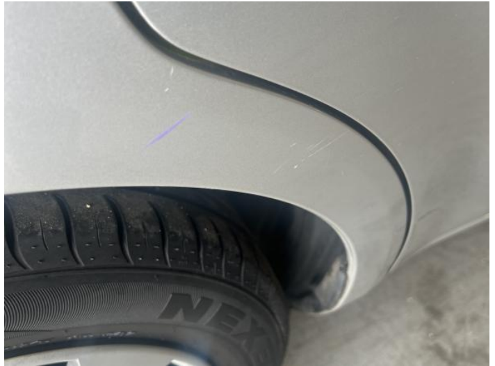
4: Qtr Panel osr Scratched Over 25mm Not Thru Paint