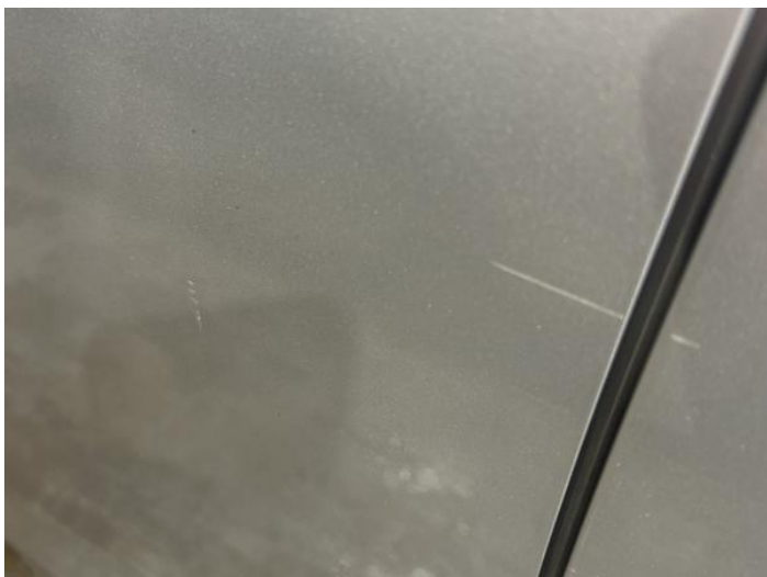
9: Door nsf Scratched UpTo 25mm Thru Paint