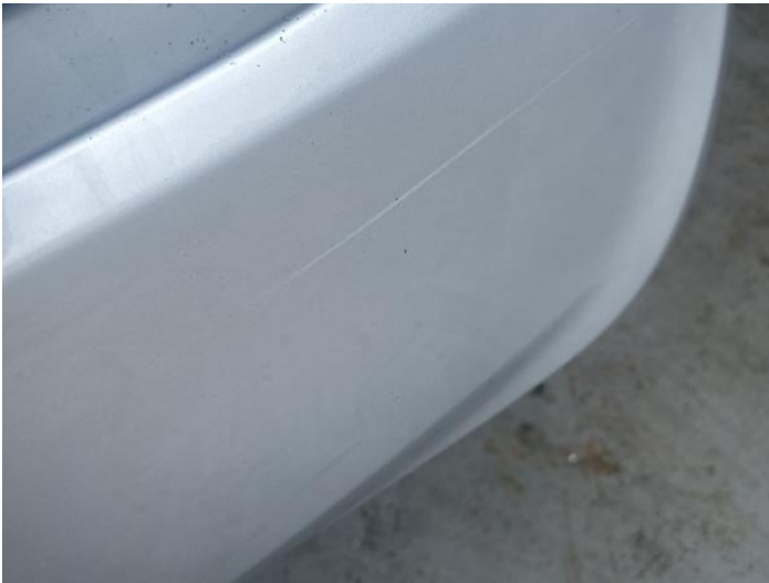
5: Bumper Rear Scratched Over 25mm Not Thru Paint