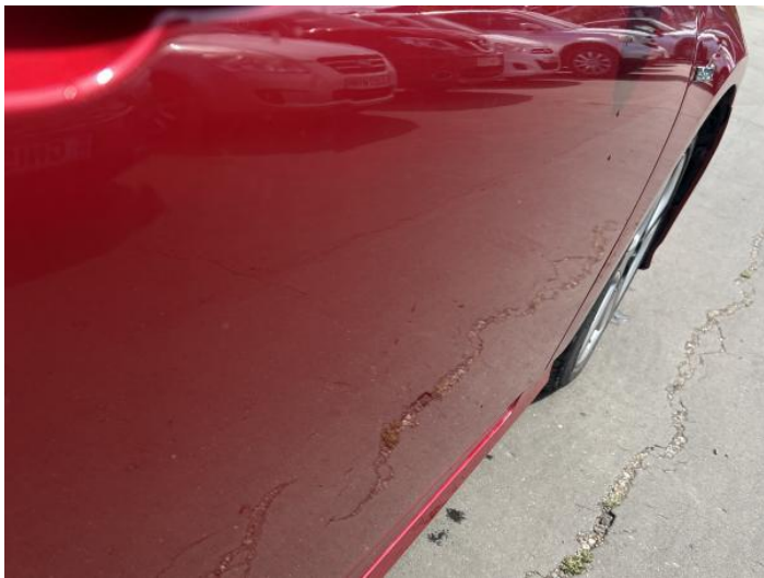
5: Door osf Dented Over 2 UpTo 10mm