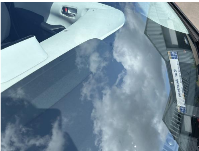
19: Screen Front Chipped Up To 10mm