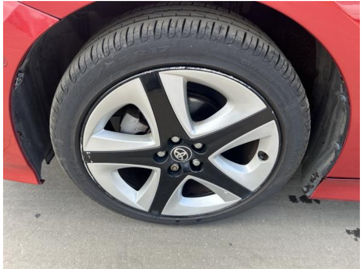
16: Wheel nsf Scratched Over 50mm