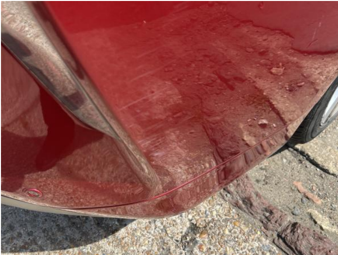
9: Bumper Rear Scratched 25 to 100mm Thru Paint