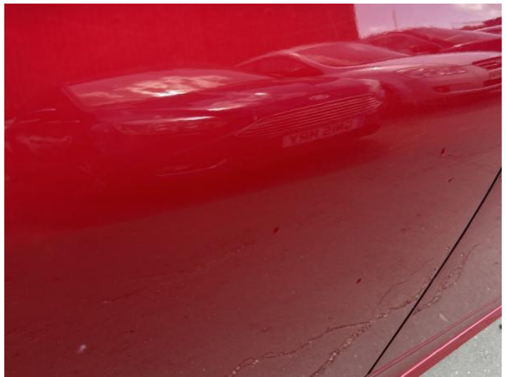
6: Door osr Scratched Over 25mm Not Thru Paint