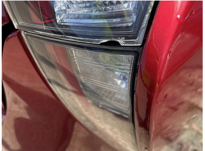
10: Lamp osr Broken Replace