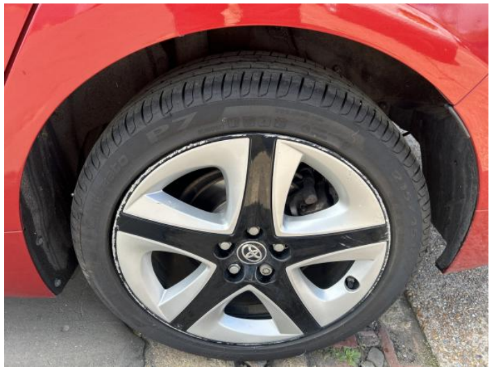
12: Wheel nsr Scratched Over 50mm