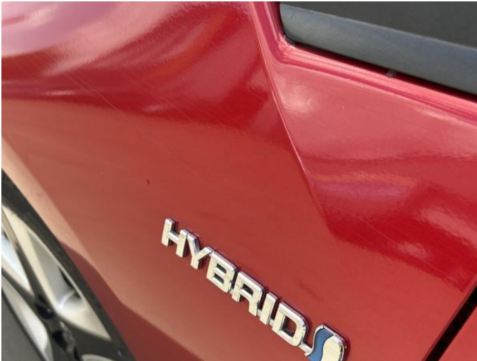
15: Wing nsf Poor Previous Repair Poor Paint