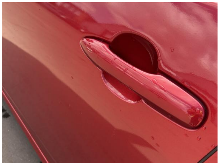
14: Door nsf Poor Previous Repair Poor Paint