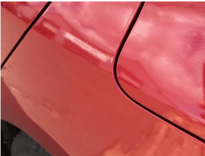
11: Qtr Panel nsr Poor Previous Repair Poor Paint