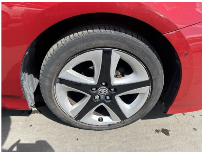
1: Wheel osf Scratched Over 50mm