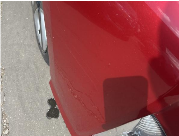
17: Bumper Front Scratched Over 25mm Not Thru Paint