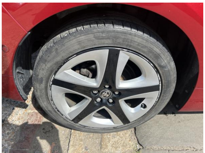
8: Wheel osr Scratched Over 50mm