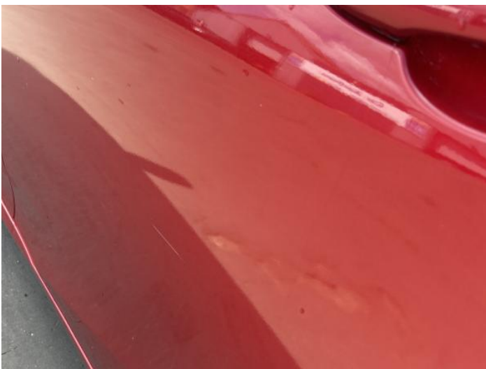
13: Door nsr Poor Previous Repair Poor Paint