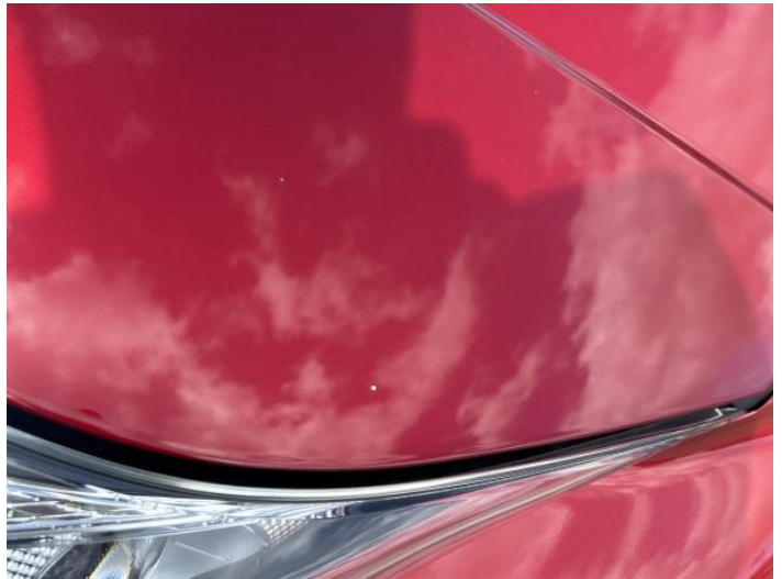
18: Bonnet Chipped 1 To 5