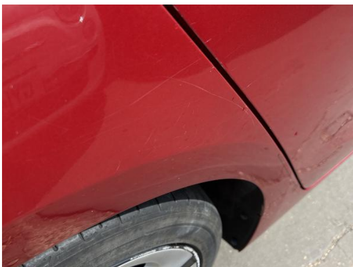
7: Qtr Panel osr Scratched Over 25mm Not Thru Paint