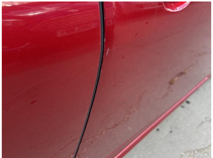
4: Door osf Chipped Edge Chip