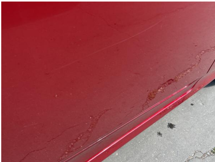
3: Door osf Scratched Over 25mm Not Thru Paint