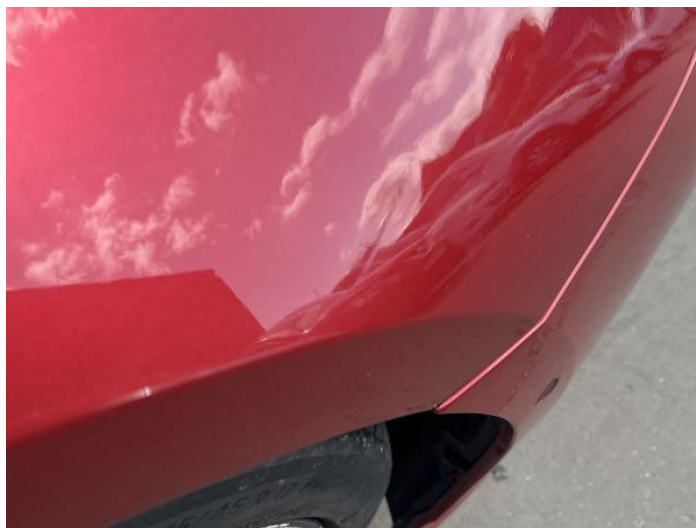
2: Wing osf Dented Between 10mm + 30mm