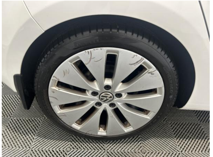
4: Wheel osr Scratched Over 50mm