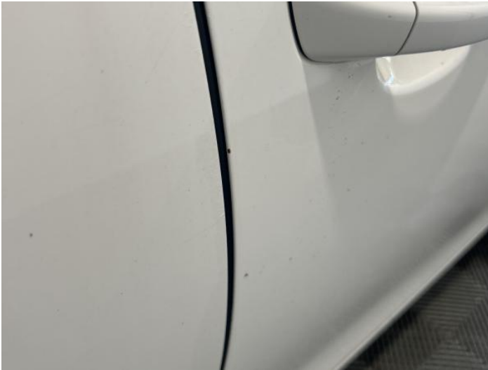
3: Door osf Chipped Edge Chip