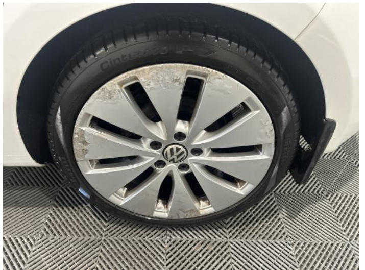
6: Wheel nsr Scratched Over 50mm