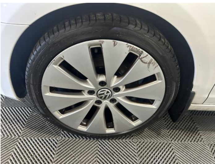
7: Wheel nsf Scratched Over 50mm