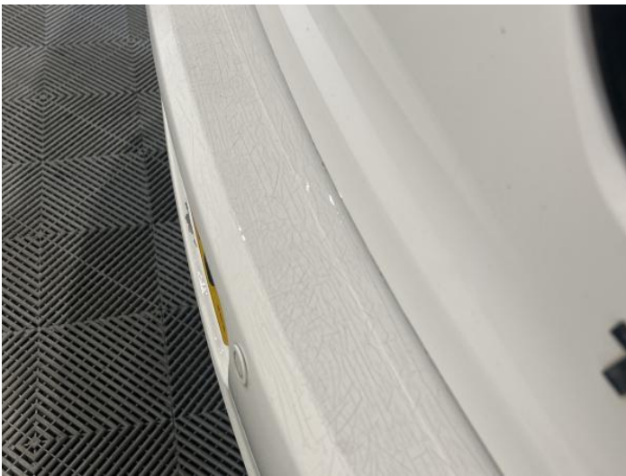
5: Bumper Rear Poor Previous Repair Poor Paint