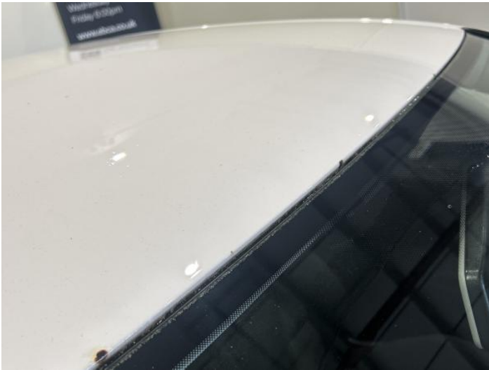
11: Roof Chipped 1 To 5