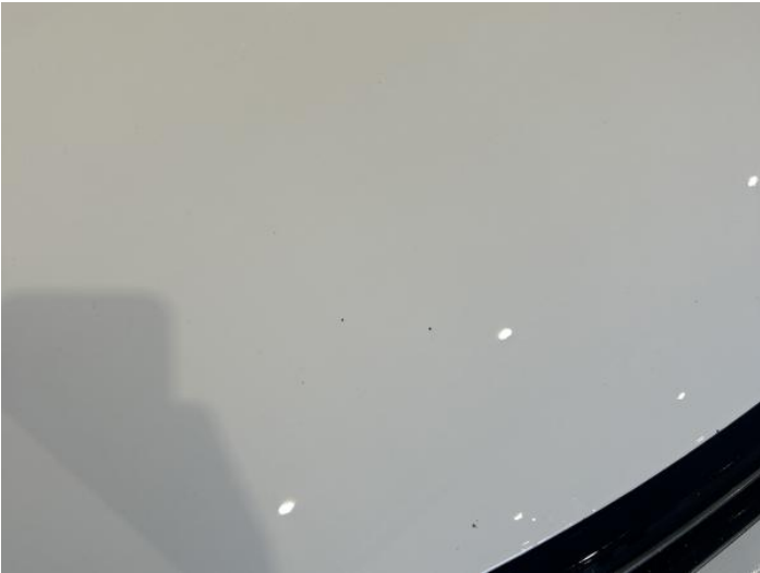
10: Bonnet Chipped Multiple Chips