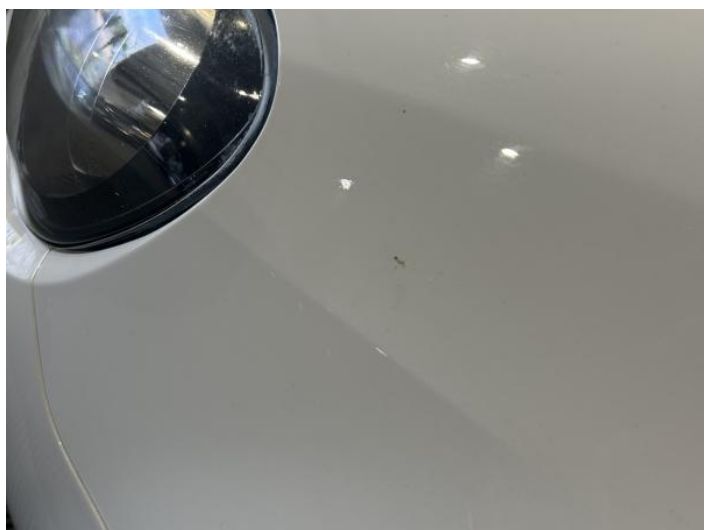
8: Wing nsf Chipped 1 To 5