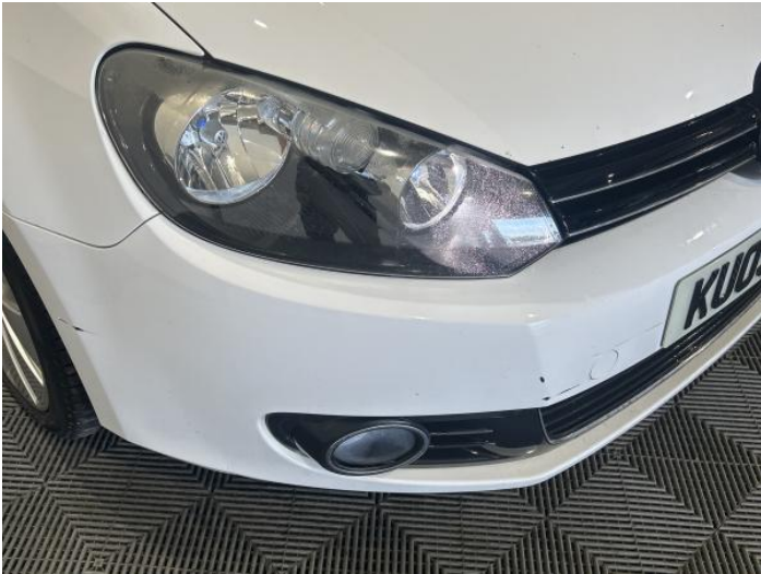
9: Bumper Front Scratched Over 100mm Thru Paint