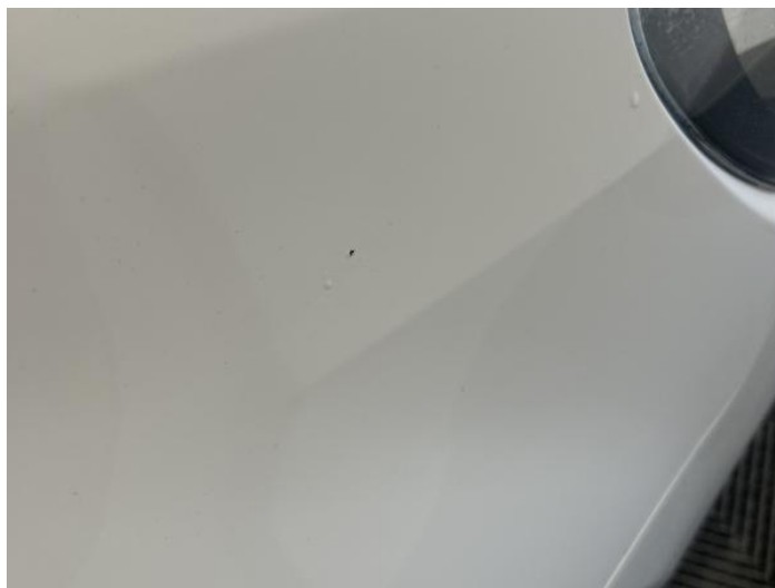
2: Wing osf Chipped 1 To 5