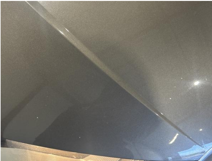
5: Bonnet Chipped Multiple Chips