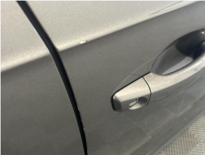
3: Door osf Chipped 1 To 5