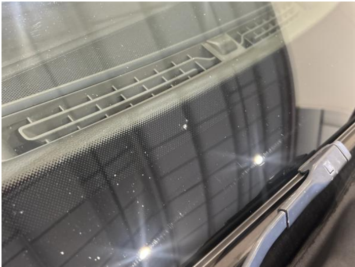
6: Screen Front Chipped UpTo 10mm

Carpet Condition Average Seat Condition Average