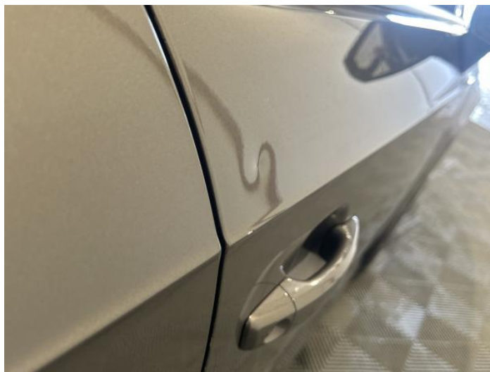
2: Door osf Dented Between 10mm + 30mm