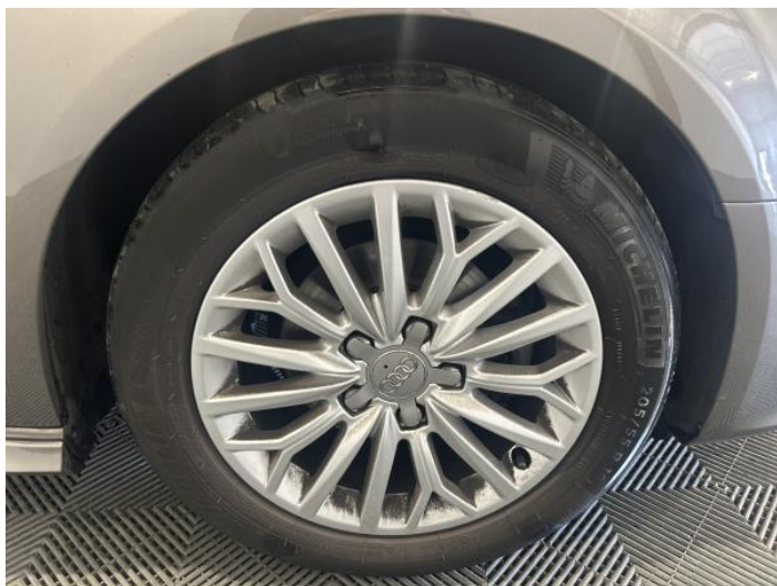
1: Wheel osf Scratched Up To 50mm