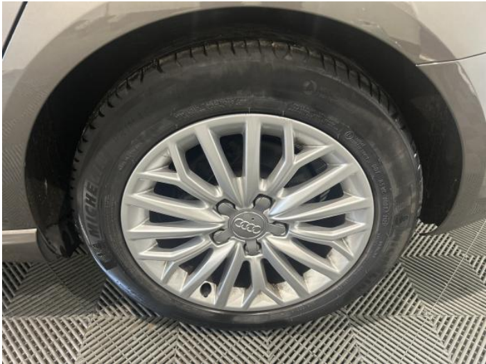
4: Wheel nsr Scratched Up To 50mm