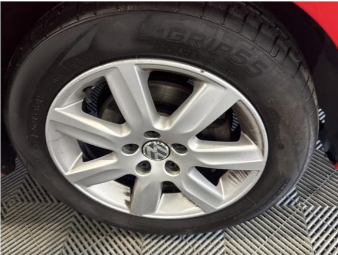
18: Wheel osf Scratched Over 50mm