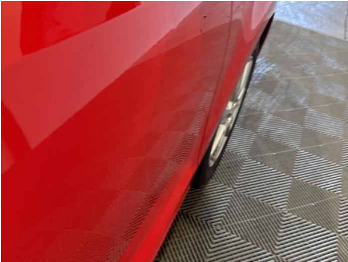
15: Door osf Dented 2 Or Less UpTo 10mm