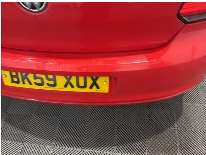
9: Bumper Rear Scratched 25 to 100mm Thru Paint