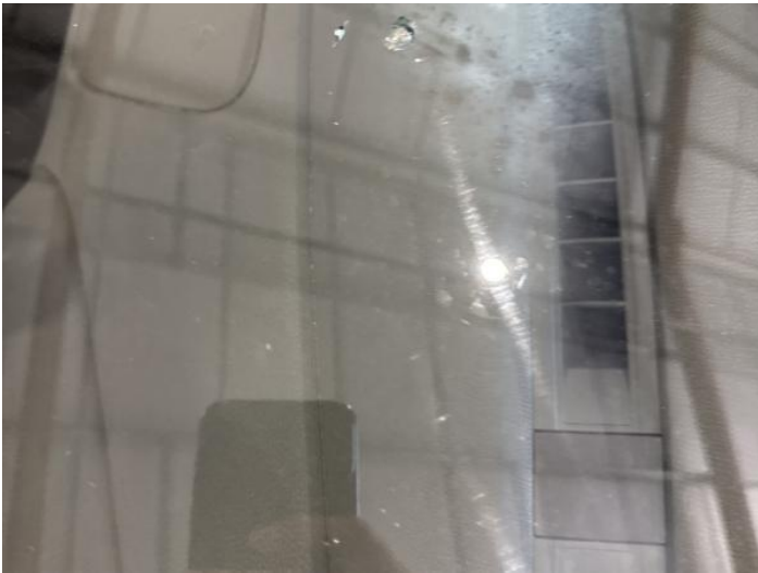
17: Screen Front Chipped UpTo 10mm