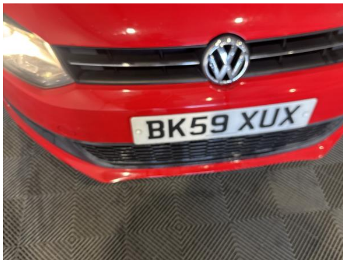
2: Bumper Front Poor Previous Repair Poor Colour