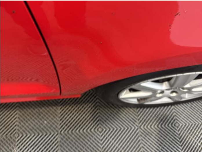
16: Wing osf Dented Over 30mm