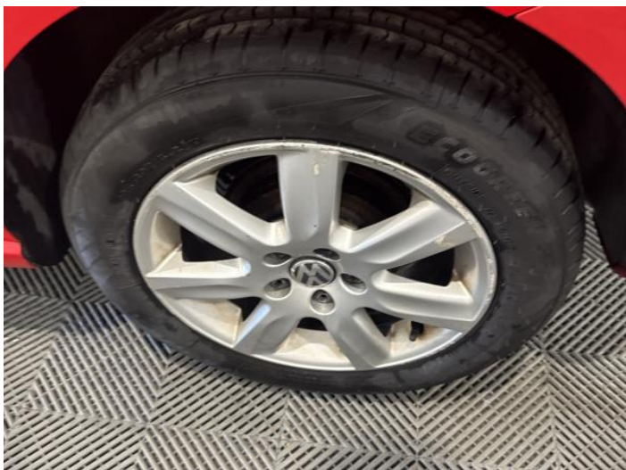
7: Wheel nsr Scratched Over 50mm