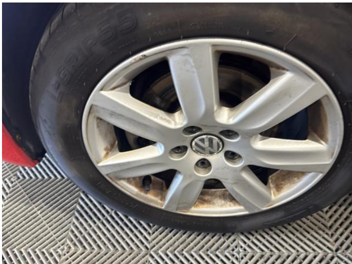
3: Wheel nsf Scratched Over 50mm