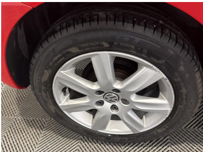
13: Wheel osr Scratched Over 50mm