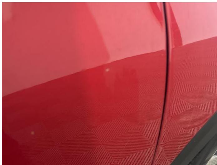
2: Door osf Chipped 1 To 5