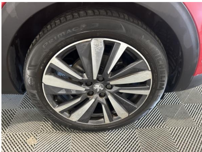
1: Wheel osf Scratched Up To 50mm