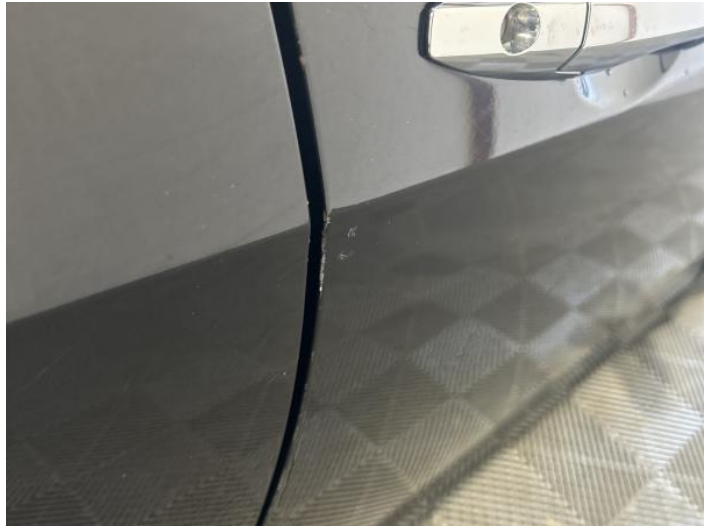
4: Door osf Chipped Edge Chip