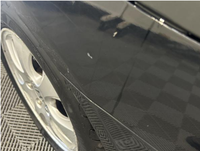
9: Qtr Panel nsr Chipped 1 To 5