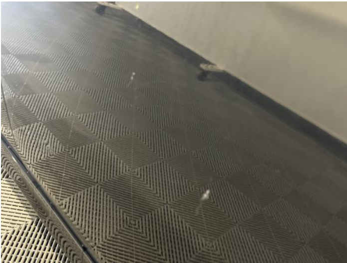
11: Door nsr Chipped 1 To 5