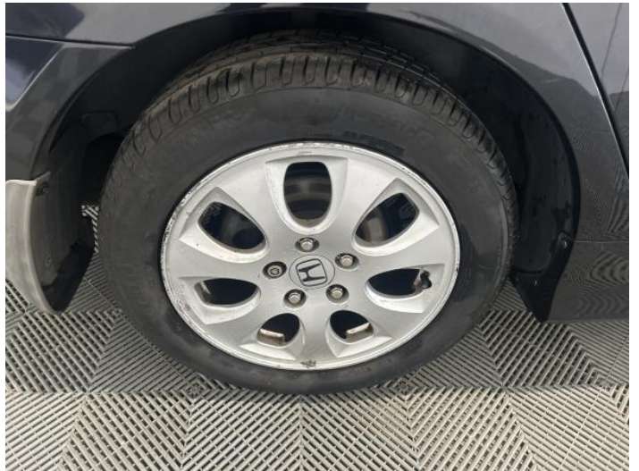
6: Wheel osr Scratched Over 50mm