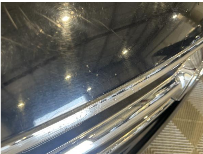
13: Bonnet Chipped 1 To 5