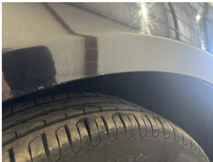
2: Wing osf Chipped 1 To 5