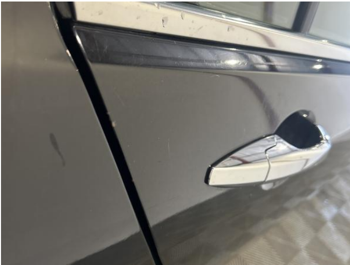
5: Door osr Chipped Edge Chip