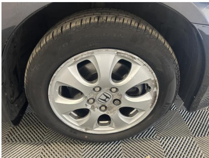
1: Wheel osf Corroded Light