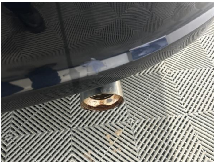
7: Bumper Rear Poor Previous Repair Paint Flake