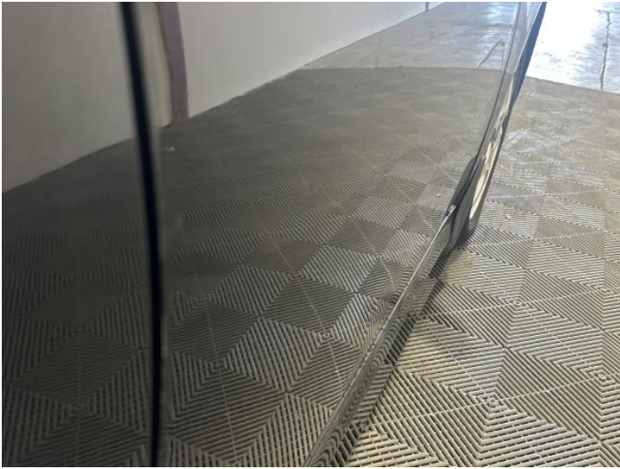
3: Door osf Dented 2 Or Less UpTo 10mm