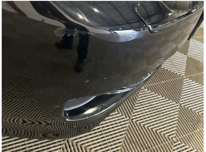
12: Bumper Front Scratched 25 to 100mm Thru Paint