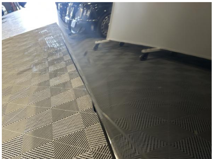
8: Qtr Panel nsr Dented 2 Or Less UpTo 10mm