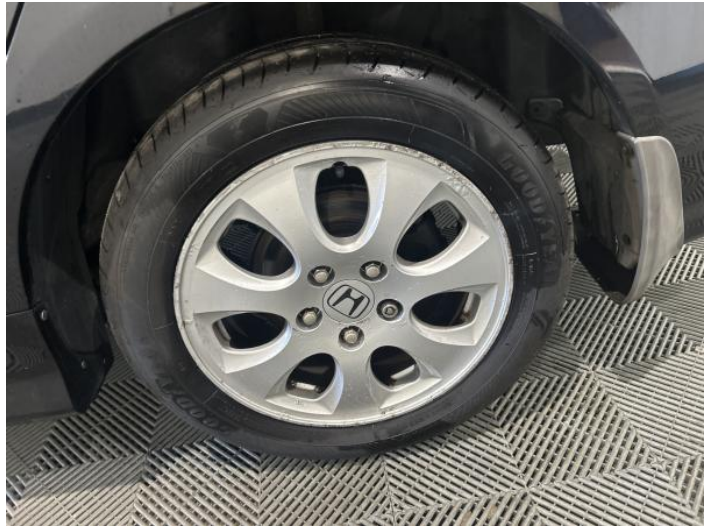
10: Wheel nsr Scratched Over 50mm