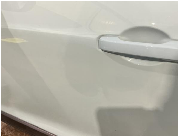
5: Door nsf Chipped 1 To 5