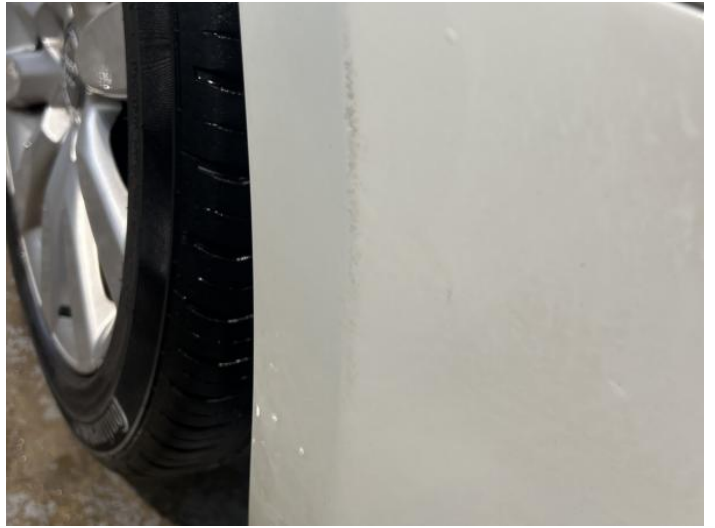
4: Bumper Rear Scratched 25 to 100mm Thru Paint