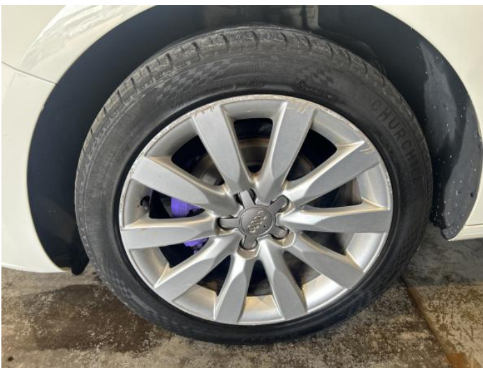
7: Wheel nsf Scratched Over 50mm