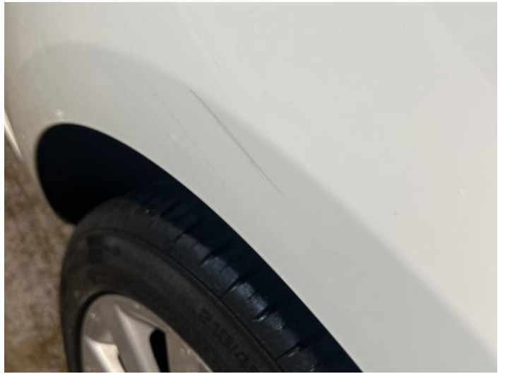
6: Qtr Panel nsr Scratched Over 25mm Not Thru Paint