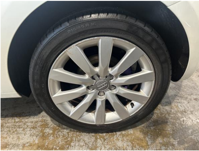
5: Wheel nsr Scratched Over 50mm