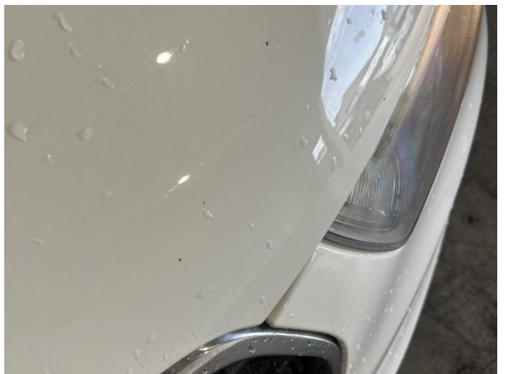
8: Bonnet Chipped 1 To 5