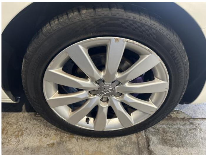
1: Wheel osf Scratched Over 50mm