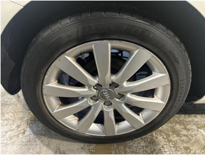
3: Wheel osr Scratched Over 50mm