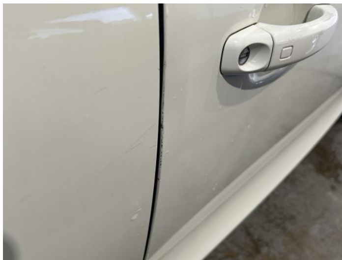
2: Door osf Chipped Edge Chip