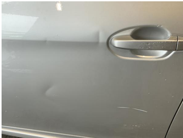
4: Door nsf Dented With Paint Damage