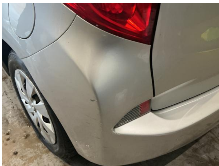
8: Bumper Rear Scratched Over 100mm Thru Paint