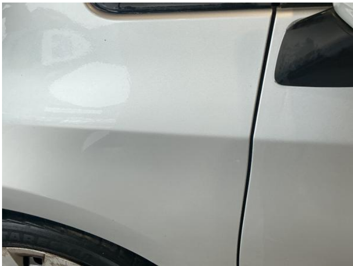
3: Wing nsf Dented Between 10mm + 30mm