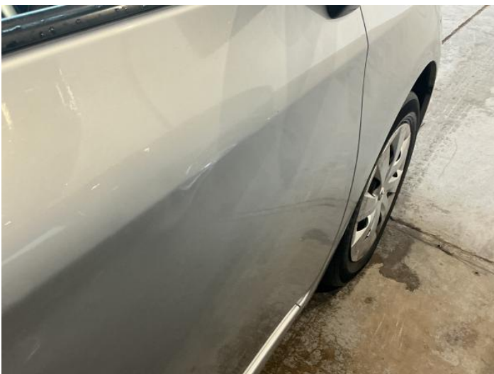
13: Door osf Dented Between 10mm + 30mm