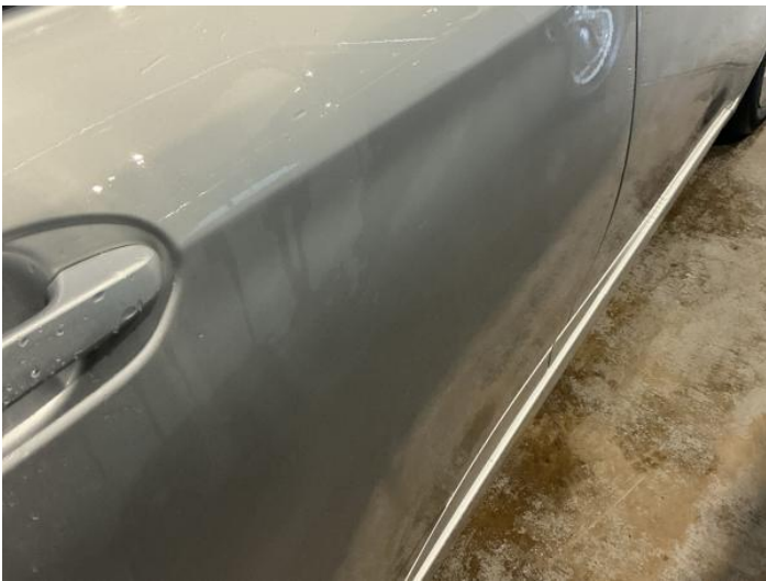
11: Door osr Chipped 1 To 5