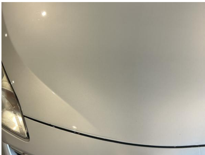
1: Bonnet Chipped 1 To 5