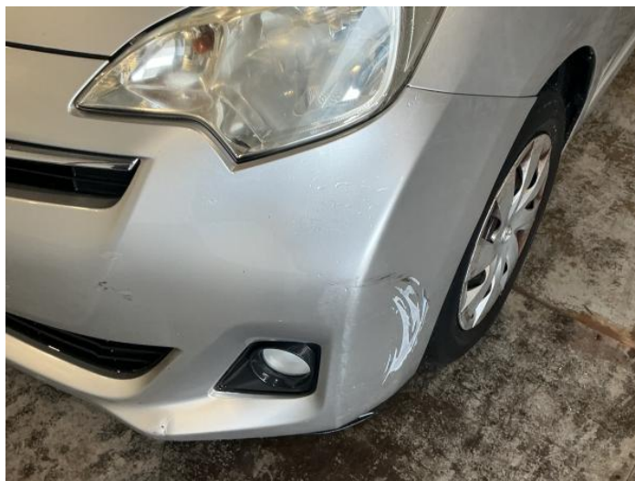
2: Bumper Front Scratched Over 100mm Thru Paint