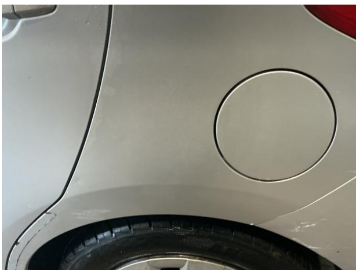
7: Qtr Panel nsr Scratched Over 25mm Thru Paint