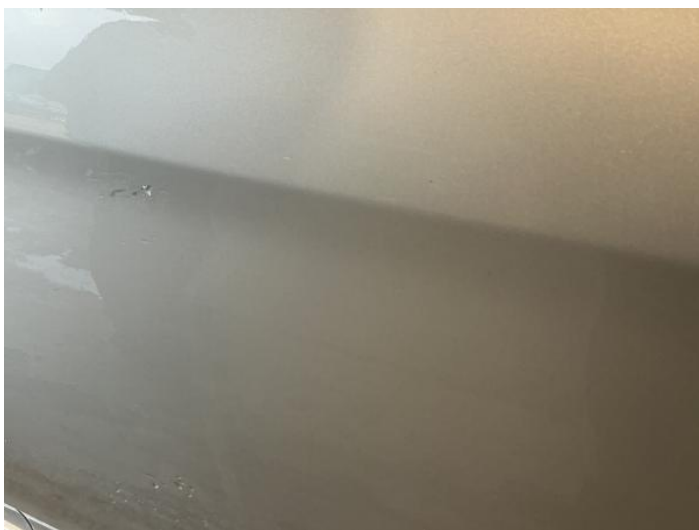
5: Door nsr Chipped 1 To 5