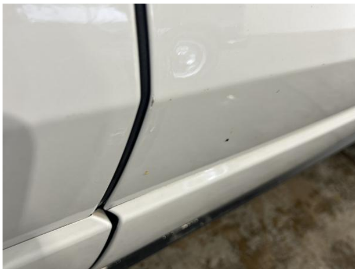
1: Door osf Chipped Edge Chip