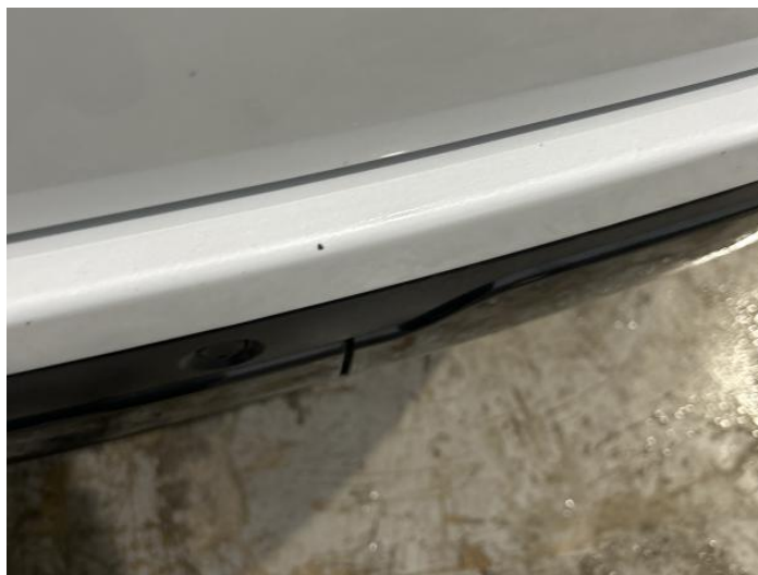
2: Bumper Rear Chipped 1 To 5