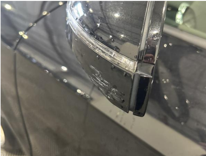
11: Door Mirror Assy nsf Scratched (Painted) Over 25mm Thru Paint