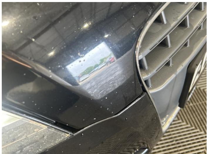
14: Bonnet Chipped Multiple Chips