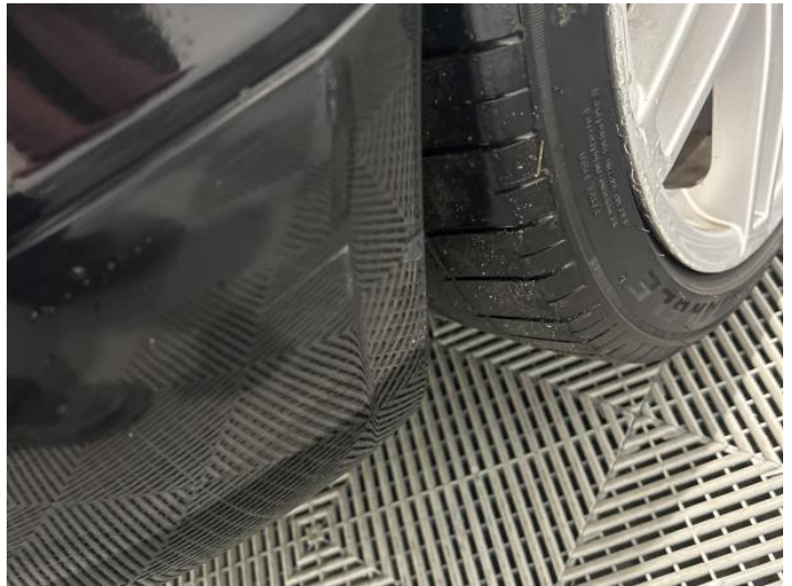
6: Bumper Rear Scratched 25 to 100mm Thru Paint