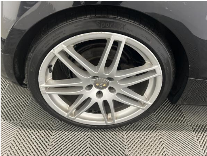
5: Wheel osr Scratched Over 50mm