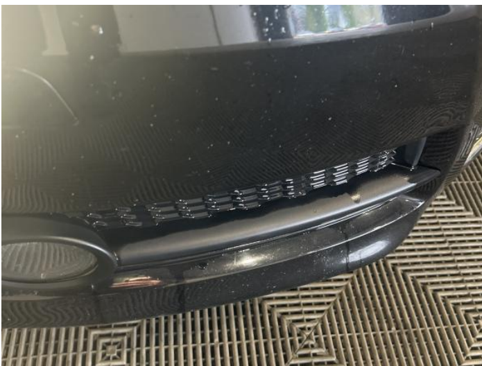
13: Bumper Front Chipped Multiple Chips