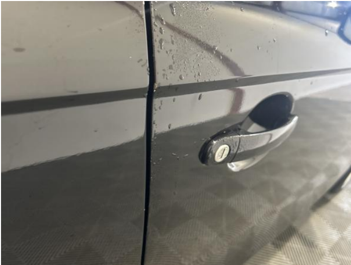
3: Door osf Chipped Edge Chip