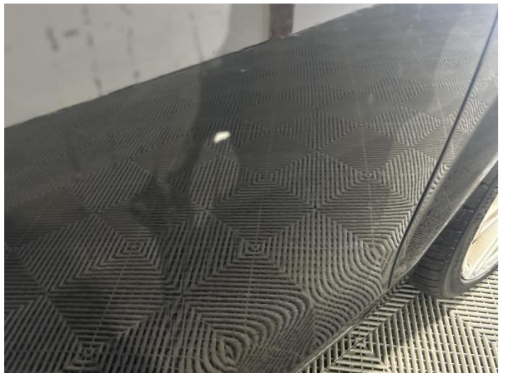
2: Door osf Chipped 1 To 5