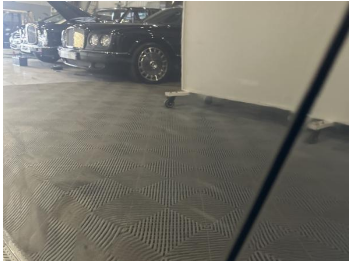
10: Door nsf Scratched Over 25mm Not Thru Paint