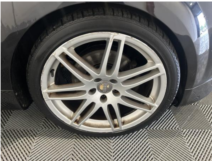
1: Wheel osf Scratched Over 50mm