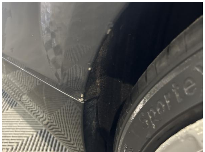
8: Qtr Panel nsr Chipped 1 To 5