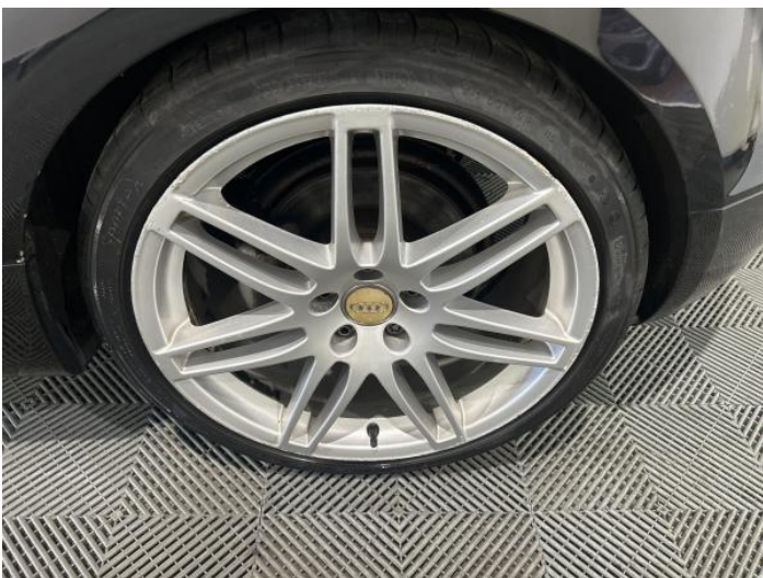
7: Wheel nsr Scratched Over 50mm