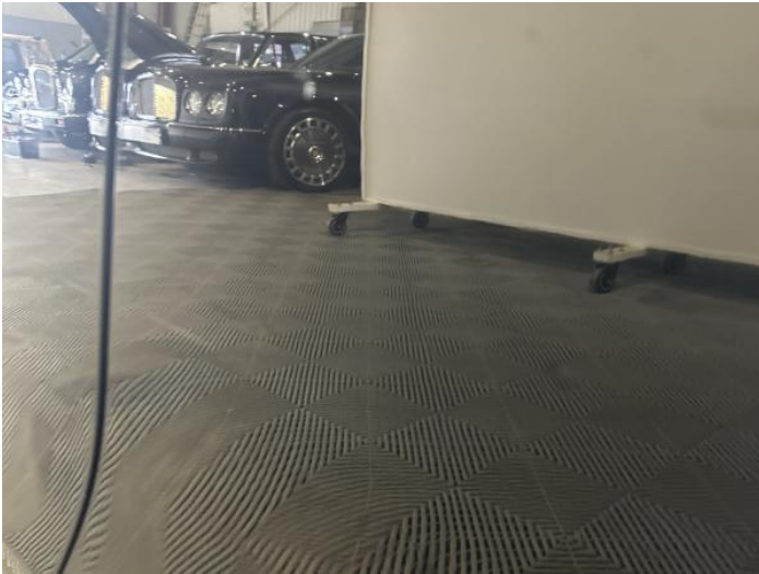
9: Qtr Panel nsr Scratched Over 25mm Not Thru Paint