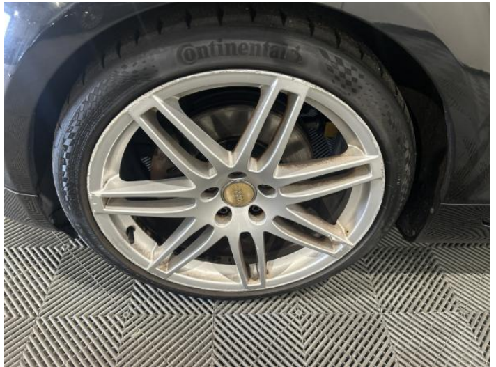
12: Wheel nsf Scratched Over 50mm