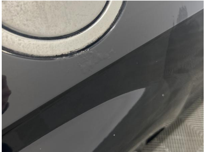
4: Qtr Panel osr Rusted Over 5mm