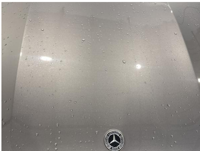
1: Bonnet Chipped 1 To 5