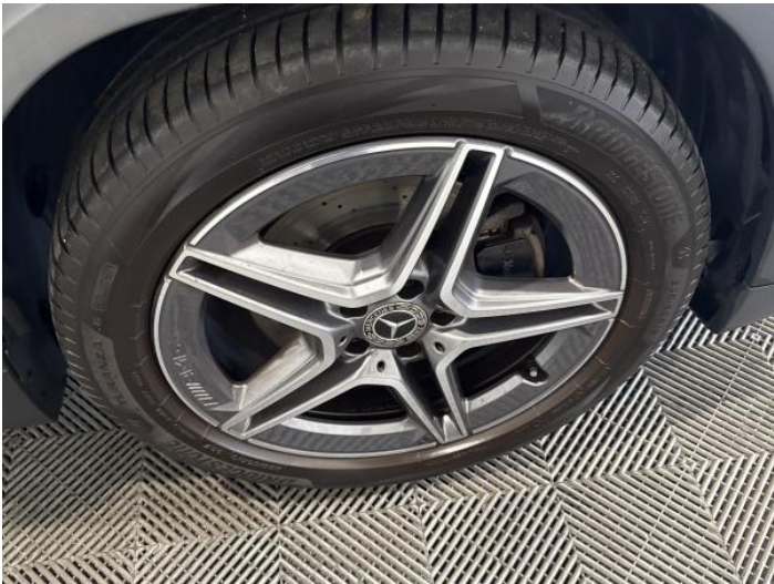
17: Wheel osf Scratched Up To 50mm