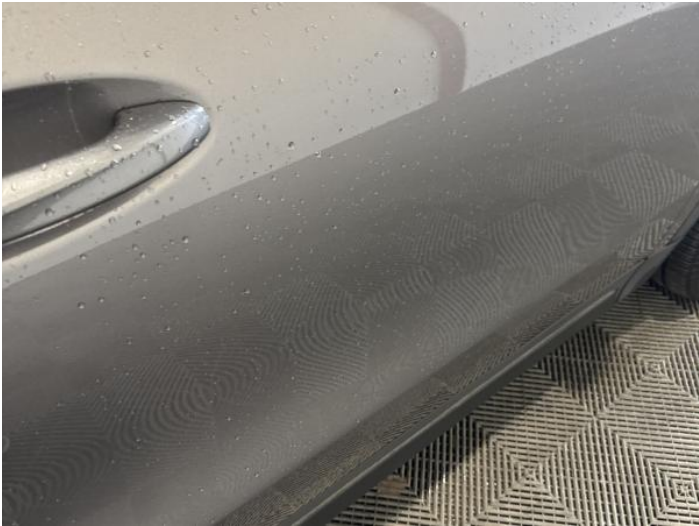
15: Door osf Chipped 1 To 5