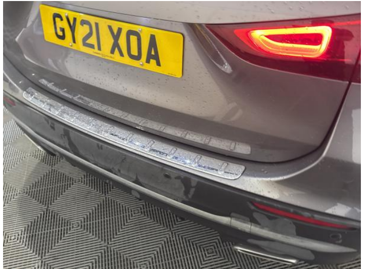
10: Bumper Rear Chipped Multiple Chips