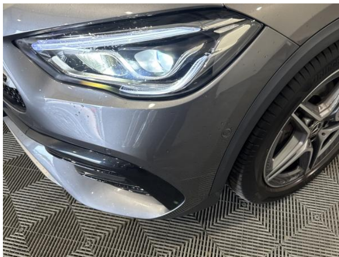
2: Bumper Front Scratched 25 to 100mm Thru Paint