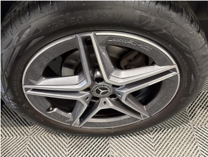
9: Wheel nsr Scratched Up To 50mm