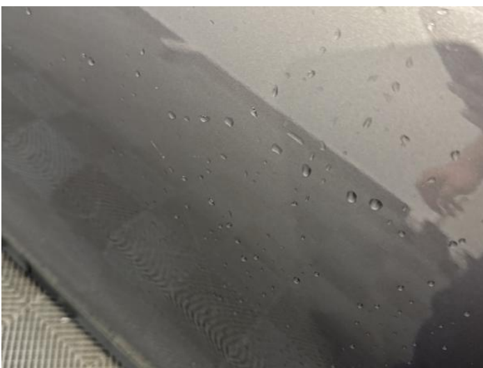
7: Door nsr Scratched Up To 25mm Thru Paint