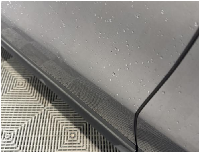
5: Door nsf Dented Between 10mm + 30mm