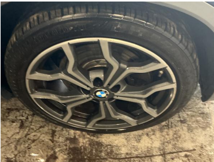
11: Wheel osf Scratched Over 50mm