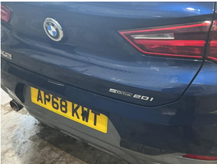
1: Bumper Rear Chipped Multiple Chips