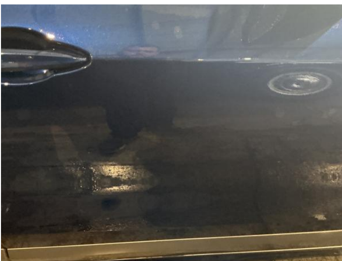
13: Door osf Chipped 1 To 5