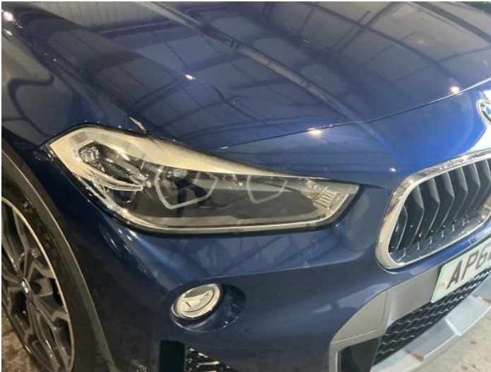
9: Bumper Front Chipped Multiple Chips