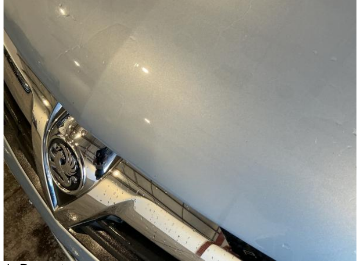
1: Bonnet Chipped 1 To 5