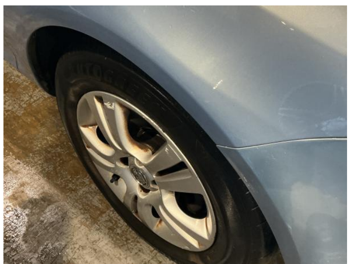
12: Wheel osf Scratched Over 50mm