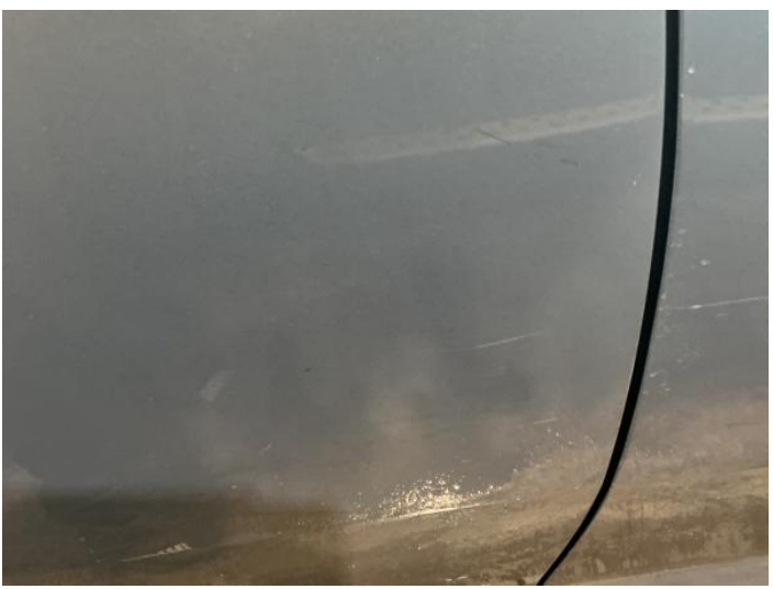
10: Door Moulding osr Scratched (Painted) UpTo 25mm Thru Paint