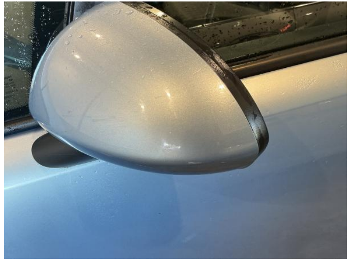
4: Door Mirror Assy nsf Scratched (Painted) Over 25mm Thru Paint