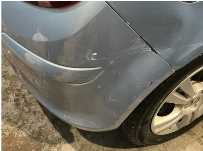
8: Bumper Rear Scratched Over 100mm Thru Paint