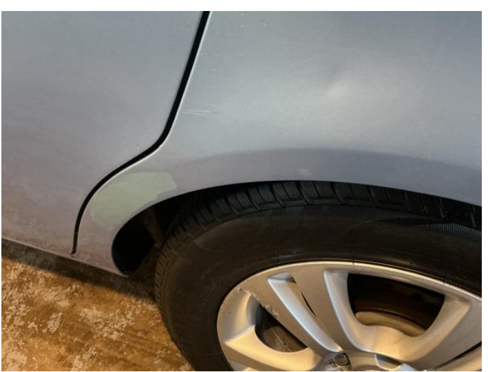
6: Qtr Panel nsr Poor Previous Repair Poor Paint