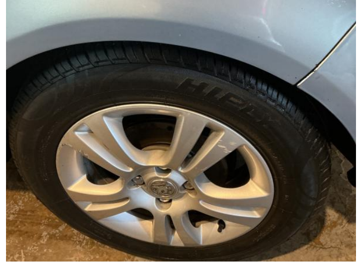
7: Wheel nsr Scratched Over 50mm