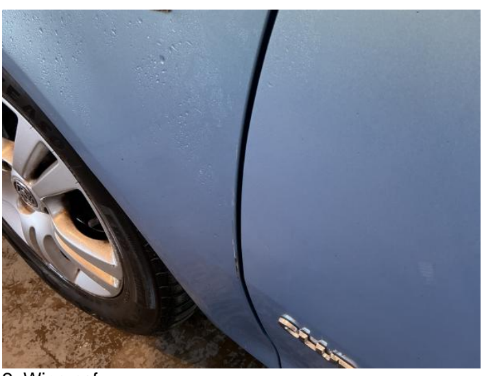
2: Wing nsf Scratched Over 25mm Thru Paint