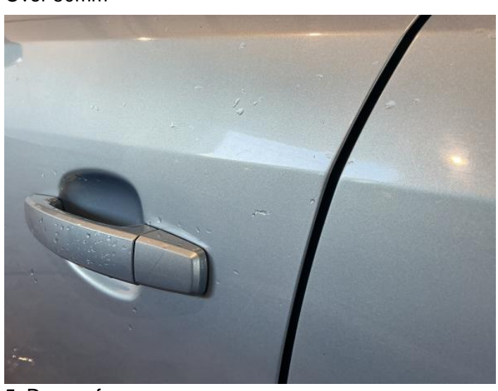
5: Door nsf Chipped Edge Chip