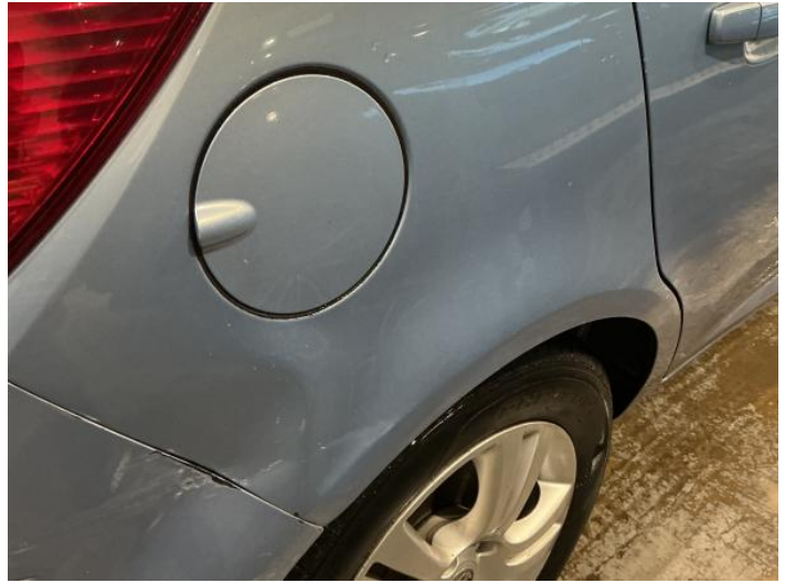
9: Qtr Panel osr Dented With Paint Damage