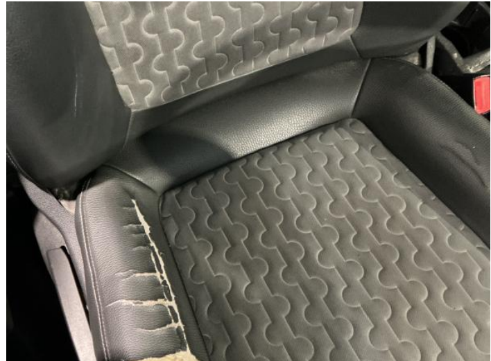
14: Seat Base Cover osf Scuffed Over 25mm