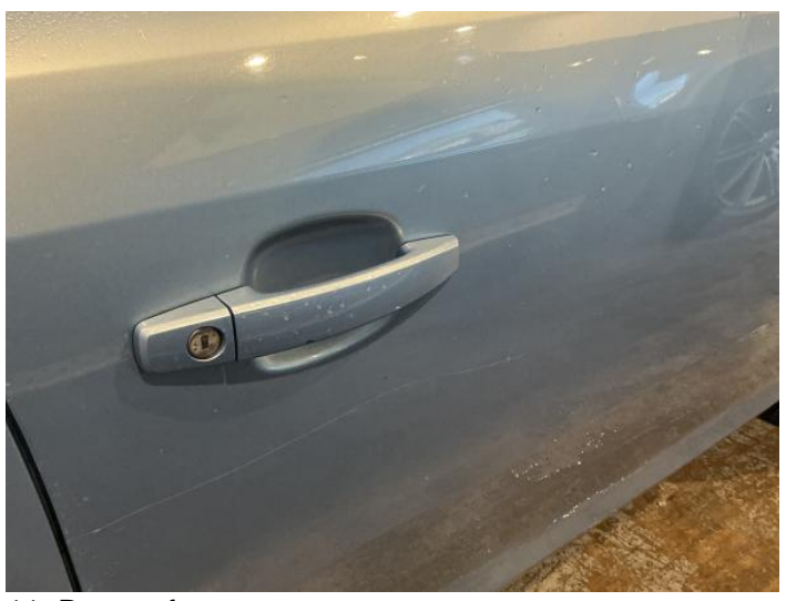
11: Door osf Scratched Over 25mm Thru Paint