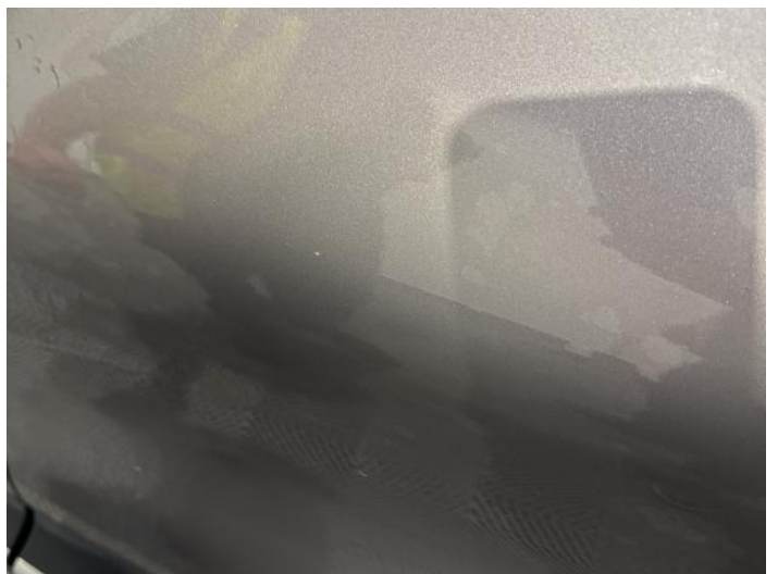
7: Door nsf Scratched Over 25mm Not Thru Paint