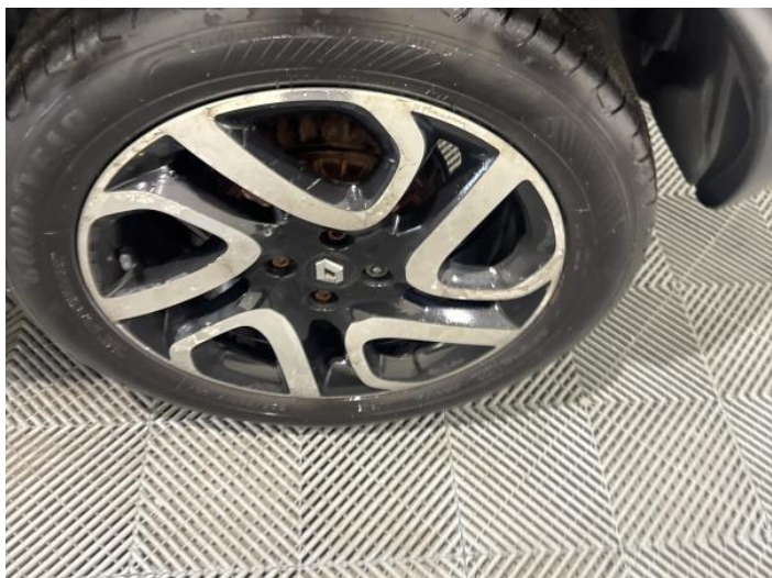
9: Wheel nsr Scratched Over 50mm