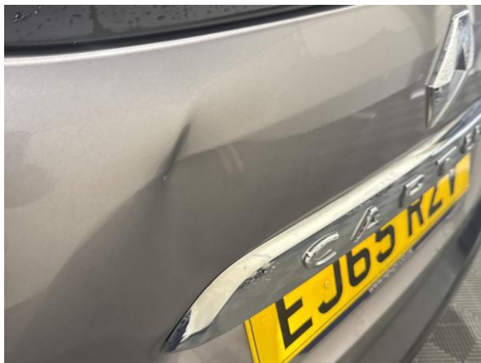
10: Boot Lid Dented Over 30mm