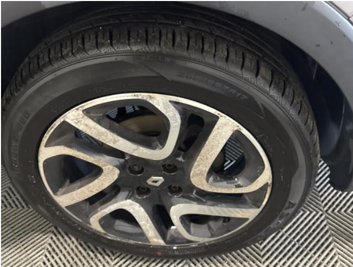
15: Wheel of front Scratched Over 50mm