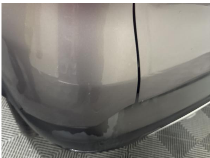
11: Bumper Rear Chipped Multiple Chips