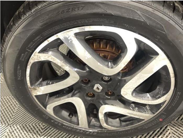
16: Wheel of rear Scratched Over 50mm

Carpet Condition Average Seat Condition Average