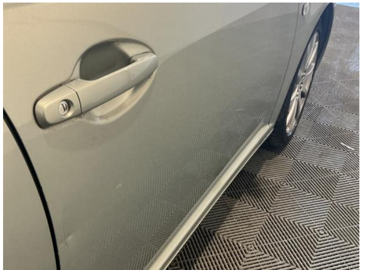
18: Door osf Dented Between 10mm + 30mm