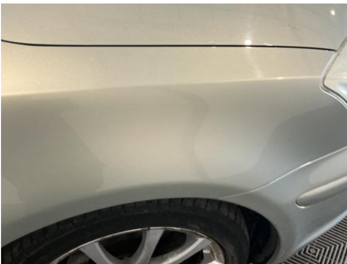
19: Wing osf Chipped 1 To 5