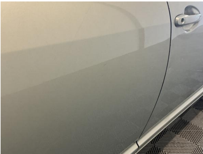
17: Door osr Chipped 1 To 5