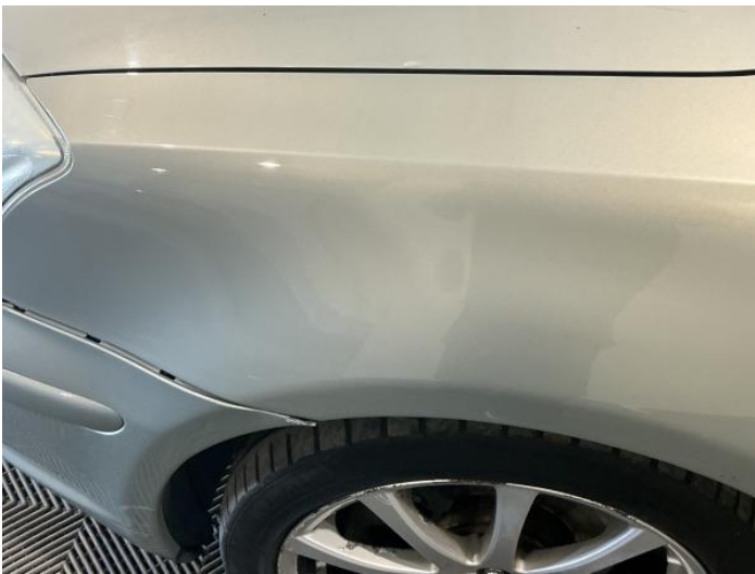
5: Wing nsf Chipped 1 To 5