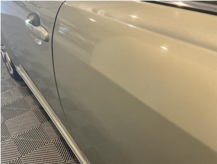
9: Door nsr Dented Over 30mm