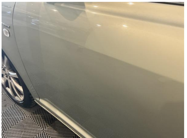
8: Door nsf Dented Between 10mm + 30mm