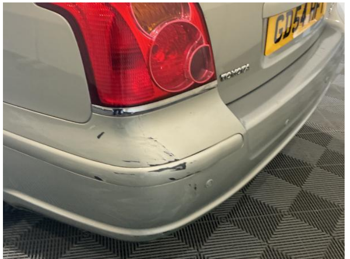
12: Bumper Rear Scratched Over 100mm Thru Paint