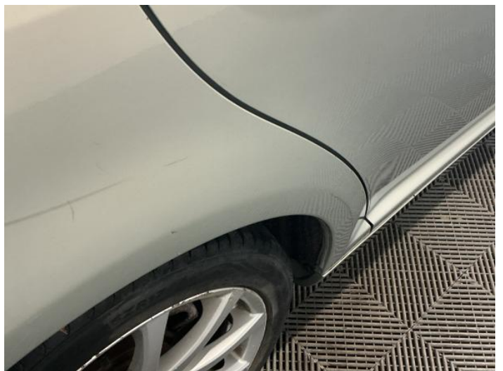
14: Qtr Panel osr Chipped 1 To 5