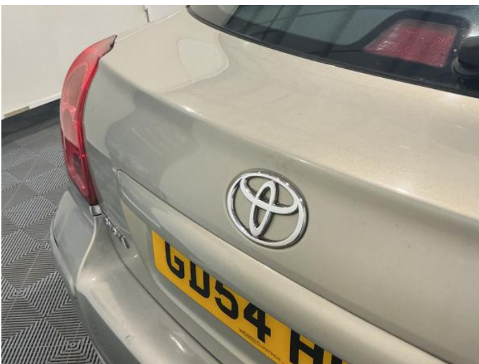
13: Boot Lid Dented 2 Or Less Up To 10mm