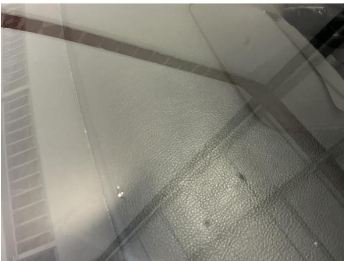
7: Screen Front Chipped UpTo 10mm