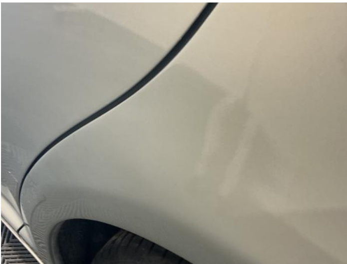
11: Qtr Panel nsr Chipped 1 To 5