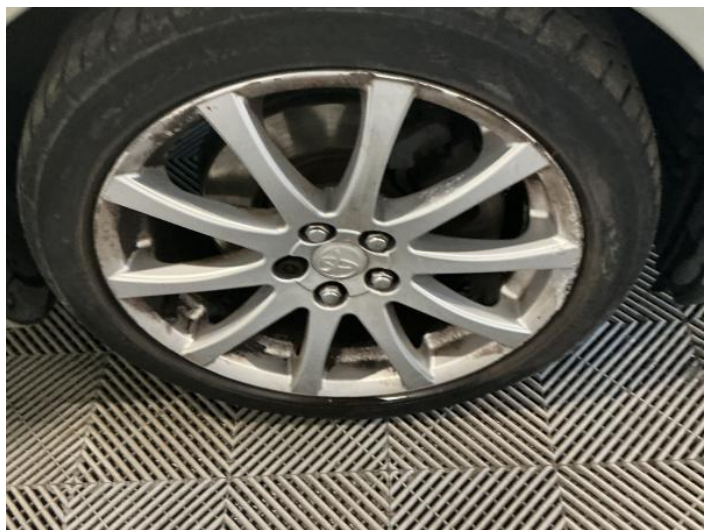
20: Wheel osf Scratched Over 50mm