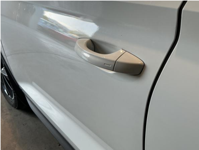
3: Door nsf Poor Previous Repair Poor Paint