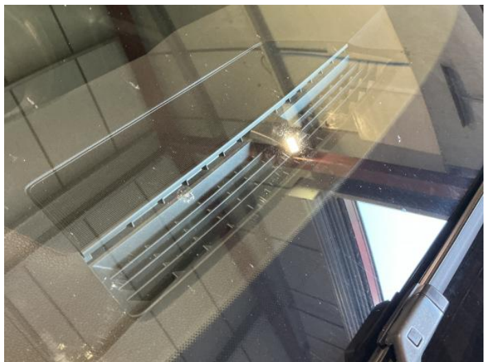
8: Screen Front Chipped Over 10mm