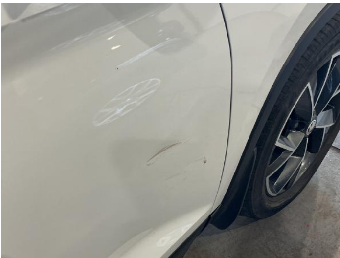
7: Door osf Dented With Paint Damage