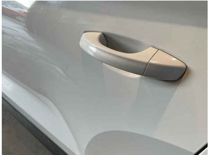
4: Door nsr Dented Between 10mm + 30mm