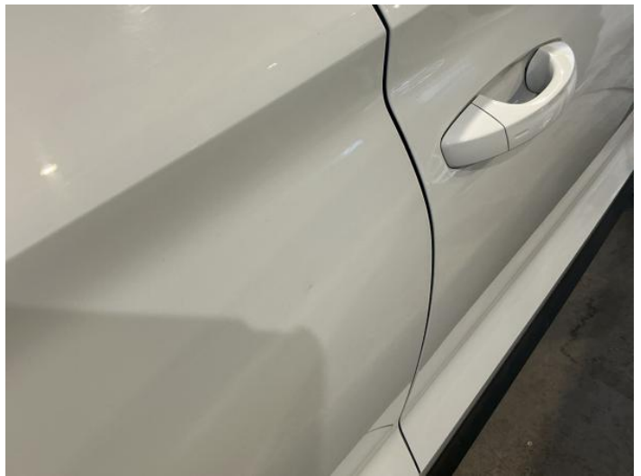
6: Door osr Dented Between 10mm + 30mm