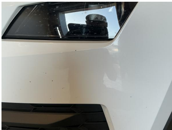
2: Bumper Front Chipped 1 To 5