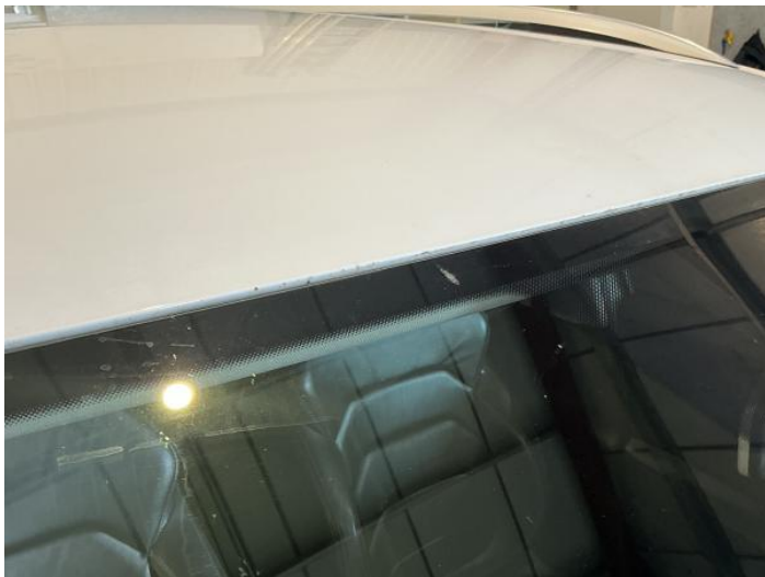
9: Roof Chipped 1 To 5