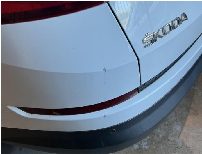
5: Bumper Rear Dented With Paint Damage