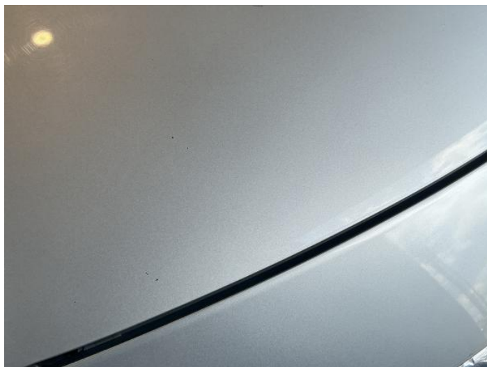
2: Bonnet Chipped 1 To 5