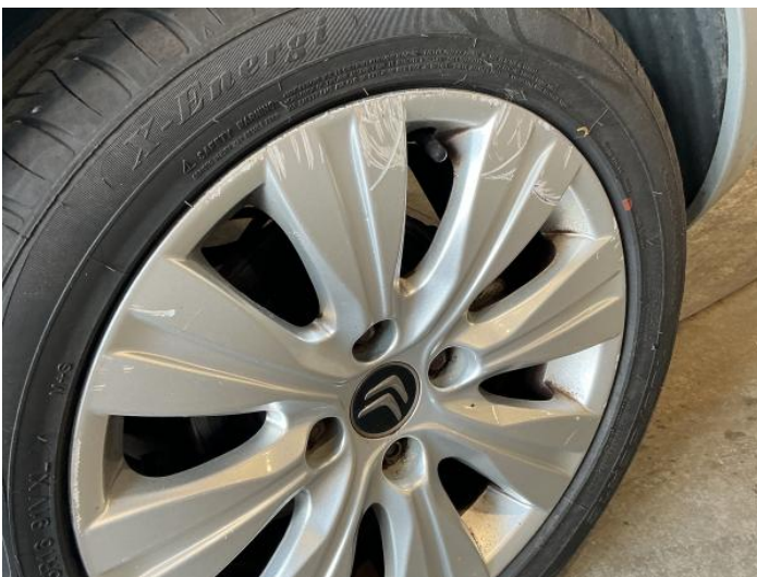
7: Wheel nsr Scratched Over 50mm