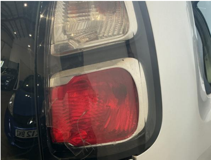
11: Lamp nsr Broken Replace