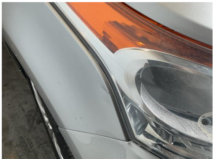
14: Wing osf Dented Between 10mm + 30mm