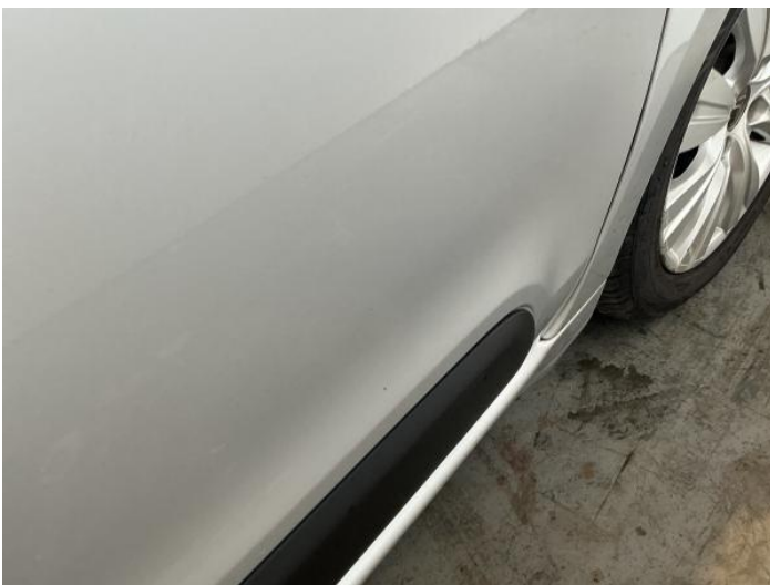
13: Door osf Dented Over 30mm