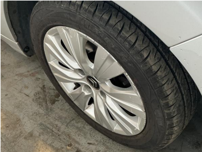
15: Wheel osf Scratched Over 50mm