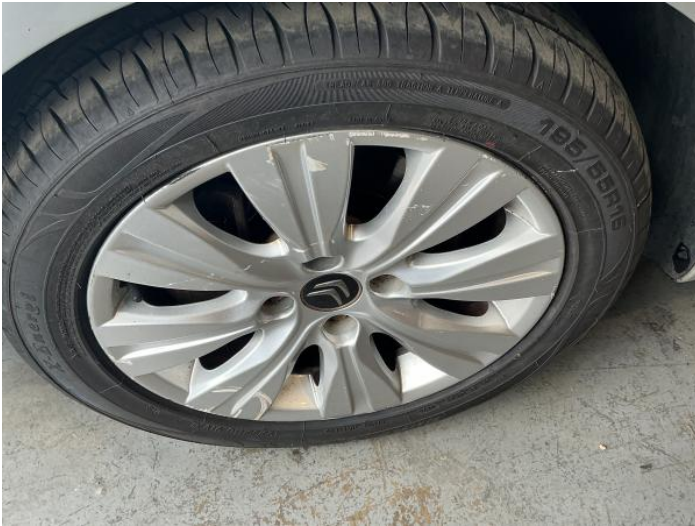
3: Wheel nsf Scratched Over 50mm