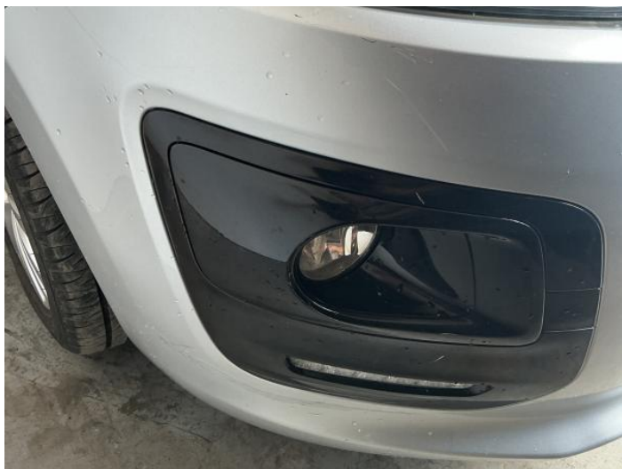
1: Bumper Front Scratched Over 100mm Thru Paint