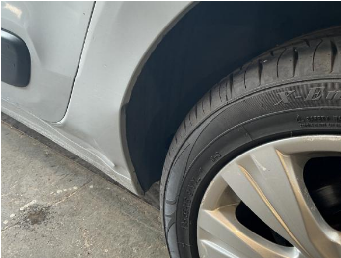
9: Qtr Panel nsr Dented With Paint Damage