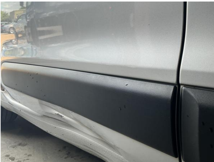
5: Door nsf Dented Over 30mm