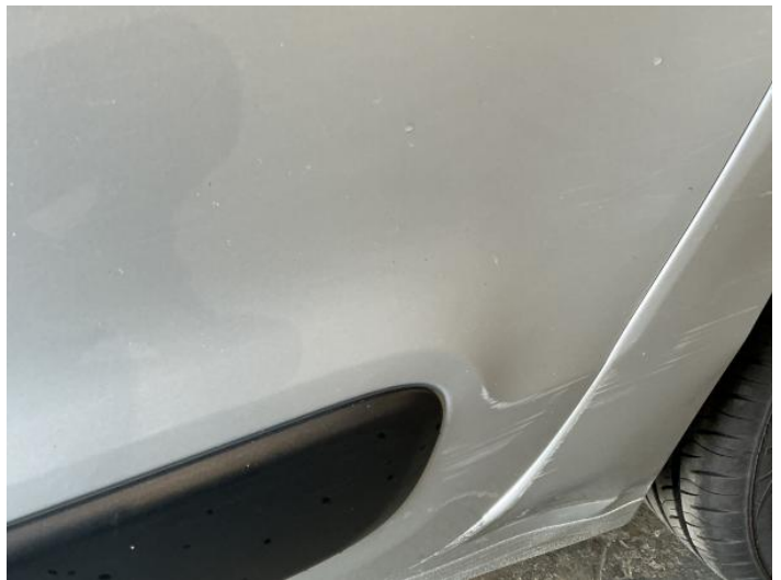
6: Door nsr Dented With Paint Damage