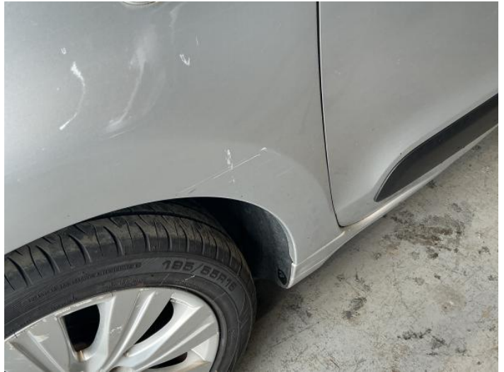
4: Wing nsf Scratched Over 25mm Thru Paint