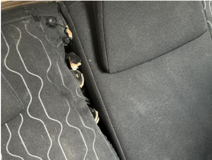
16: Seat Back Cover osr Torn Over 3mm