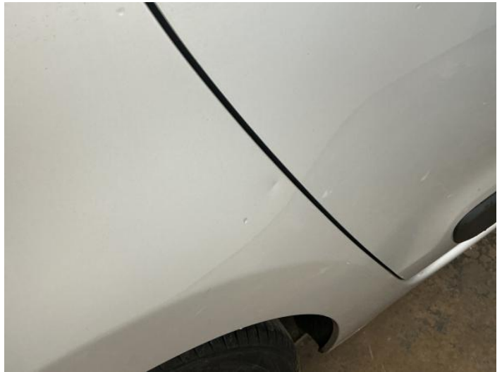
12: Qtr Panel nsr Dented Between 10mm + 30mm