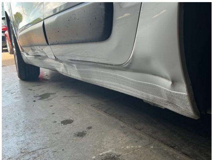
8: Sill ns Dented Over 30% Of Panel