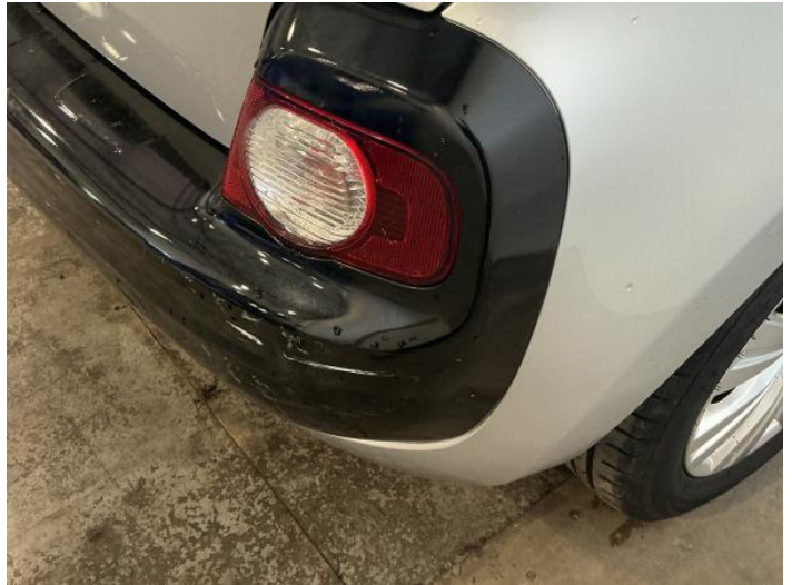
10: Bumper Rear Scratched Over 100mm Thru Paint