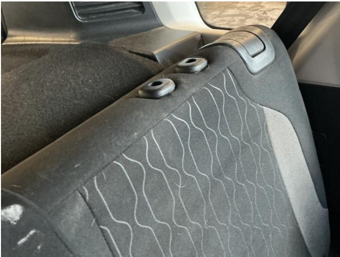
17: Headrest Assy Rear Seat ns Missing Replace