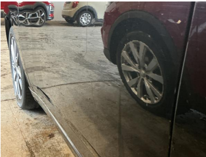
5: Door nsf Dented With Paint Damage