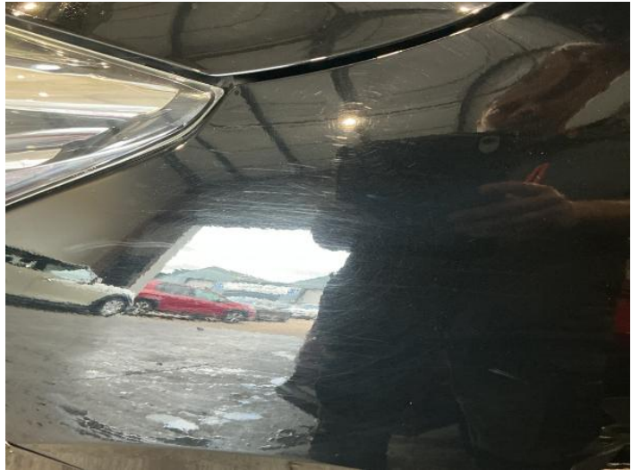
4: Wing nsf Scratched Over 25mm Thru Paint