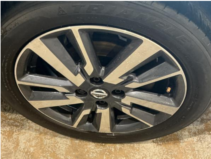
11: Wheel osf Scratched Over 50mm