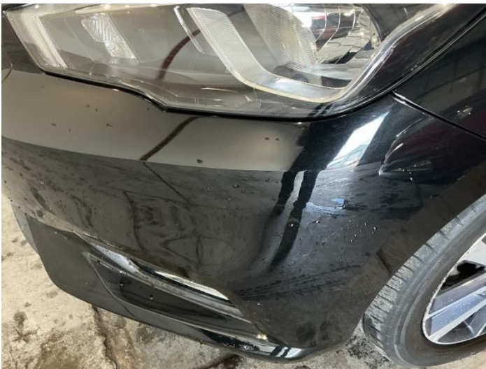
1: Bumper Front Scratched Over 100mm Thru Paint