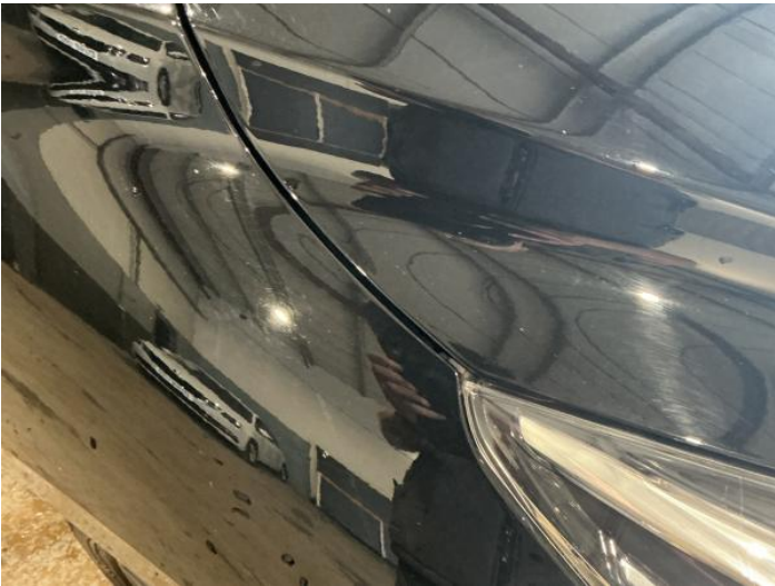
12: Wing osf Chipped 1 To 5