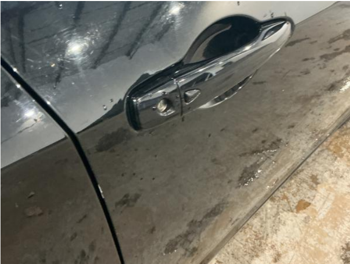
10: Door osf Chipped Edge Chip