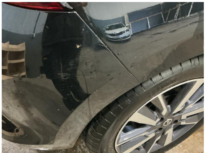
8: Bumper Rear Scratched Over 100mm Thru Paint