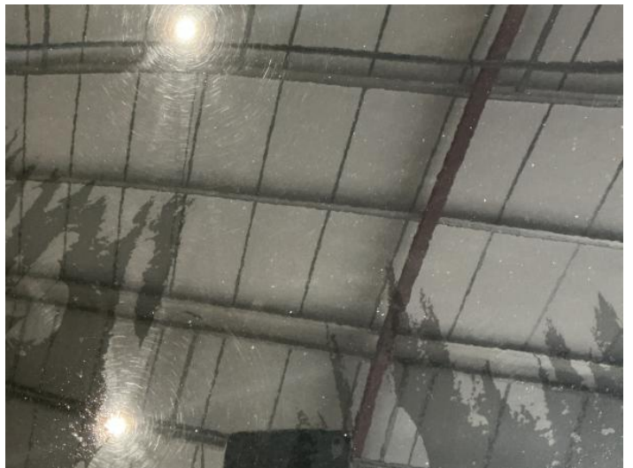
2: Bonnet Chipped Multiple Chips