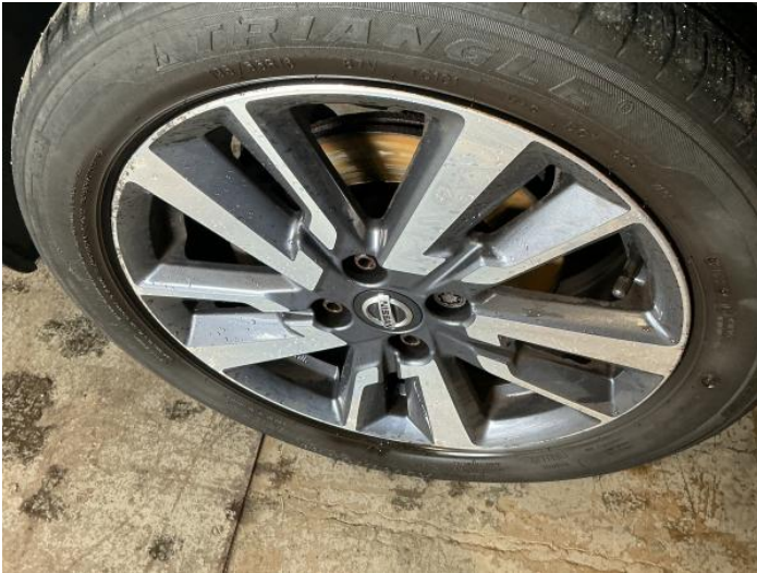
3: Wheel nsf Scratched Over 50mm