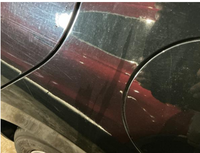
7: Qtr Panel nsr Scratched Over 25mm Thru Paint