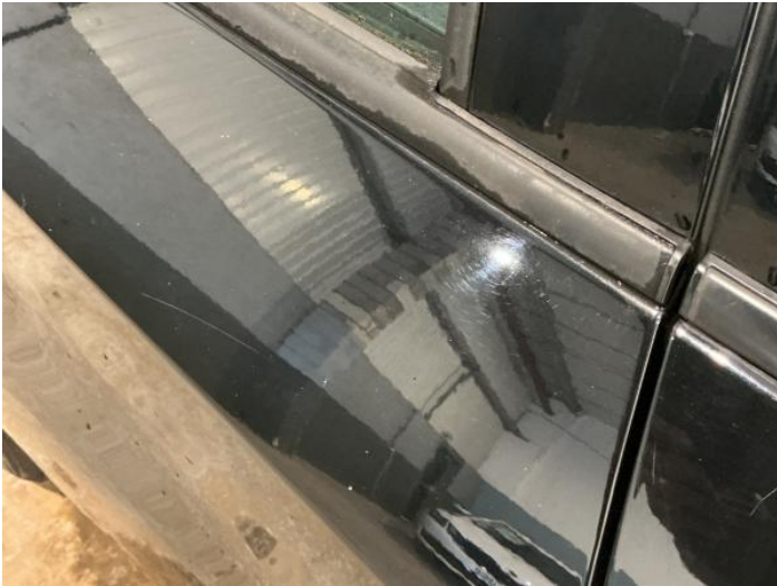
9: Door osr Scratched Over 25mm Thru Paint