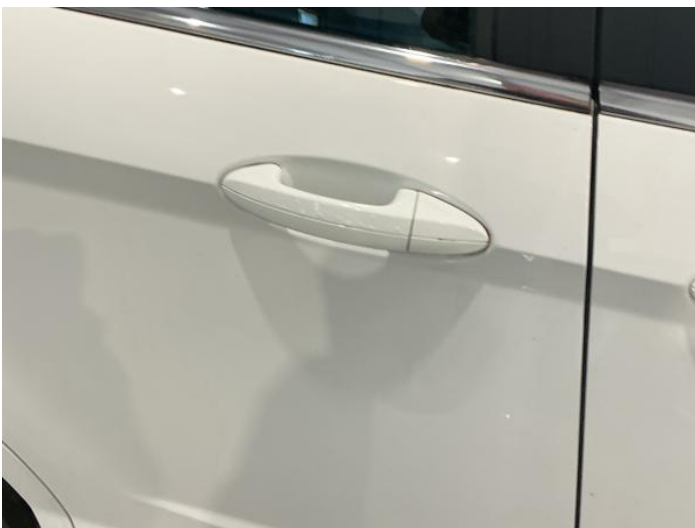
7: Door osr Chipped 1 To 5