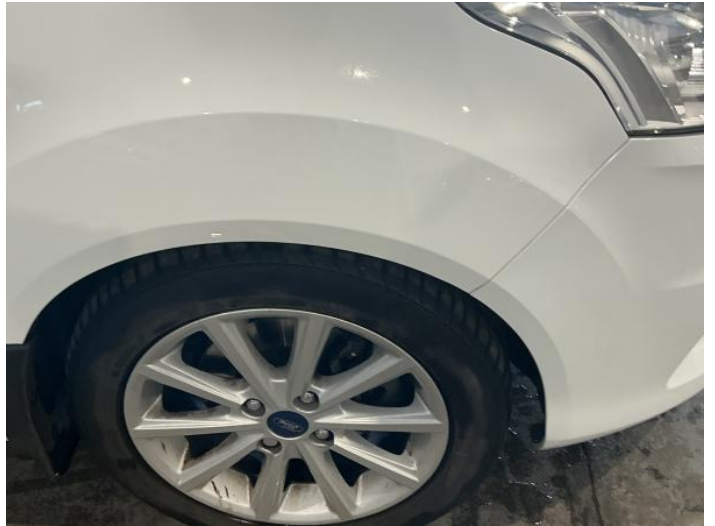
4: Wheel osf Scratched Up To 50mm