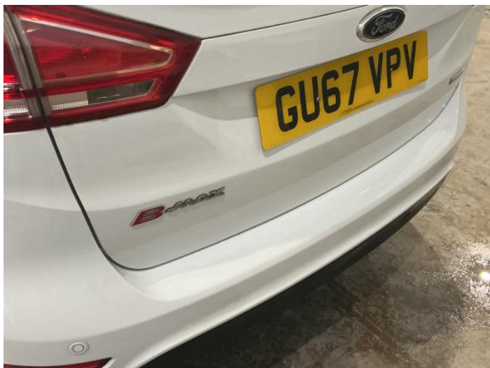
9: Bumper Rear Chipped Multiple Chips