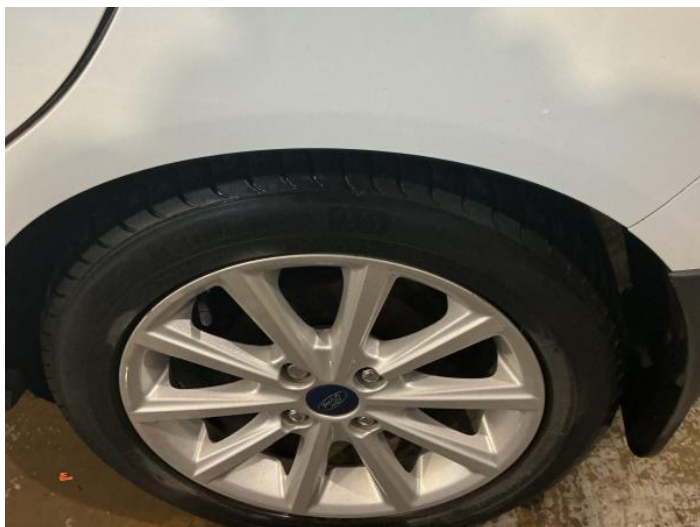
13: Wheel nsr Scratched Up To 50mm