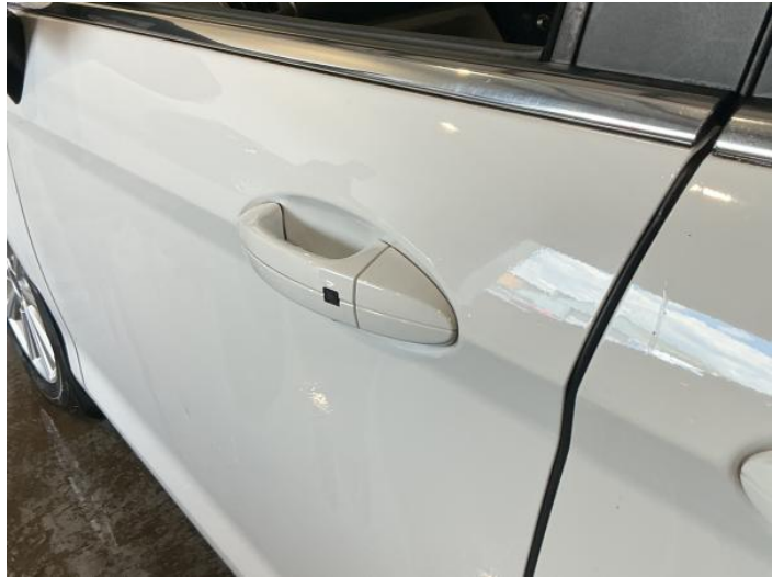
15: Door nsr Scratched Over 25mm Not Thru Paint