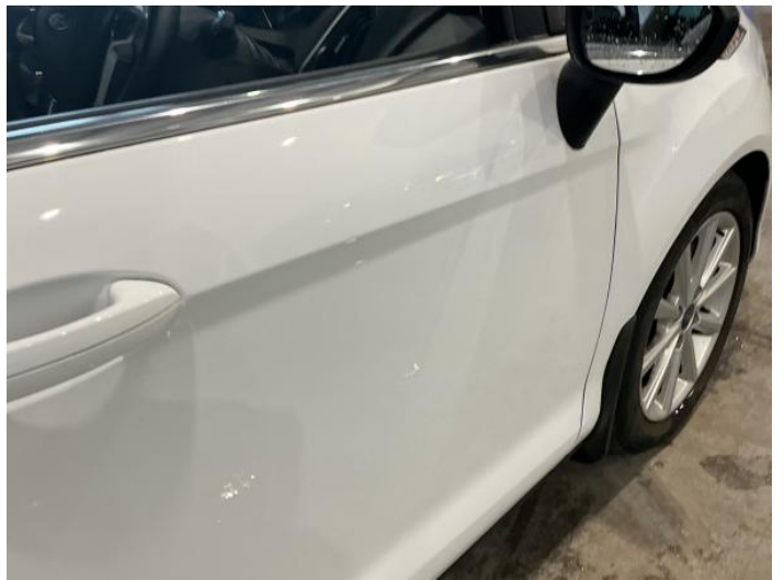
6: Door osf Chipped 1 To 5