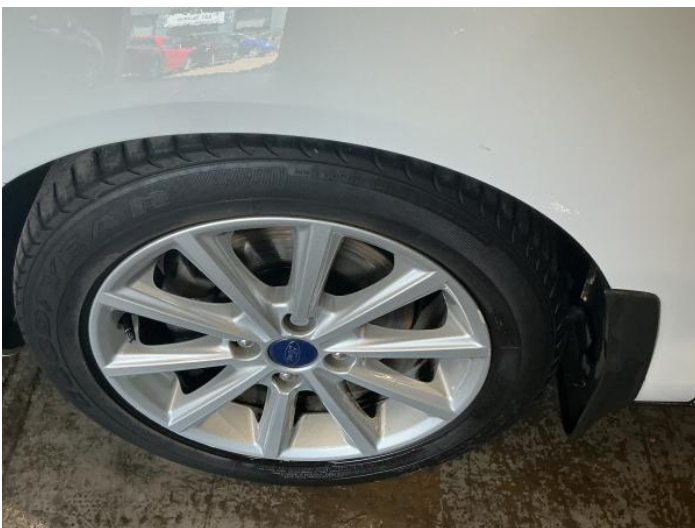
19: Wheel nsf Scratched Up To 50mm