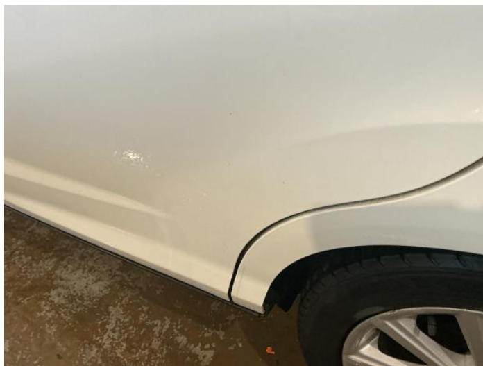
14: Door nsr Dented 2 Or Less UpTo 10mm