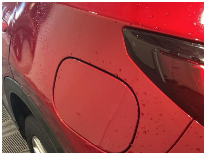
8: Qtr Panel nsr Dented Over 30mm