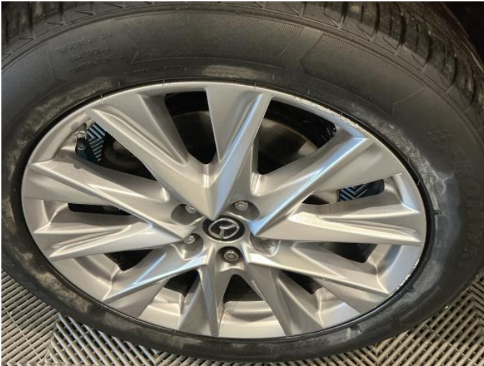
3: Wheel nsf Scratched Over 50mm