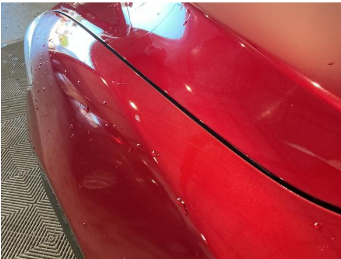
5: Wing nsf Poor Previous Repair Rippled UpTo 30%