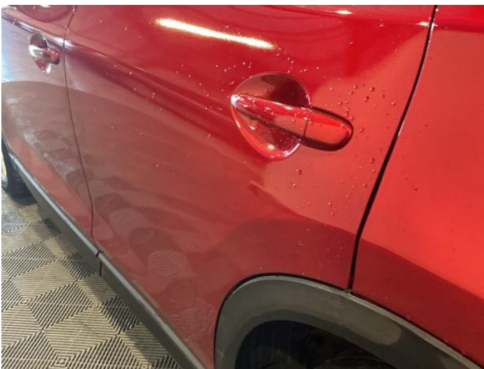
7: Door nsr Poor Previous Repair Rippled UpTo 30%