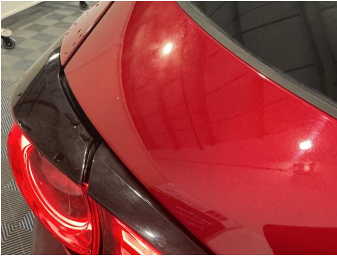
9: Tailgate Scratched Over 25mm Not Thru Paint