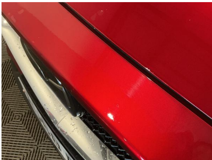
1: Bumper Front Moulding Scratched (Painted) UpTo 25mm Thru Paint