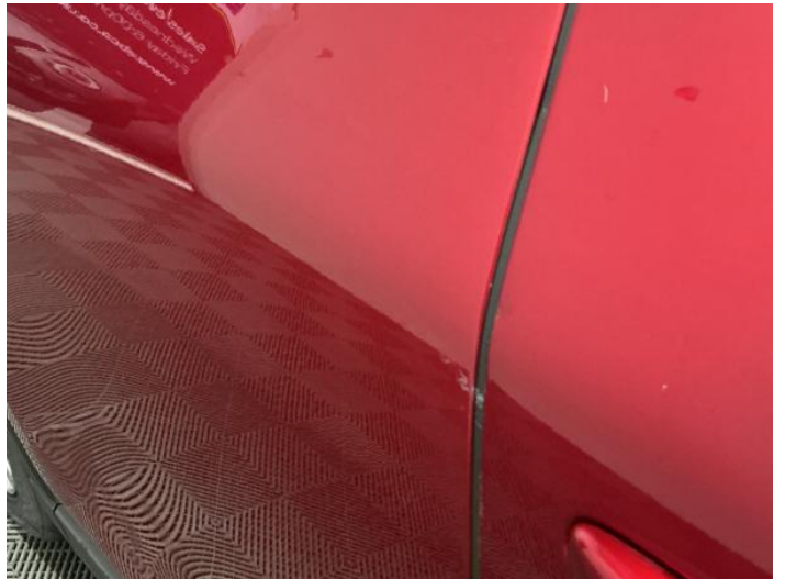
12: Door Moulding osr Scratched (Painted) UpTo 25mm Thru Paint