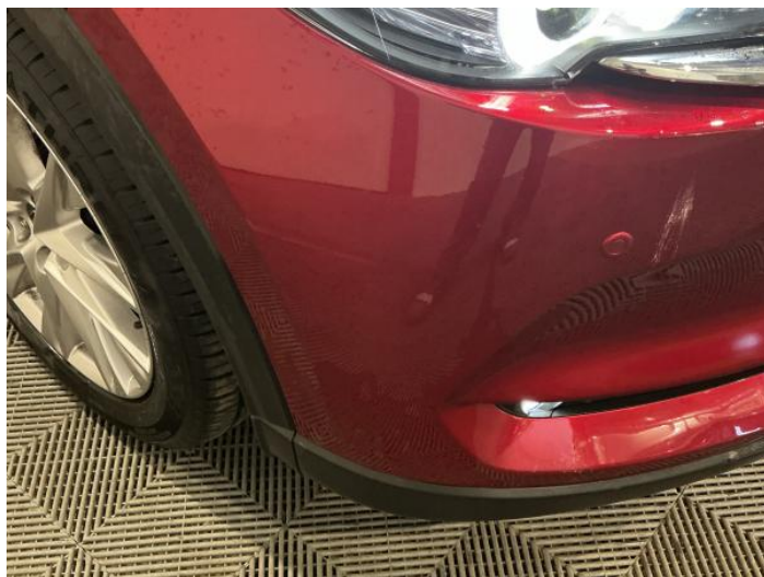
2: Bumper Front Scratched 25 to 100mm Thru Paint