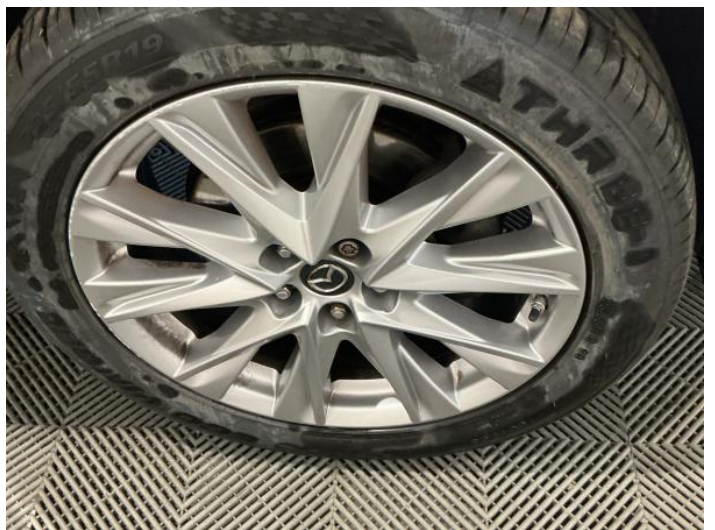
14: Wheel osf Scratched Over 50mm