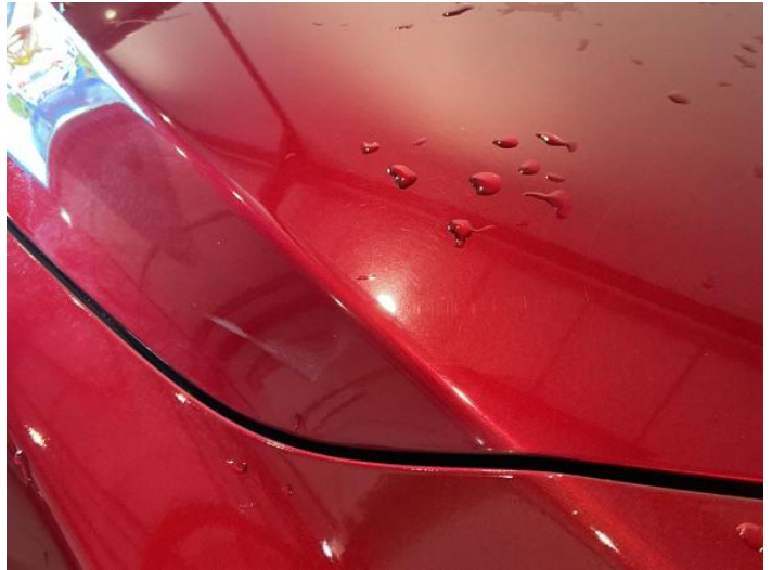
4: Bonnet Scratched Over 25mm Not Thru Paint