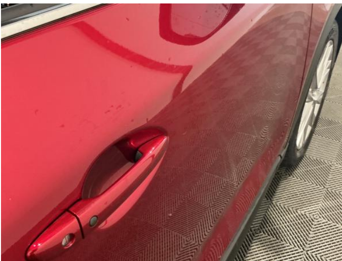
13: Door osf Dented Between 10mm + 30mm