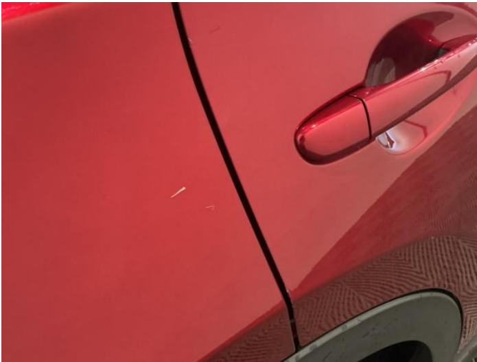
11: Qtr Panel nsr Dented Between 10mm + 30mm