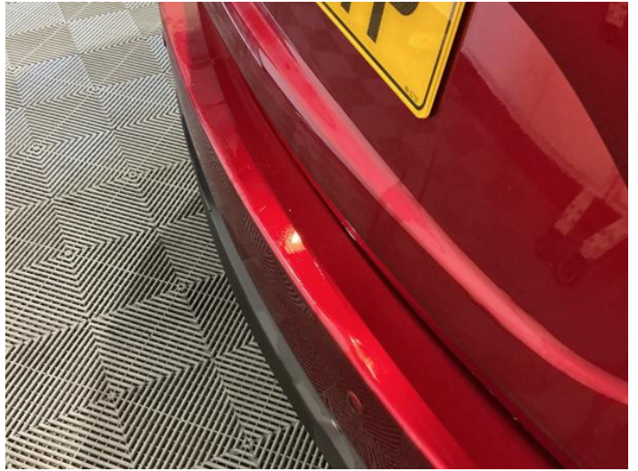
10: Bumper Rear Scratched 25 to 100mm Thru Paint