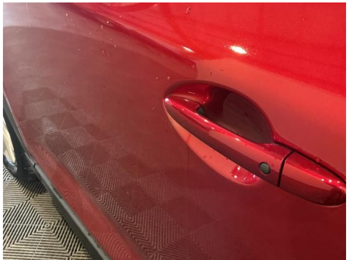
6: Door nsf Poor Previous Repair Poor Paint