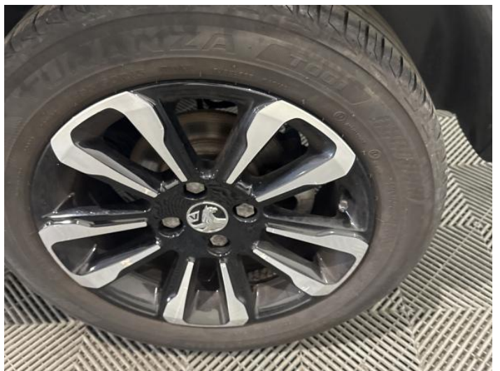
8: Wheel nsr Scratched Up To 50mm