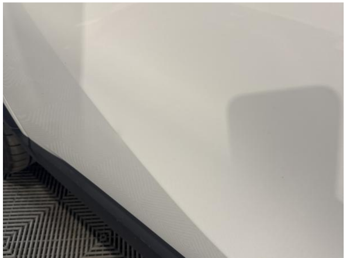
6: Door nsf Dented Between 10mm + 30mm