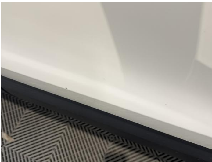
7: Door nsr Chipped 1 To 5