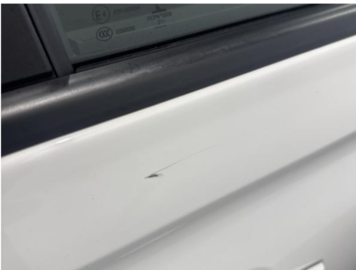
13: Door osr Scratched UpTo 25mm Thru Paint