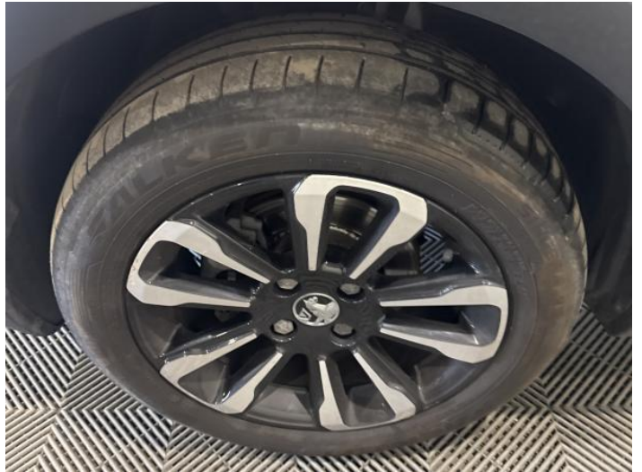
4: Wheel nsf Scratched Over 50mm