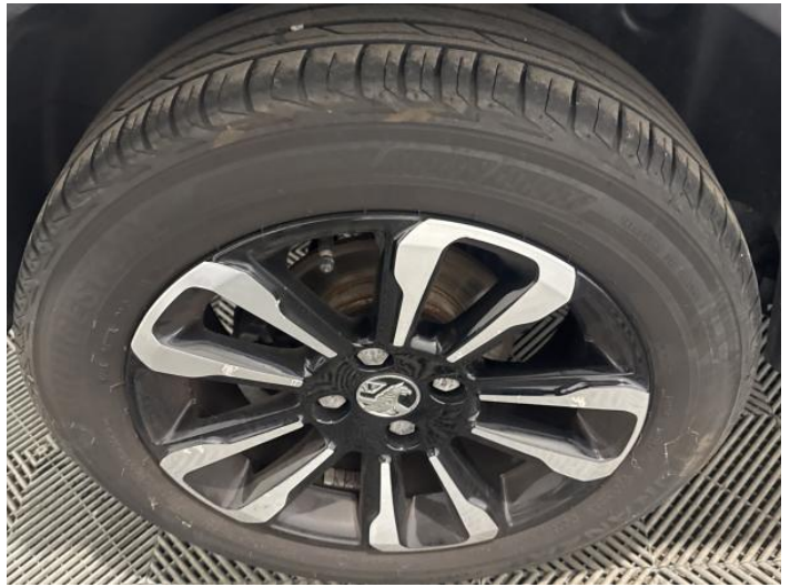
12: Wheel osr Scratched Over 50mm