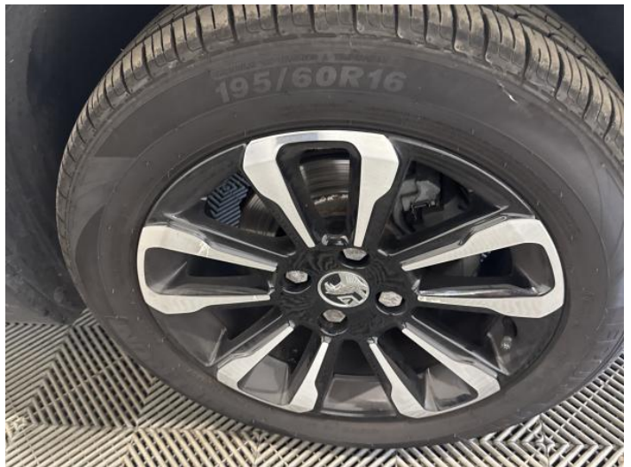
16: Wheel osf Scratched Up To 50mm