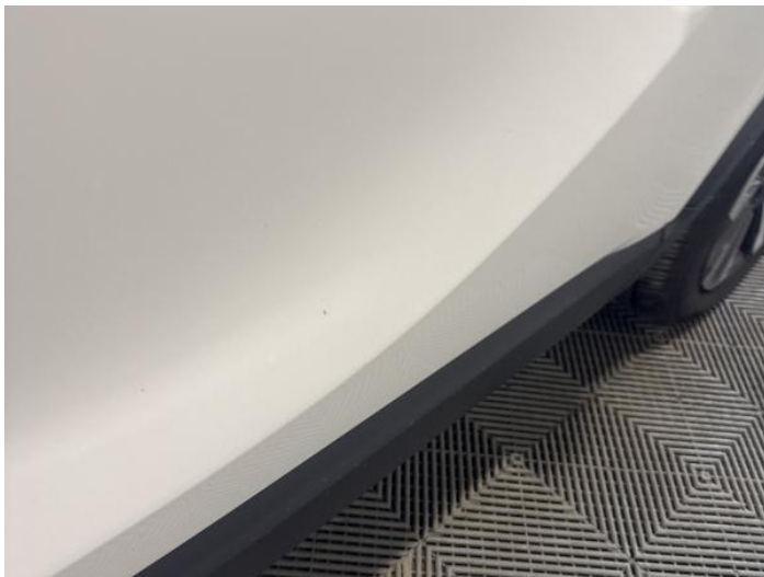
15: Door osf Chipped 1 To 5