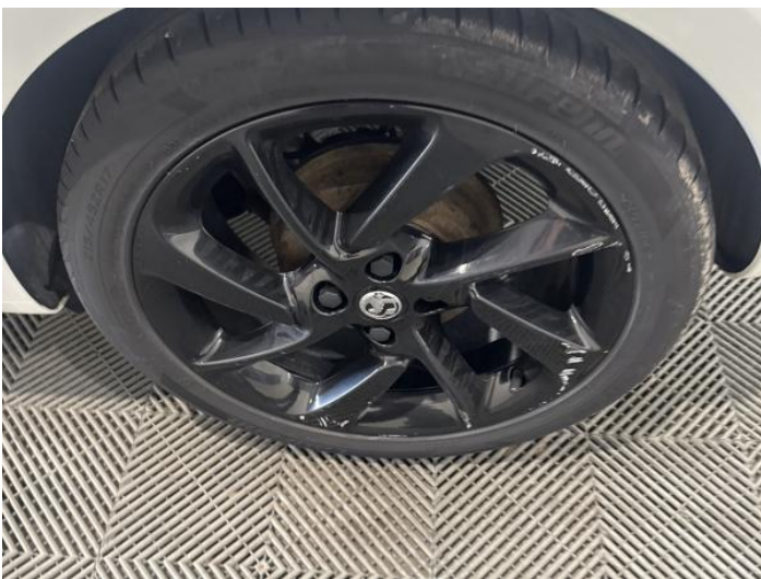
7: Wheel nsr Scratched Over 50mm