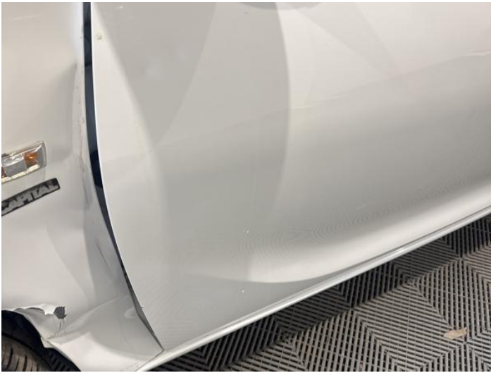
5: Door nsf Dented Over 30mm