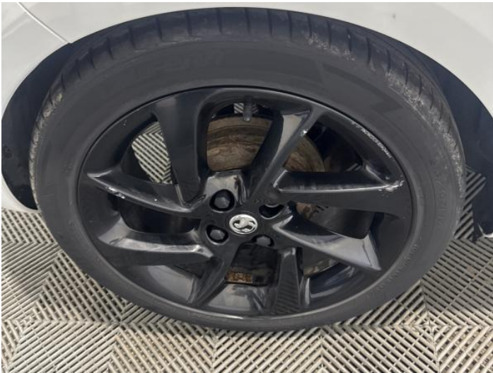
11: Wheel osr Scratched Over 50mm