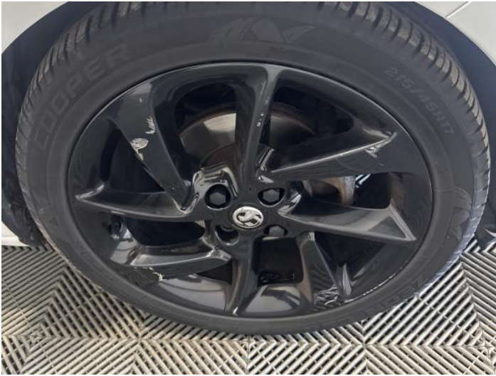
15: Wheel osf Scratched Over 50mm