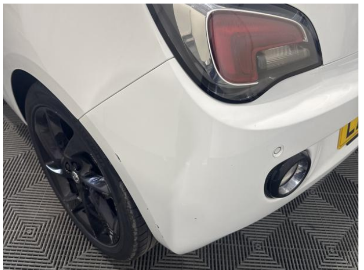
8: Bumper Rear Scratched Over 100mm Thru Paint