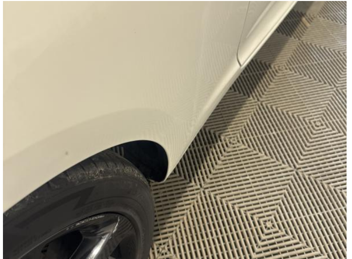
10: Qtr Panel osr Dented Between 10mm + 30mm