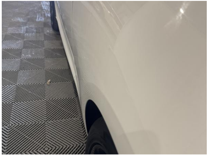
6: Qtr Panel nsr Dented Over 2 UpTo 10mm