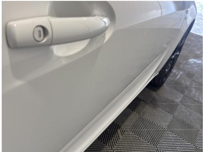
12: Door osf Dented Over 2 UpTo 10mm