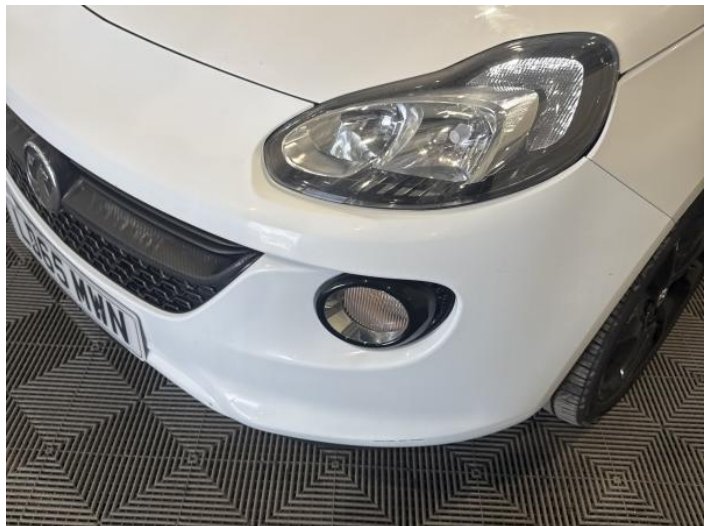
2: Bumper Front Poor Previous Repair Poor Paint