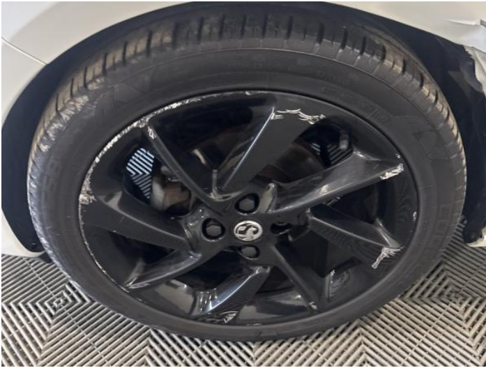
3: Wheel nsf Scratched Over 50mm