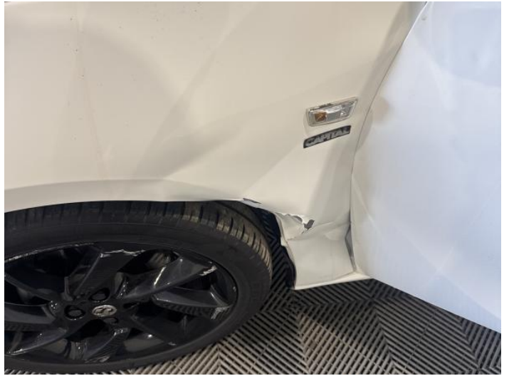
4: Wing nsf Dented Over 30% Of Panel