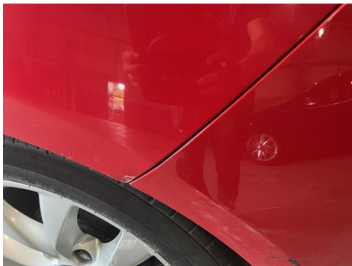
15: Roof Chipped 1 To 5