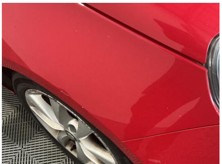
14: Wing osf Dented With Paint Damage