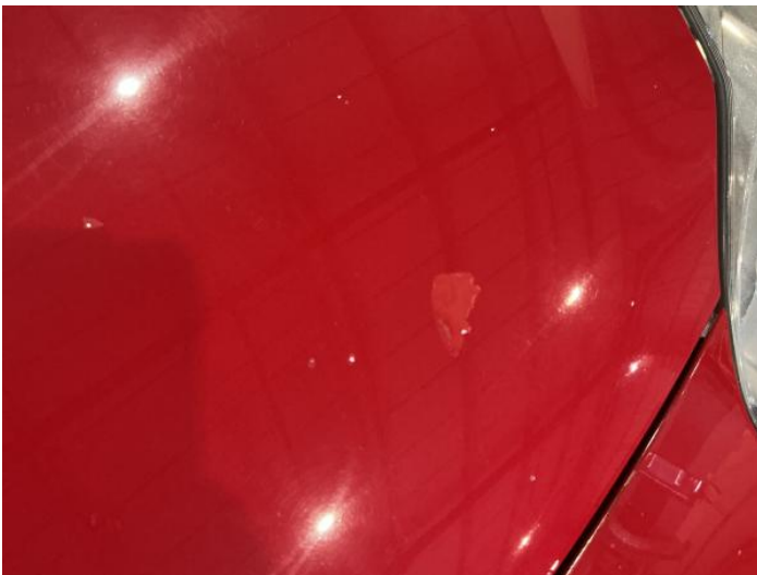
1: Bonnet Poor Previous Repair Paint Flake