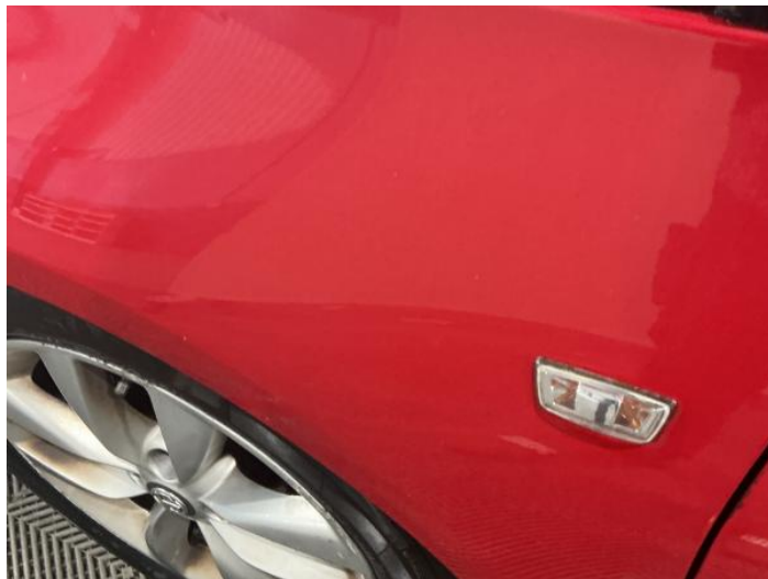
4: Wing nsf Chipped 1 To 5