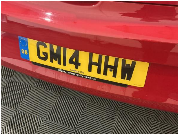
9: Bumper Rear Chipped Multiple Chips