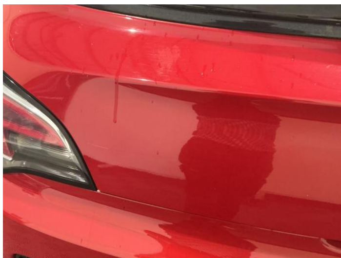
8: Tailgate Scratched Over 25mm Thru Paint