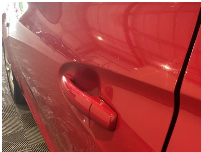
6: Door nsf Dented Over 30mm