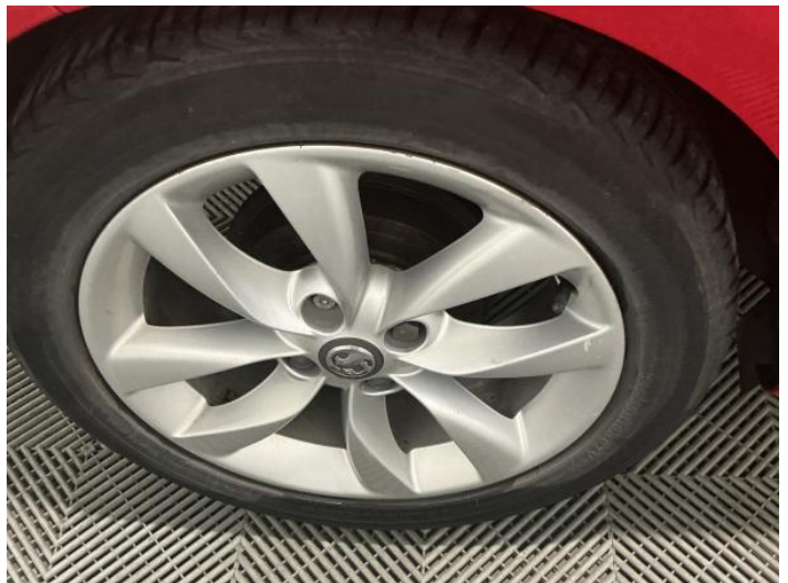
10: Wheel osr Scratched Over 50mm