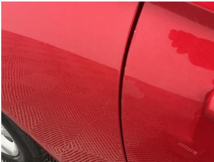
11: Qtr Panel osr Scratched UpTo 25mm Thru Paint