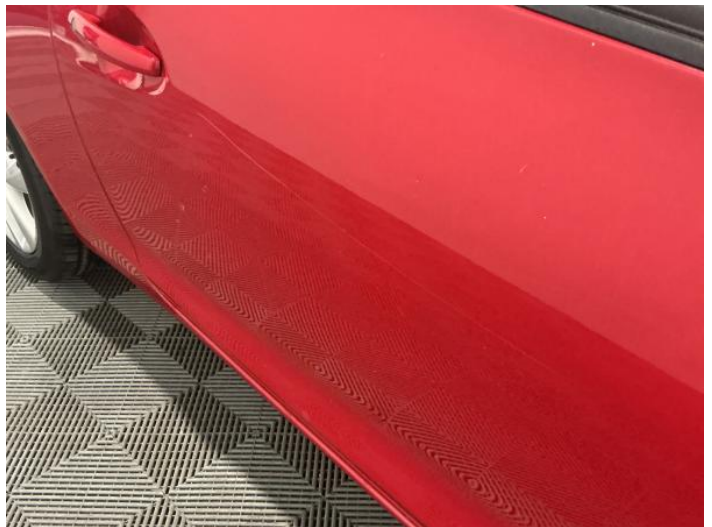
12: Door osf Scratched Over 25mm Thru Paint