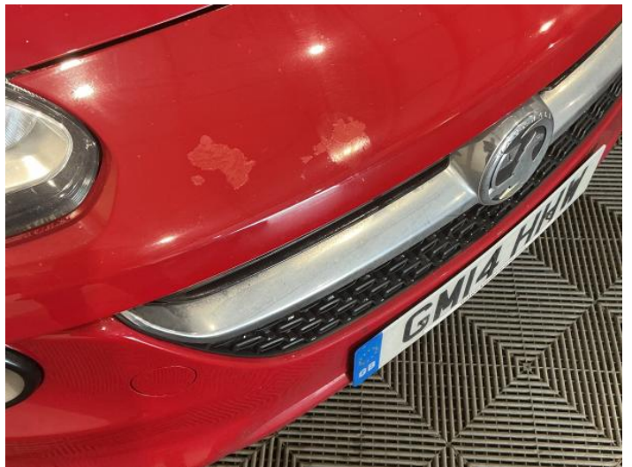
2: Bumper Front Poor Previous Repair Paint Flake