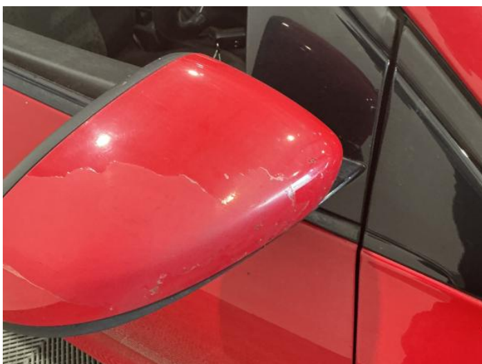
13: Door Mirror Assy osf Scratched (Painted) Over 25mm Not Thru Paint