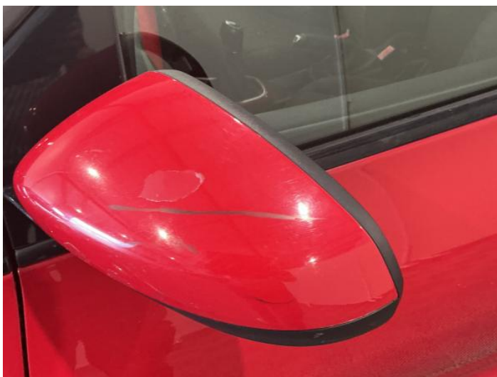
5: Door Mirror Assy nsf Scratched (Painted) Over 25mm Thru Paint