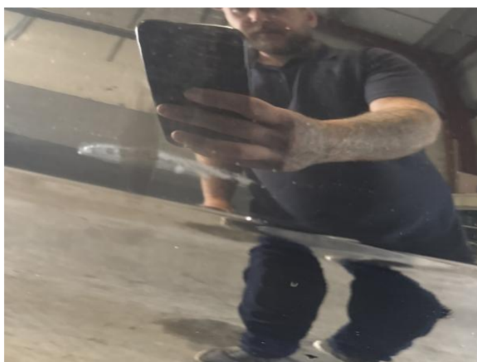
8: Qtr Panel nsr Poor Previous Repair Poor Paint