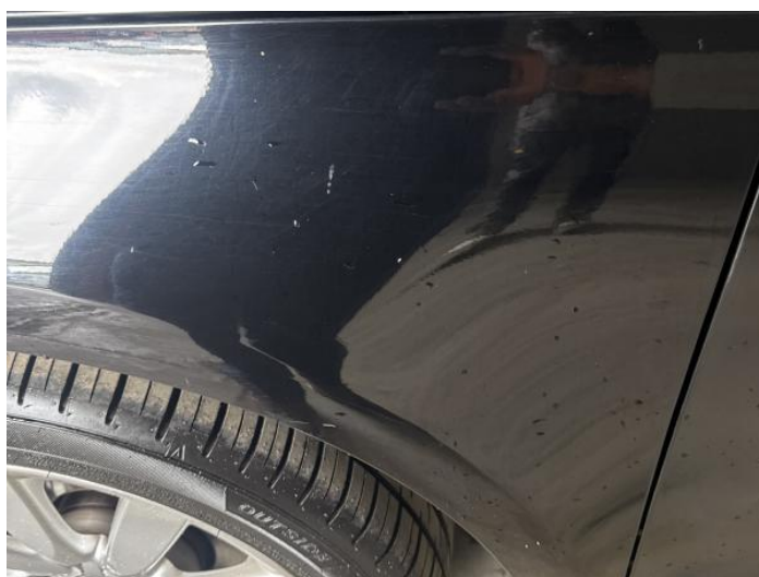
6: Wing nsf Poor Previous Repair Poor Paint