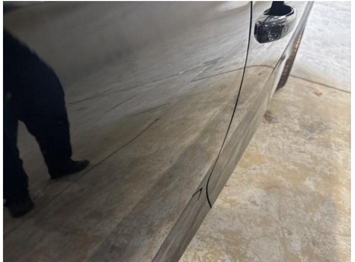
10: Qtr Panel osr Dented 2 Or Less UpTo 10mm