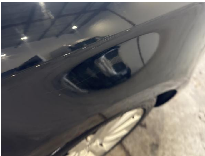
13: Wing osf Scratched Over 25mm Thru Paint