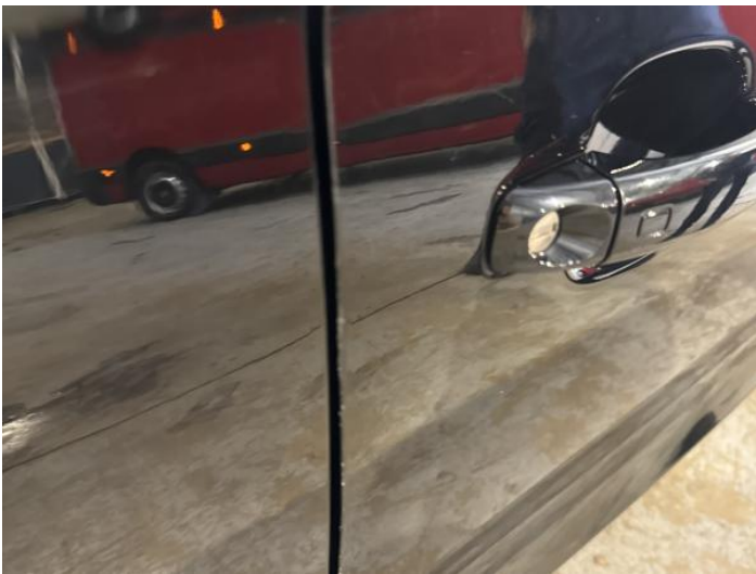
9: Bumper Rear Scratched Over 25mm Not Thru Paint