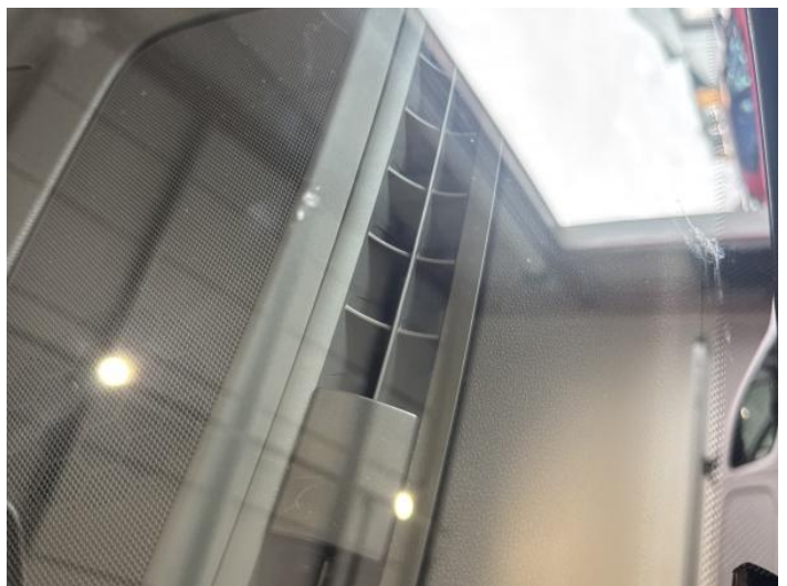
14: Screen Front Chipped UpTo 10mm