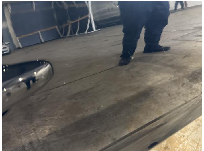
12: Door osf Chipped 1 To 5