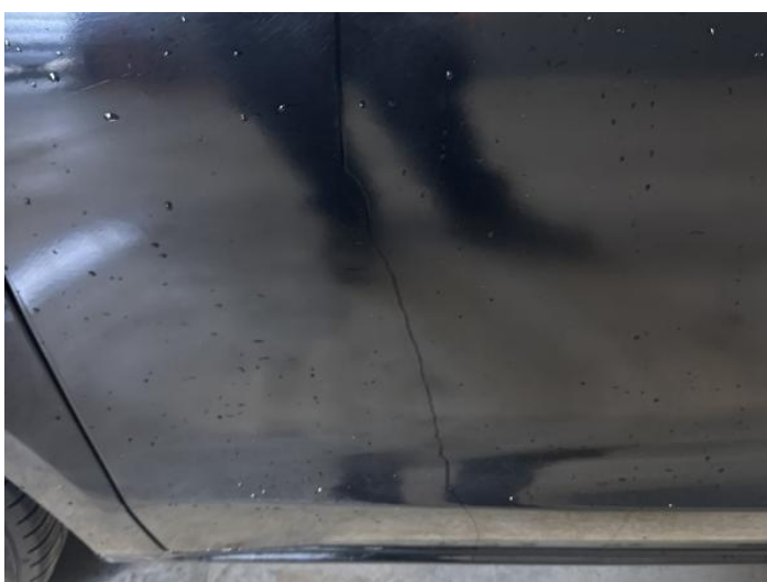
7: Door nsf Poor Previous Repair Poor Paint