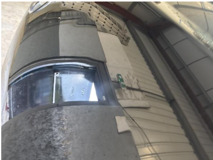
15: Boot Lid Dented Over 2 UpTo 10mm