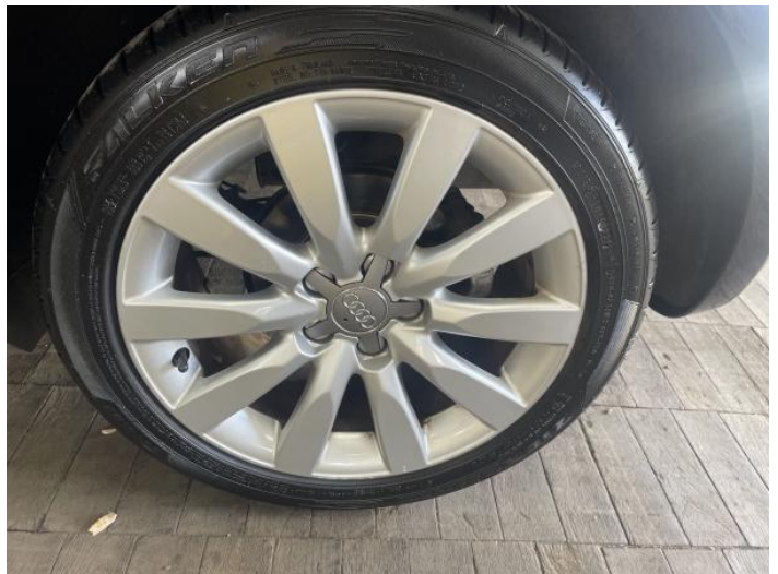
2: Wheel nsr Scratched Up To 50mm