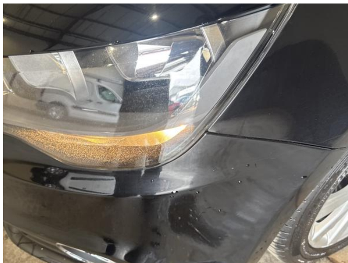
4: Bumper Front Poor Previous Repair Poor Paint