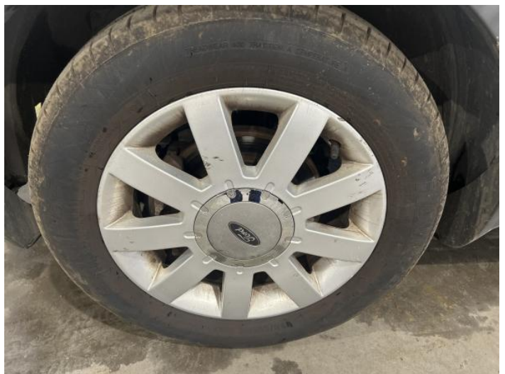
14: Wheel nsf Scratched Over 50mm