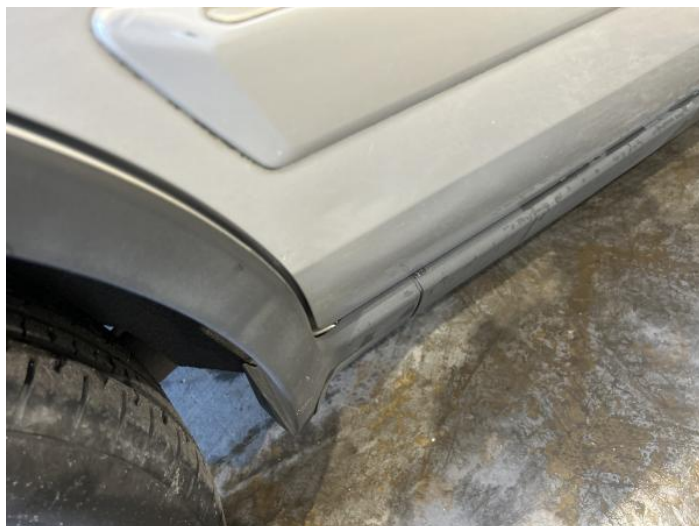
4: Door osr Dented Between 10mm + 30mm