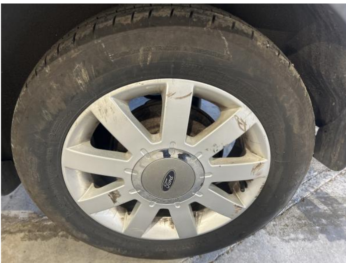
13: Wheel nsr Scratched Over 50mm