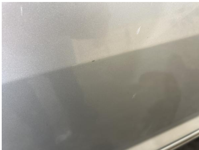
2: Door osf Chipped 1 To 5