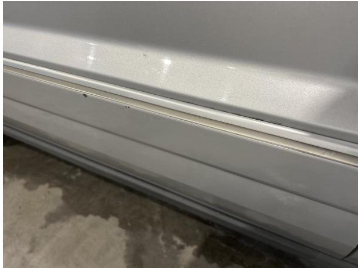
10: Door Moulding nsf Scratched (Painted) UpTo 25mm Thru Paint