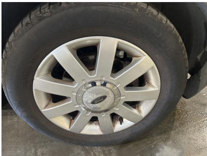
1: Wheel osf Scratched Over 50mm