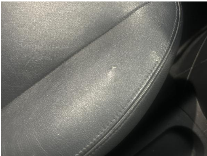
15: Seat Base Cover nsf Holed UpTo 3mm