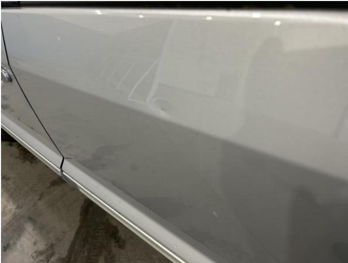
9: Door nsr Dented Between 10mm + 30mm