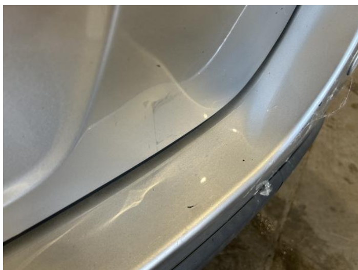
6: Tailgate Dented With Paint Damage