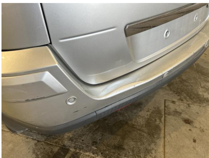
5: Bumper Rear Scratched Over 100mm Thru Paint