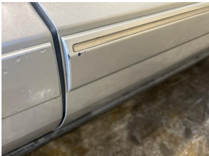
3: Door Moulding osf Scratched (Painted) UpTo 25mm Thru Paint