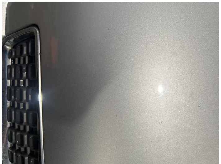
12: Bonnet Chipped 1 To 5