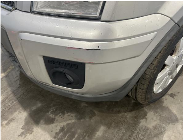
11: Bumper Front Scratched 25 to 100mm Thru Paint