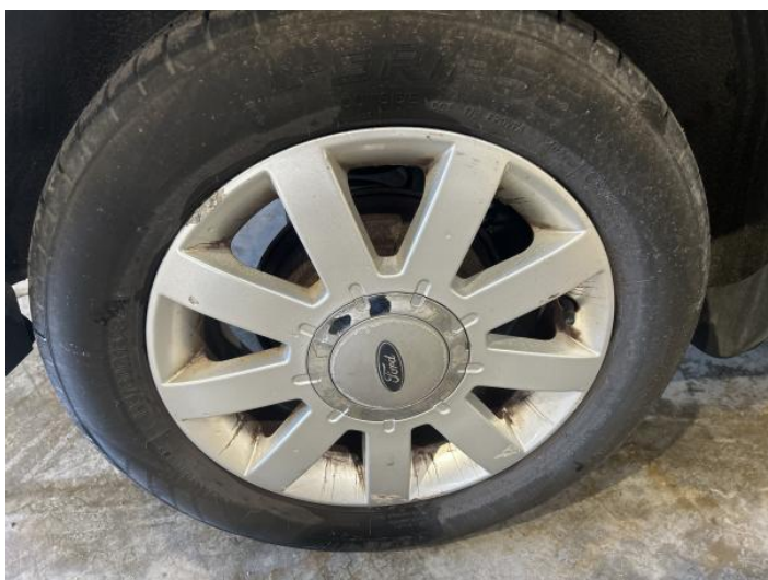
7: Wheel osr Scratched Over 50mm