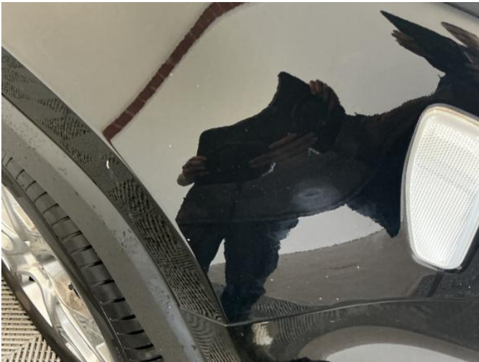
11: Wing osf Scratched UpTo 25mm Thru Paint