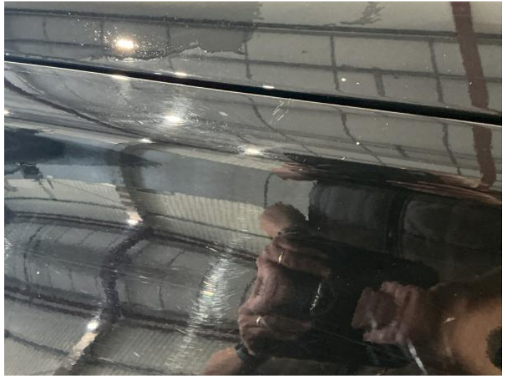
4: Wing nsf Scratched UpTo 25mm Thru Paint