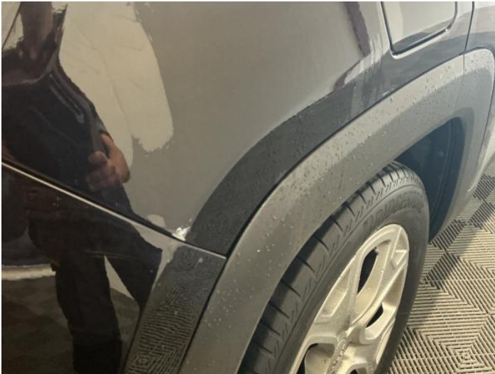
9: Qtr Panel osr Dented With Paint Damage