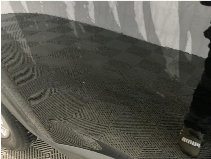
10: Door osr Chipped 1 To 5