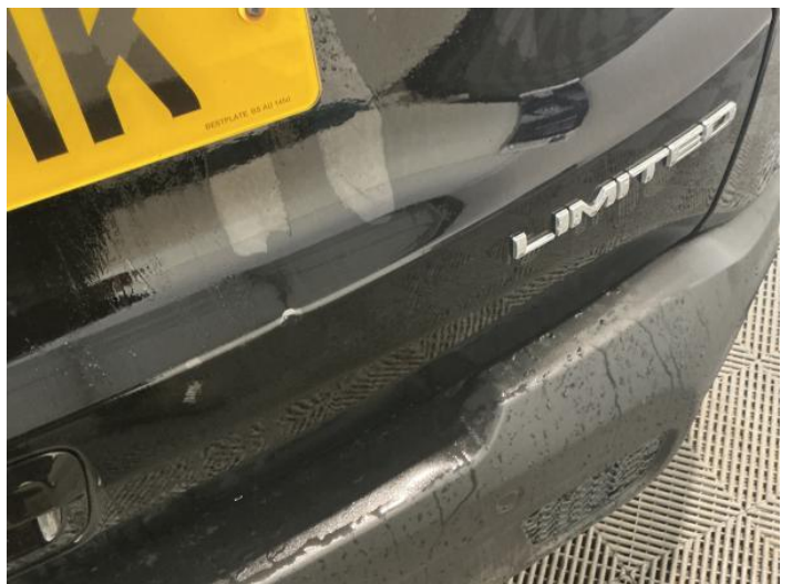
8: Tailgate Dented With Paint Damage