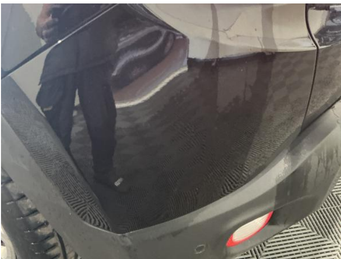
7: Bumper Rear Scratched Over 100mm Thru Paint