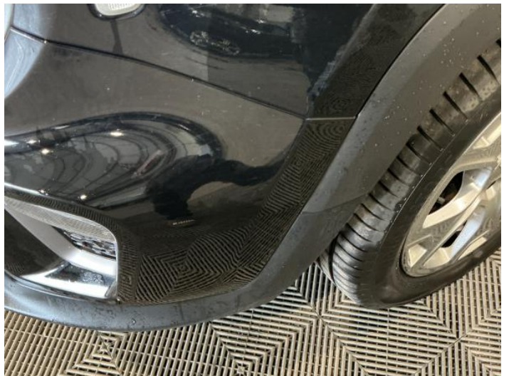
2: Bumper Front Scratched 25 to 100mm Thru Paint