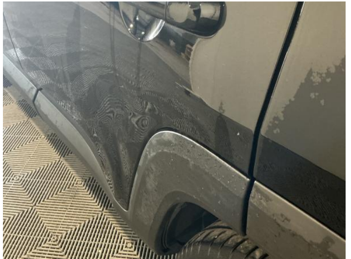
6: Door nsr Dented With Paint Damage