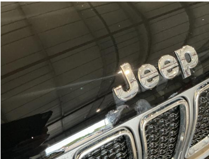
1: Bonnet Chipped 1 To 5