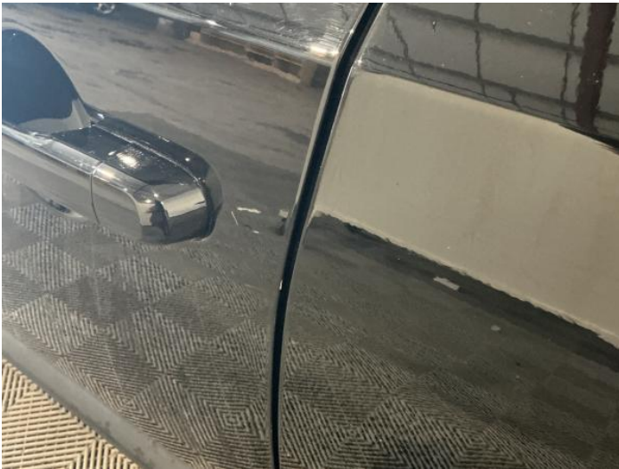
5: Door nsf Chipped Edge Chip