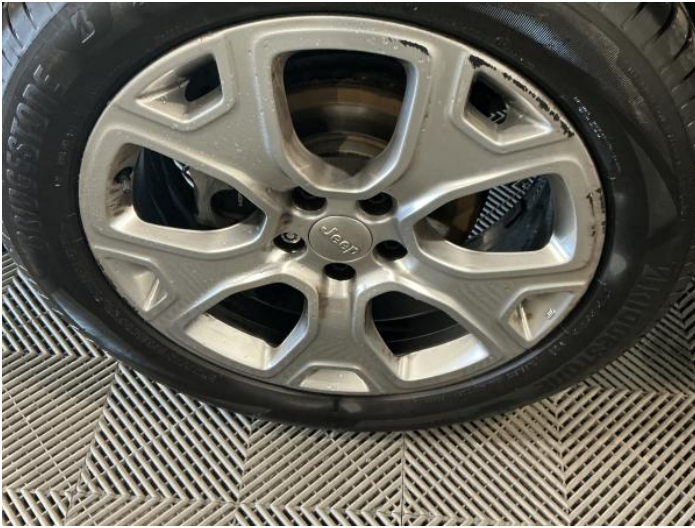
3: Wheel nsf Scratched Over 50mm