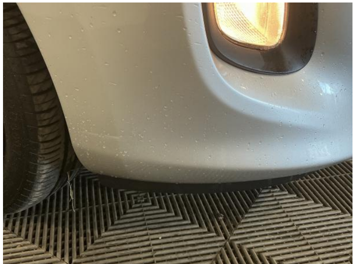
2: Bumper Front Scratched 25 to 100mm Thru Paint