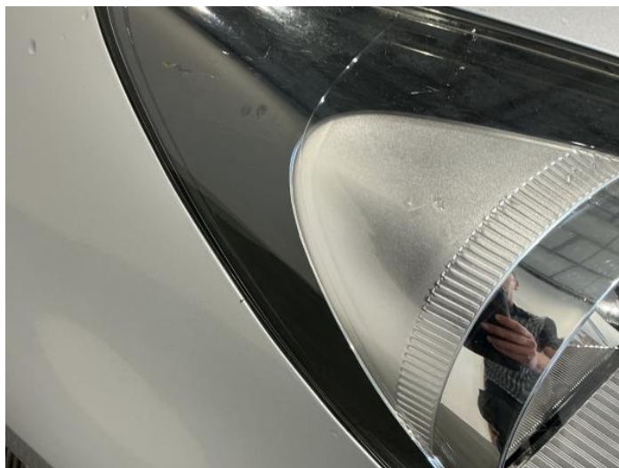
10: Wing osf Chipped 1 To 5