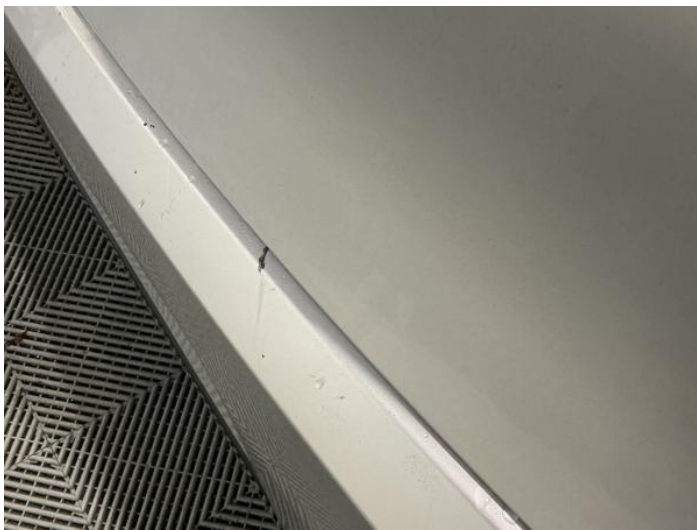
3: Door nsf Scratched Over 25mm Not Thru Paint