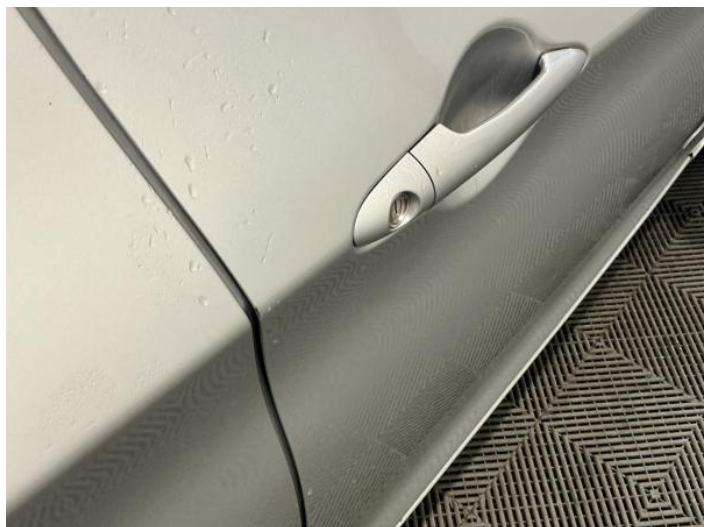
6: Qtr Panel osr Scratched Over 25mm Thru Paint