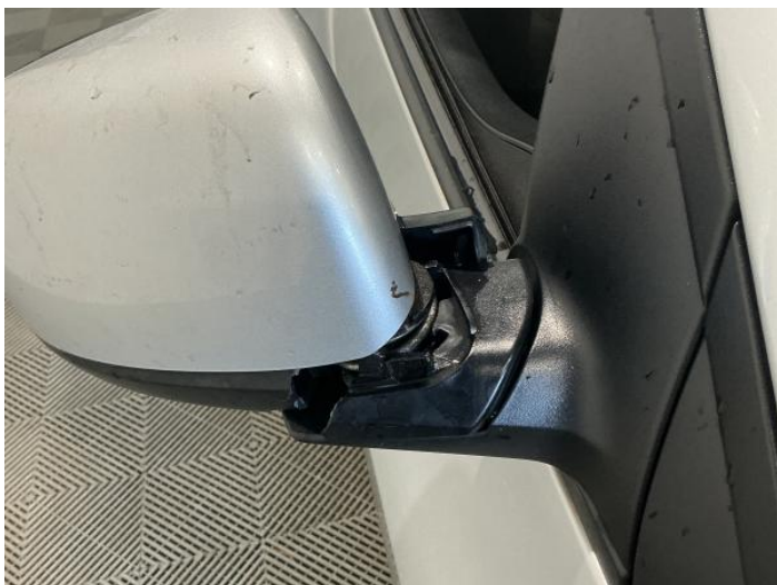
9: Door Mirror Assy osf Broken Replace