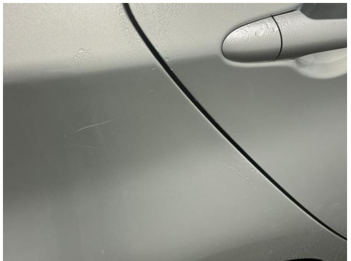
4: Wing nsf Scratched Over 25mm Not Thru Paint