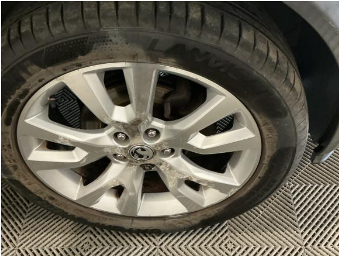
15: Wheel osf Scratched Over 50mm