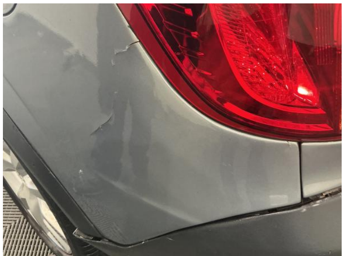
8: Qtr Panel nsr Cracked Replace