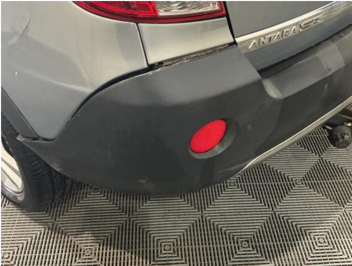
9: Bumper Rear Insecure Action Required