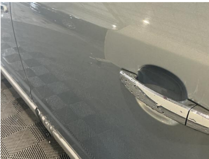
7: Door nsr Dented Between 10mm + 30mm