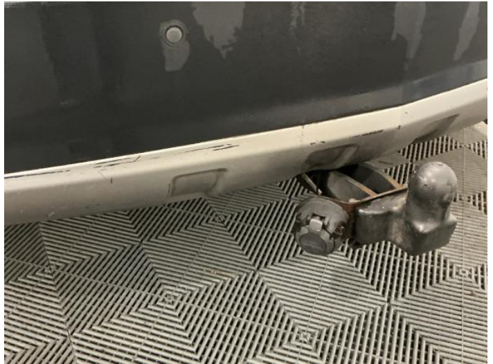
10: Bumper Rear Moulding Scratched (Painted) Over 25mm Thru Paint