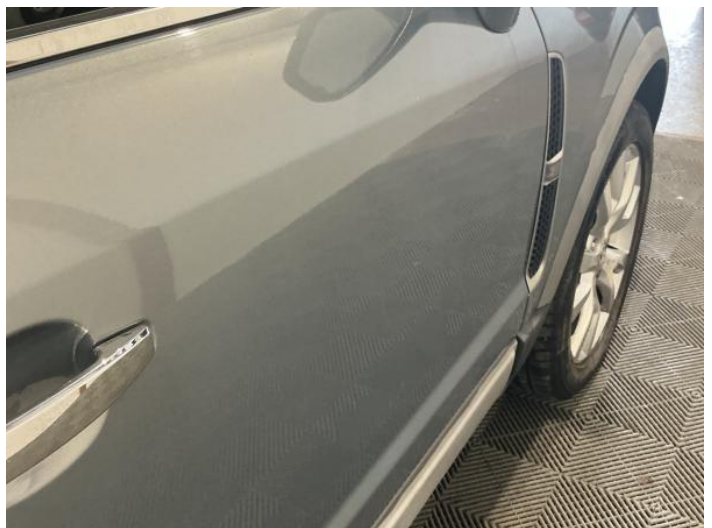
14: Door osf Dented Over 30mm