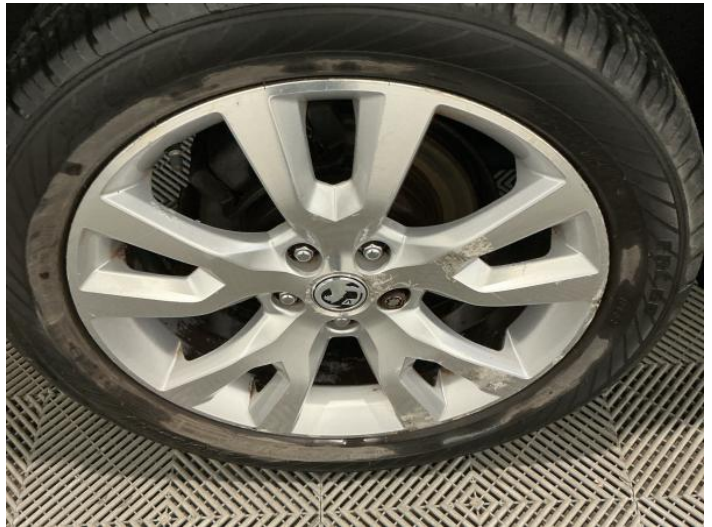
12: Wheel osr Scratched Over 50mm