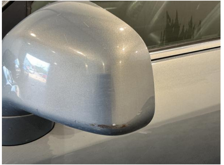
4: Door Mirror Assy nsf Scratched (Painted) Over 25mm Thru Paint