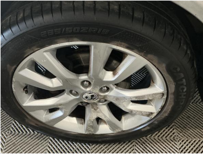
3: Wheel nsf Scratched Over 50mm