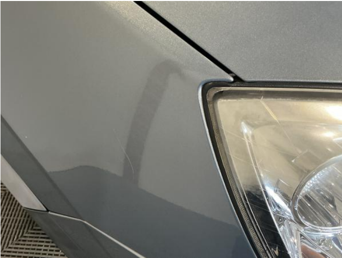
16: Wing osf Scratched Over 25mm Thru Paint

Carpet Condition Average Seat Condition Average