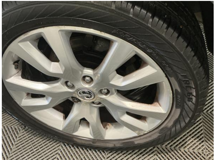
6: Wheel nsr Scratched Over 50mm