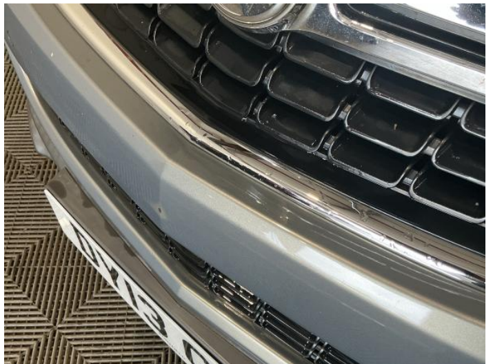
2: Bumper Front Scratched 25 to 100mm Thru Paint