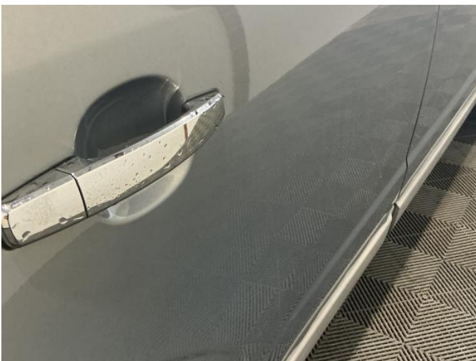
13: Door osr Dented Between 10mm + 30mm