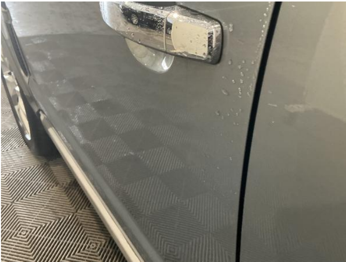
5: Door nsf Dented Between 10mm + 30mm