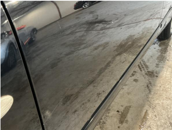
5: Door nsf Dented With Paint Damage