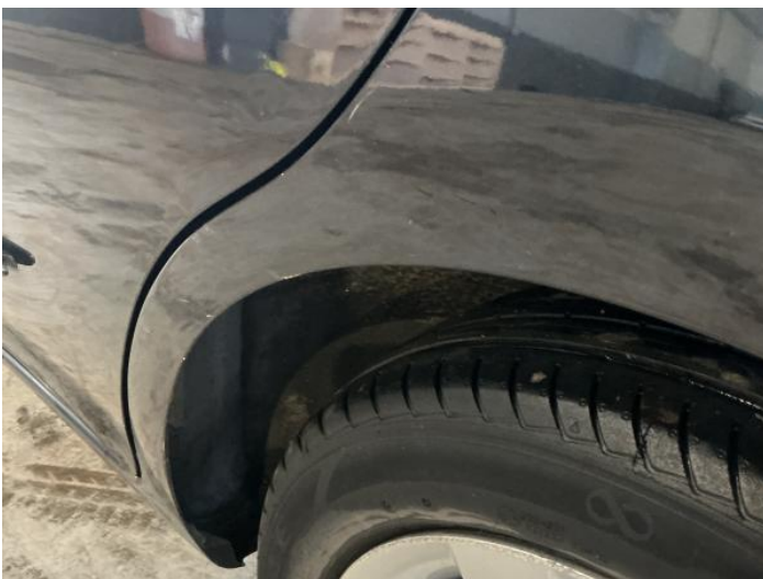
7: Qtr Panel nsr Dented With Paint Damage