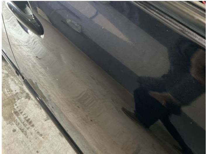
12: Door osf Dented Over 30mm