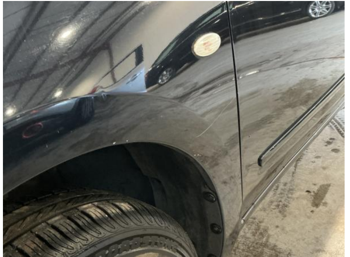
4: Wing nsf Dented With Paint Damage