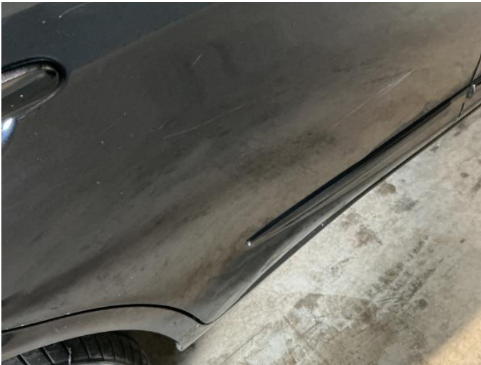
11: Door osr Dented With Paint Damage