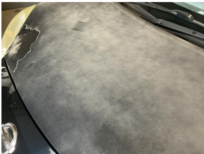
1: Bonnet Scratched Over 25mm Thru Paint