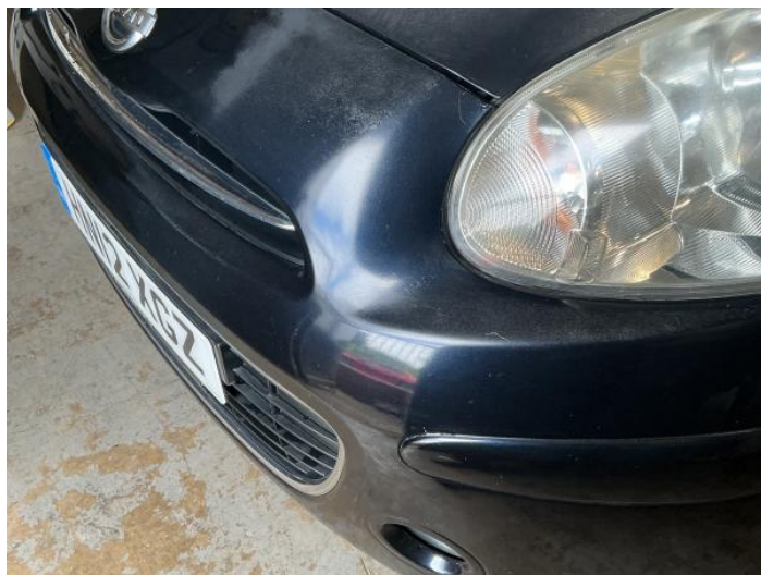
2: Bumper Front Scratched Over 100mm Thru Paint