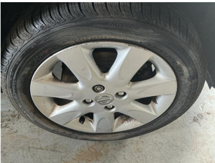
13: Wheel osf Scratched Over 50mm