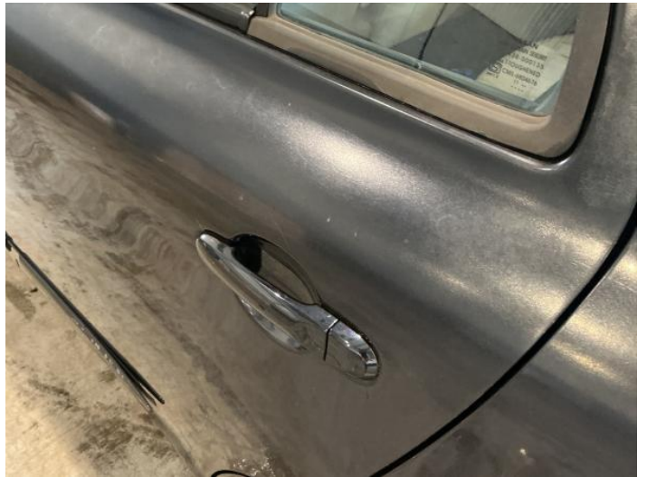
6: Door nsr Dented With Paint Damage