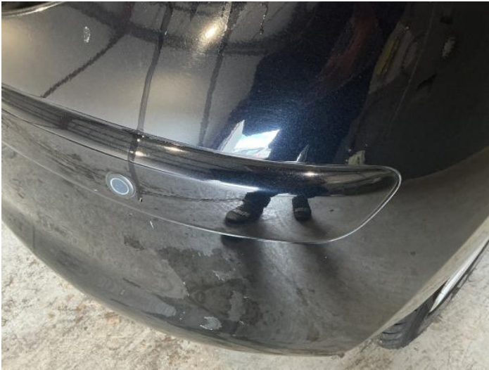
9: Bumper Rear Scratched 25 to 100mm Thru Paint