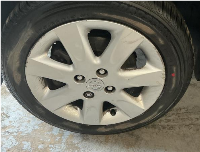
3: Wheel nsf Scratched Over 50mm