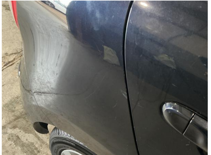
10: Qtr Panel osr Scratched Over 25mm Thru Paint