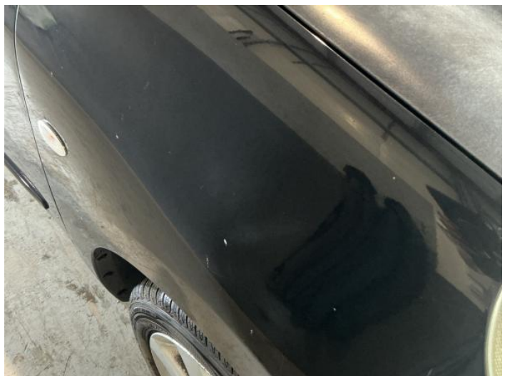
14: Wing osf Scratched Over 25mm Thru Paint