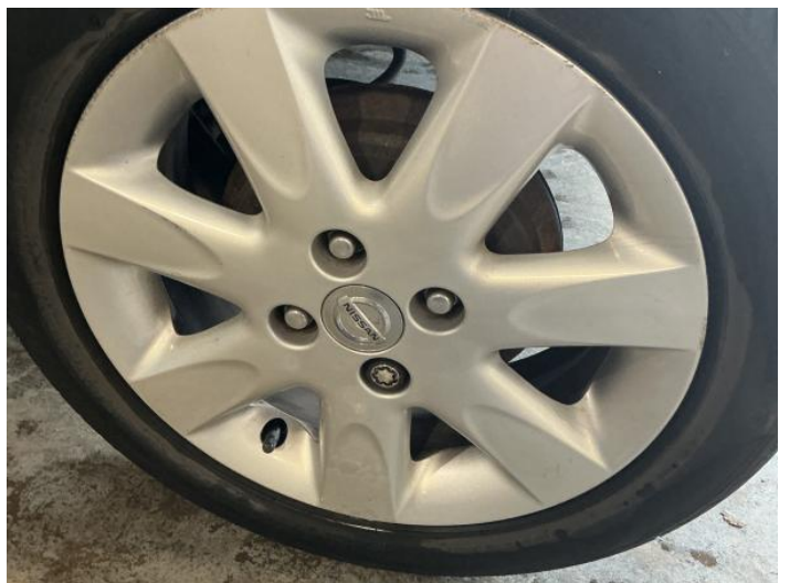
8: Wheel nsr Scratched Over 50mm