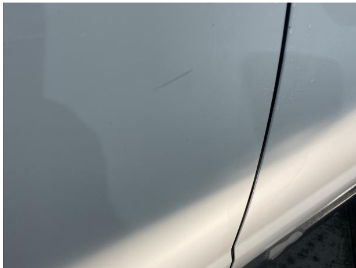
4: Door osr Scratched UpTo 25mm Not Thru Paint