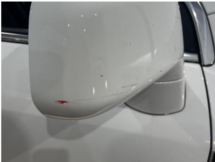
3: Door Mirror Assy osf Scratched (Painted) Over 25mm Not Thru Paint