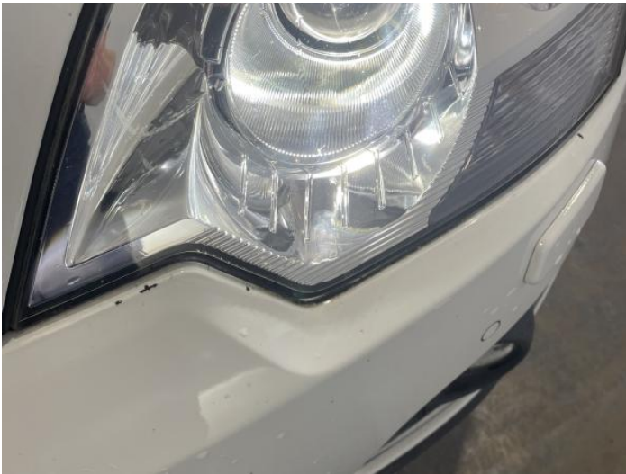
11: Bumper Front Chipped Multiple Chips