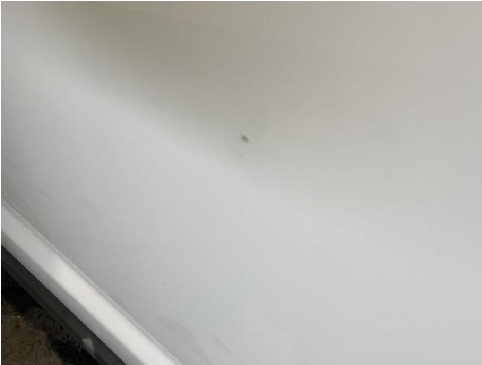
9: Door nsf Chipped 1 To 5