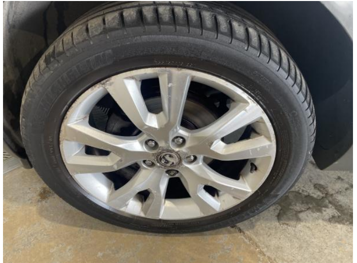
10: Wheel nsf Scratched Over 50mm