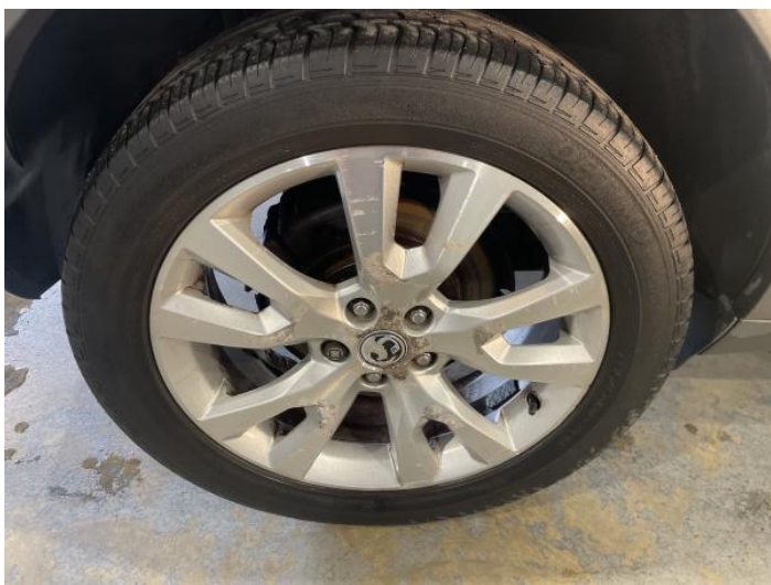
5: Wheel osr Scratched Over 50mm