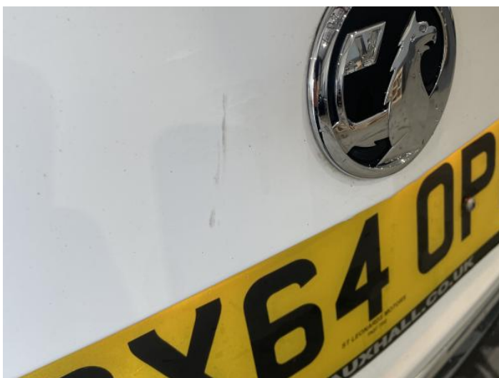
7: Tailgate Scratched Over 25mm Not Thru Paint