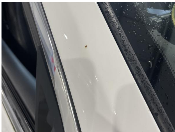
2: A Post os Chipped 1 To 5