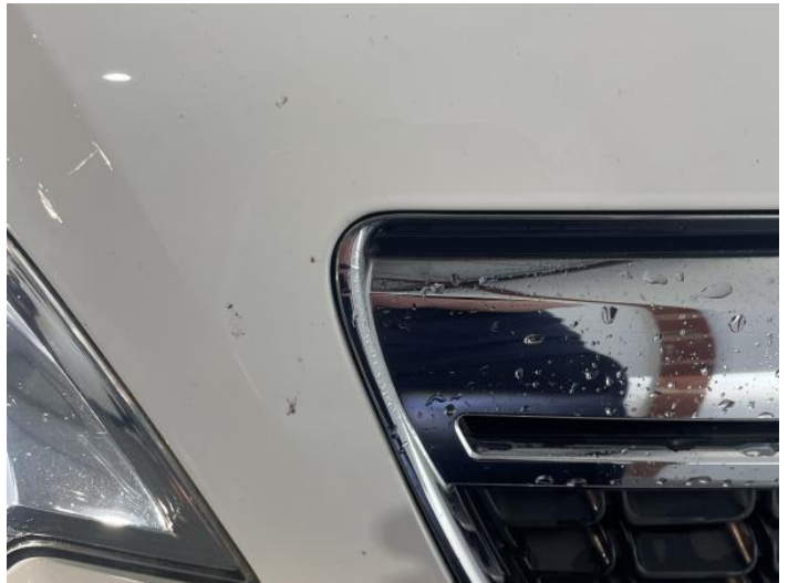
12: Bonnet Chipped 1 To 5