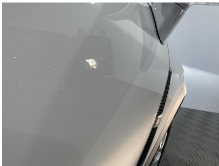
6: Door osf Dented 2 Or Less UpTo 10mm