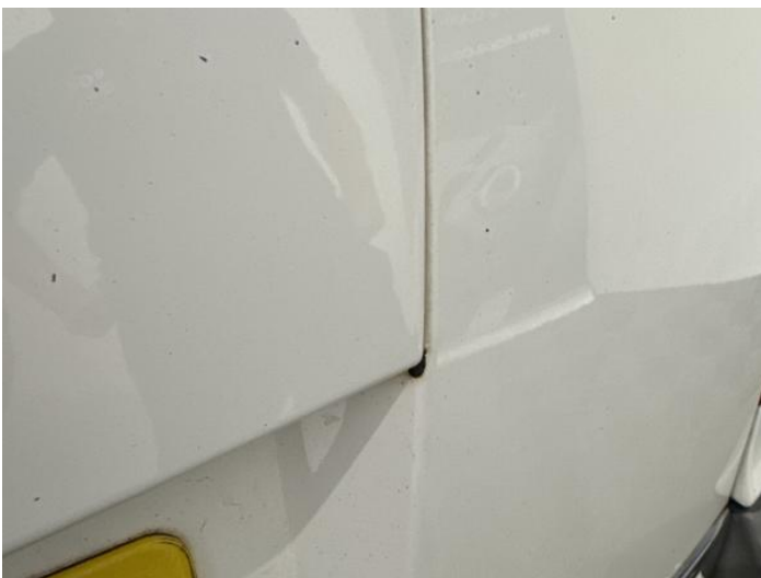
13: Tailgate Chipped 1 To 5