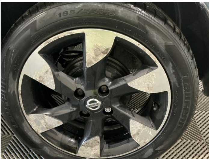
7: Wheel nsr Scratched Over 50mm