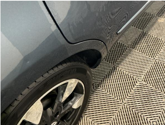
11: Qtr Panel osr Dented With Paint Damage