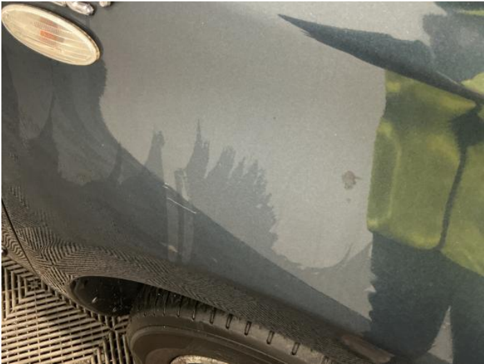
15: Wing osf Scratched UpTo 25mm Thru Paint