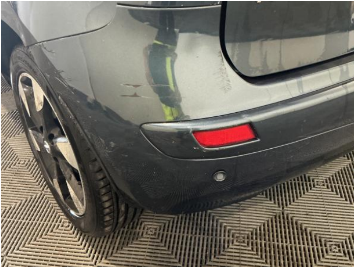
9: Bumper Rear Dented With Paint Damage