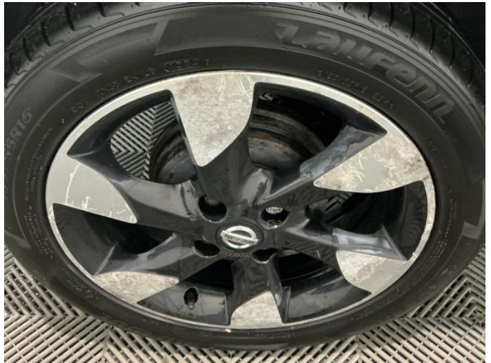
12: Wheel osr Scratched Over 50mm