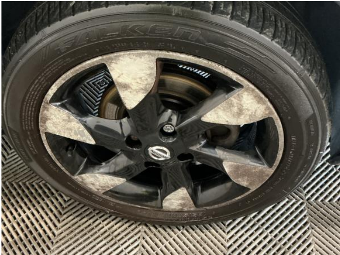
16: Wheel osf Scratched Over 50mm