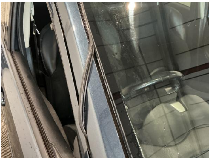
1: Aperture Seal of Broken Replace