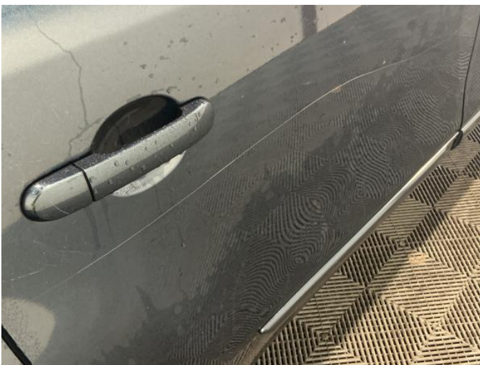
13: Door nsr Scratched Over 25mm Thru Paint