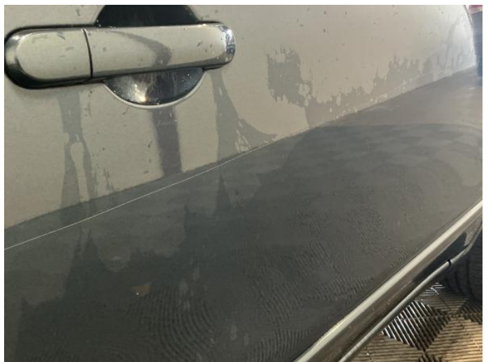
14: Door osf Scratched Over 25mm Thru Paint