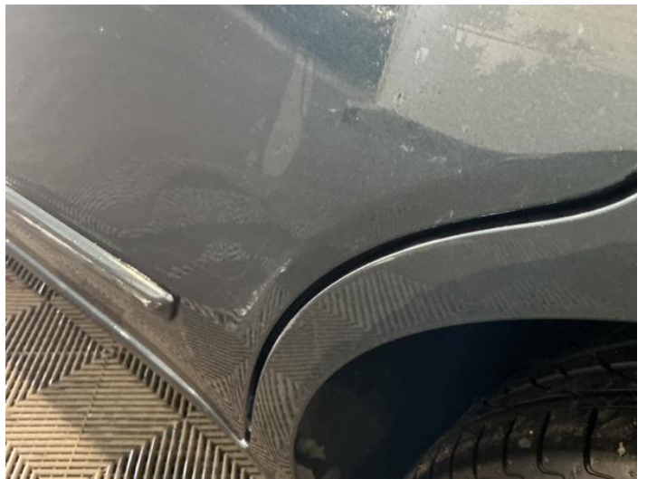
6: Door nsr Scratched Over 25mm Thru Paint