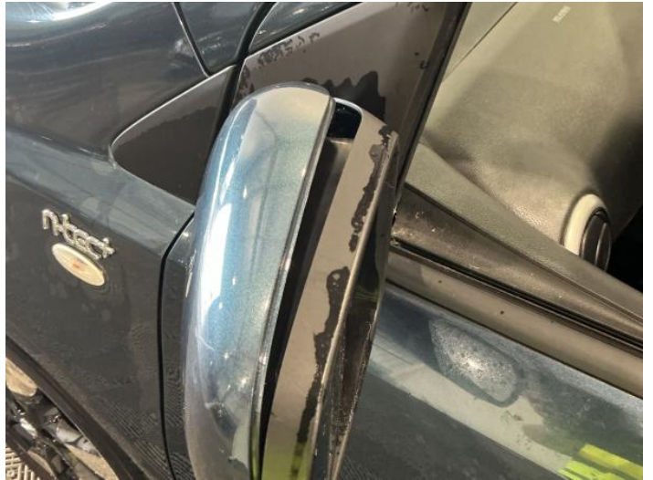
4: Door Mirror Assy nsf Broken Replace