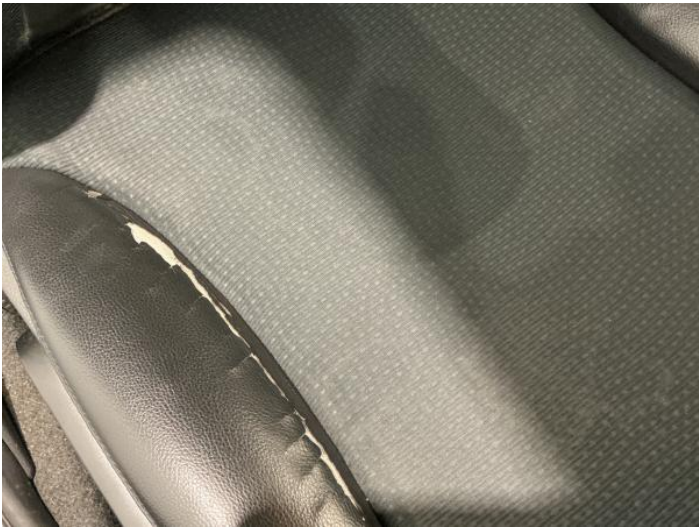
17: Seat Base Cover osf Scuffed Over 25mm