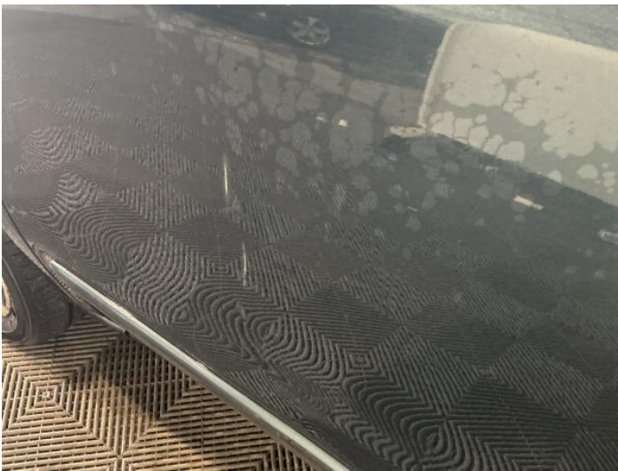
5: Door nsf Dented With Paint Damage