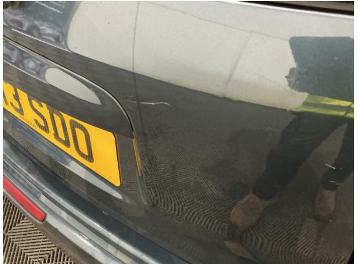
10: Tailgate Scratched Over 25mm Thru Paint