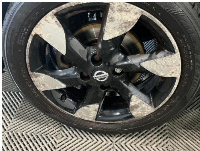
2: Wheel nsf Scratched Over 50mm