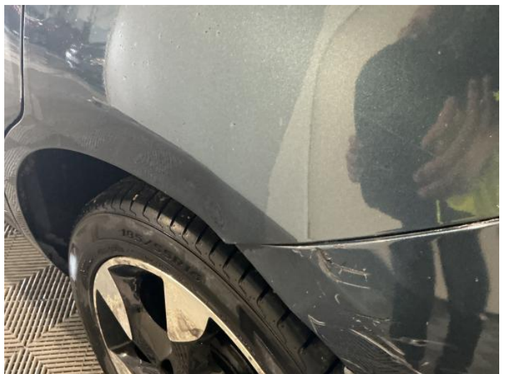
8: Qtr Panel nsr Dented Over 30mm