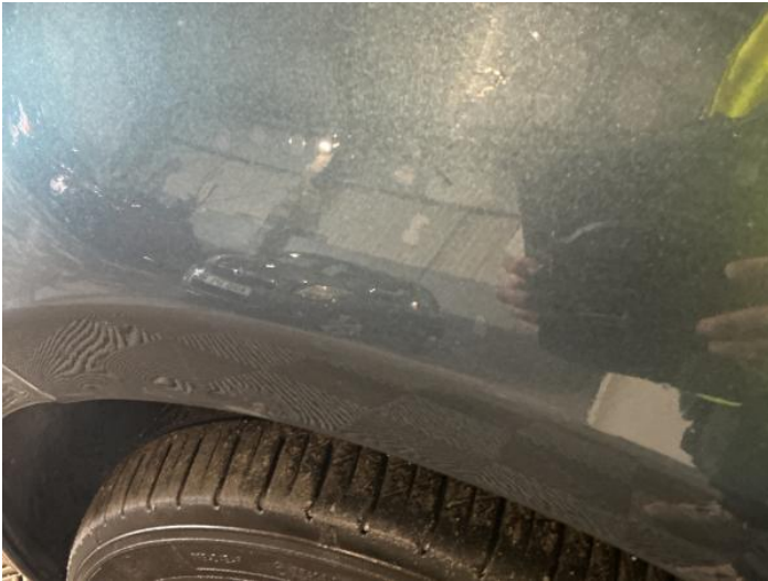
3: Wing nsf Scratched UpTo 25mm Thru Paint