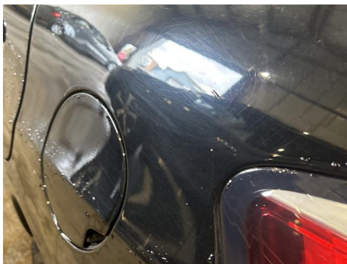
8: Qtr Panel nsr Scratched Over 25mm Not Thru Paint