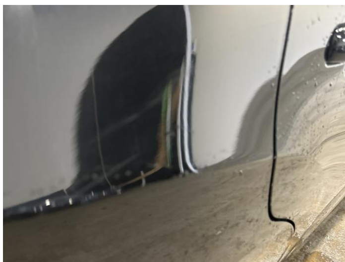
6: Qtr Panel osr Scratched Over 25mm Not Thru Paint