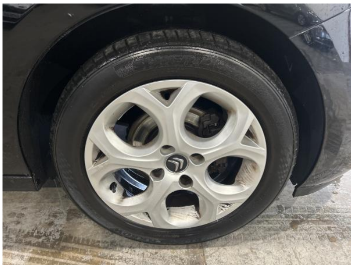
1: Wheel osf Scratched Up To 50mm