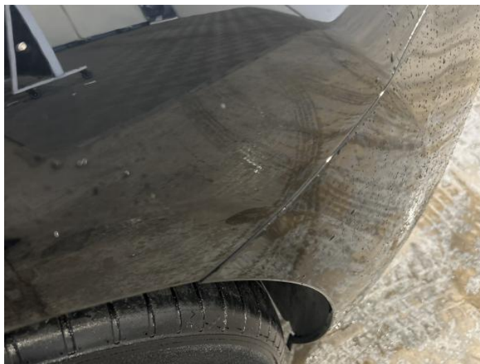
2: Wing osf Chipped 1 To 5