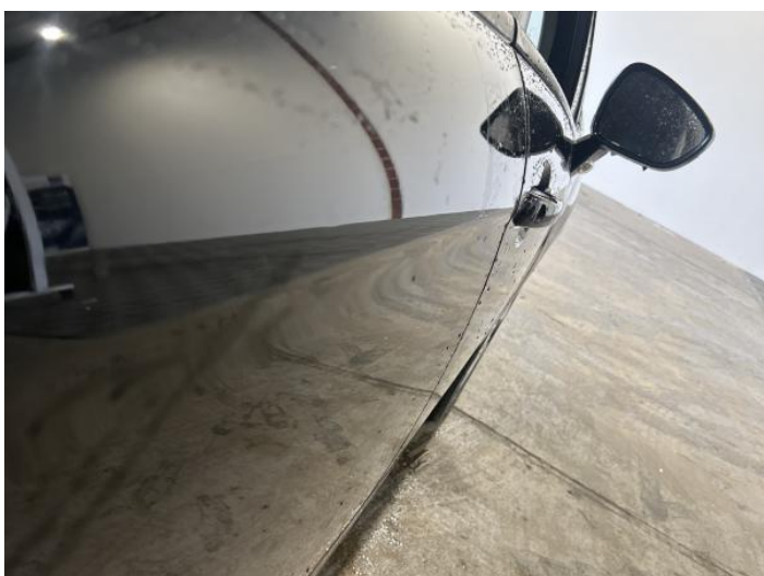
5: Door osr Dented 2 Or Less UpTo 10mm