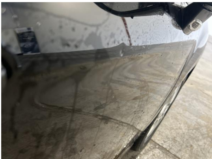
3: Door osf Dented 2 Or Less UpTo 10mm