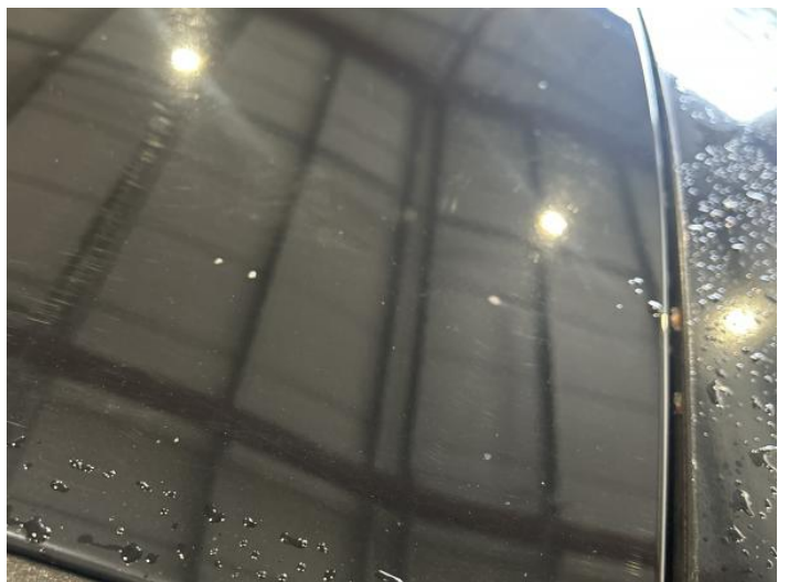
14: Roof Chipped 1 To 5