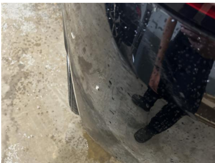
7: Bumper Rear Scratched 25 to 100mm Thru Paint