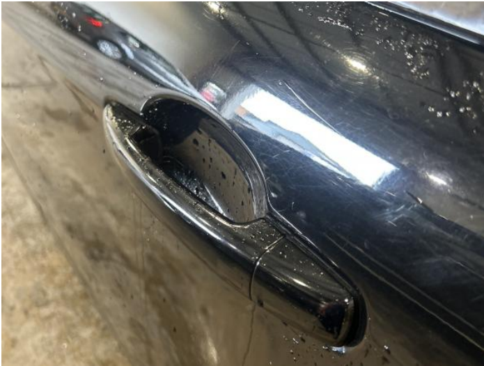
9: Door nsr Scratched Over 25mm Not Thru Paint