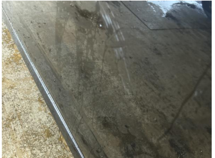
10: Door nsf Scratched Over 25mm Not Thru Paint