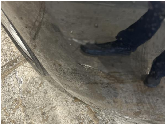
12: Bumper Front Scratched UpTo 25mm Thru Paint