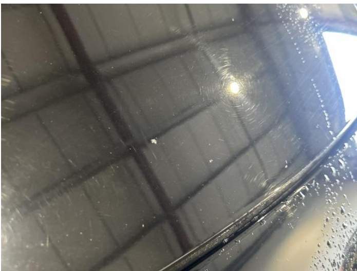
13: Bonnet Chipped 1 To 5