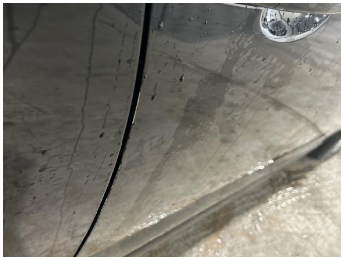
4: Door osf Chipped Edge Chip