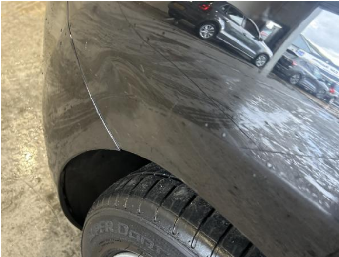
11: Wing nsf Dented Over 30mm