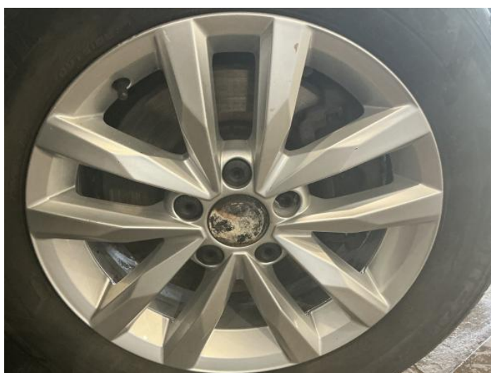
14: Wheel osf Scratched Up To 50mm