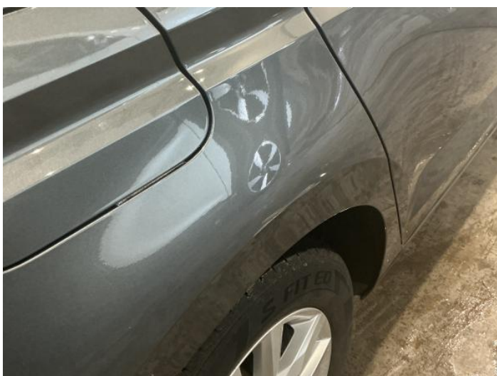
11: Qtr Panel osr Dented With Paint Damage