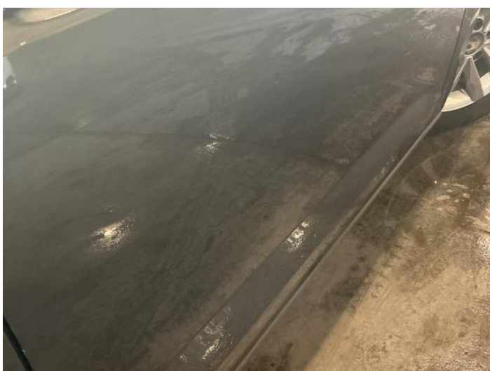
13: Door osf Dented Between 10mm + 30mm