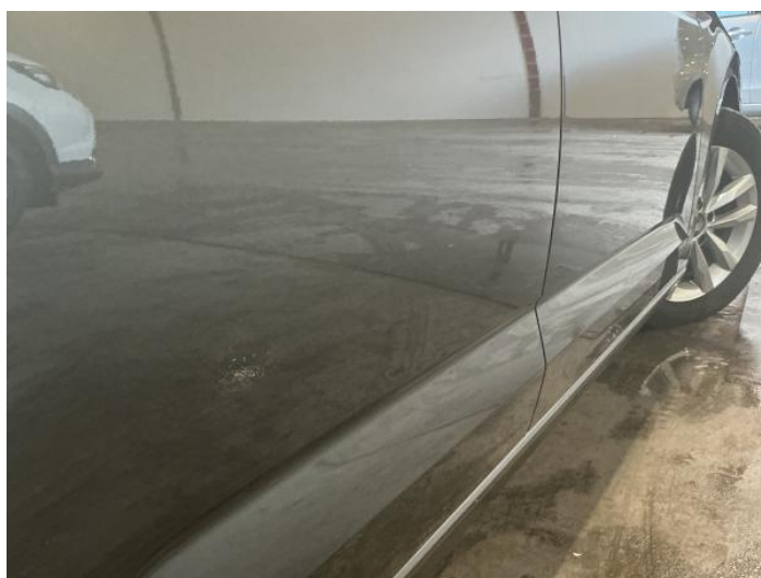
12: Door osr Dented Between 10mm + 30mm