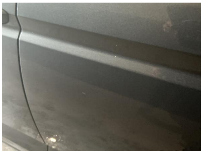
8: Door nsr Scratched UpTo 25mm Thru Paint