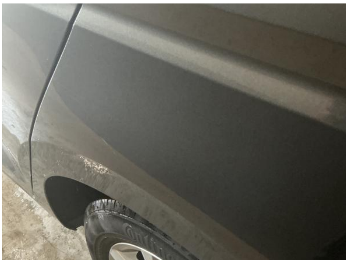
9: Qtr Panel nsr Scratched Over 25mm Thru Paint