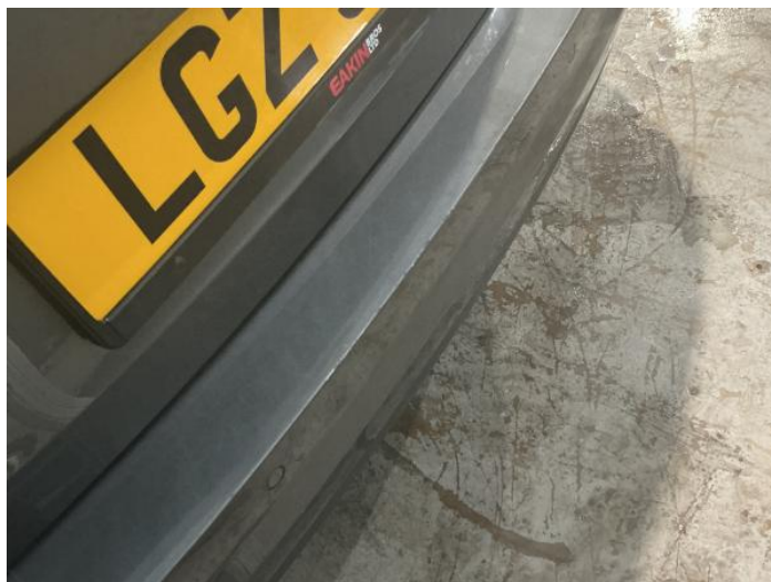
10: Bumper Rear Scratched Over 100mm Thru Paint