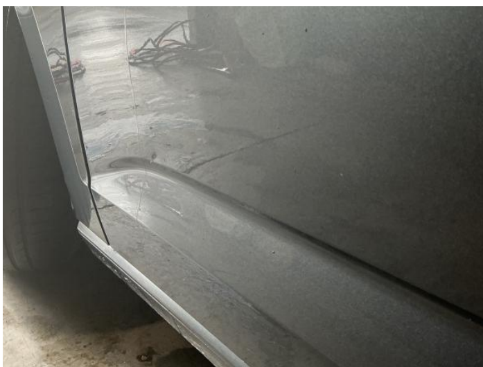
7: Door nsf Dented Between 10mm + 30mm