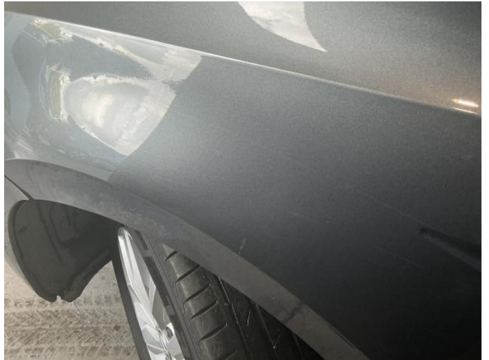
4: Wing nsf Scratched Over 25mm Thru Paint