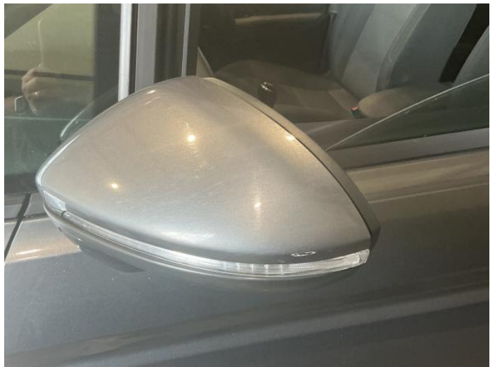
6: Door Mirror Assy nsf Scratched (Painted) UpTo 25mm Thru Paint