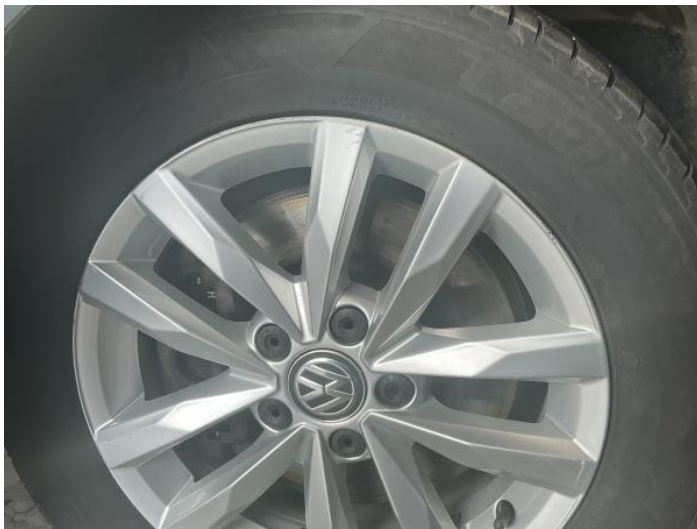
5: Wheel nsf Scratched Over 50mm