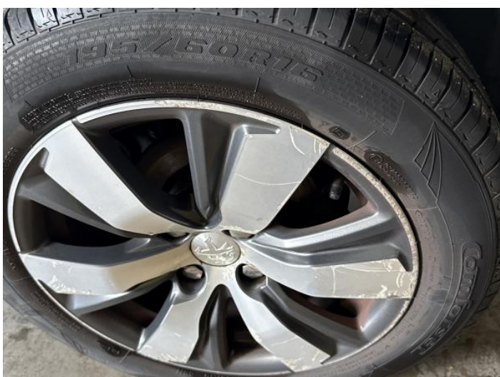
7: Wheel nsr Scratched Over 50mm