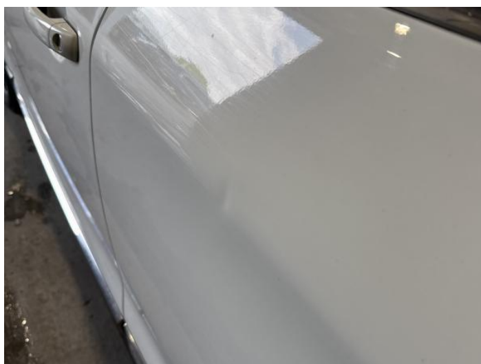
6: Door nsr Dented Between 10mm + 30mm