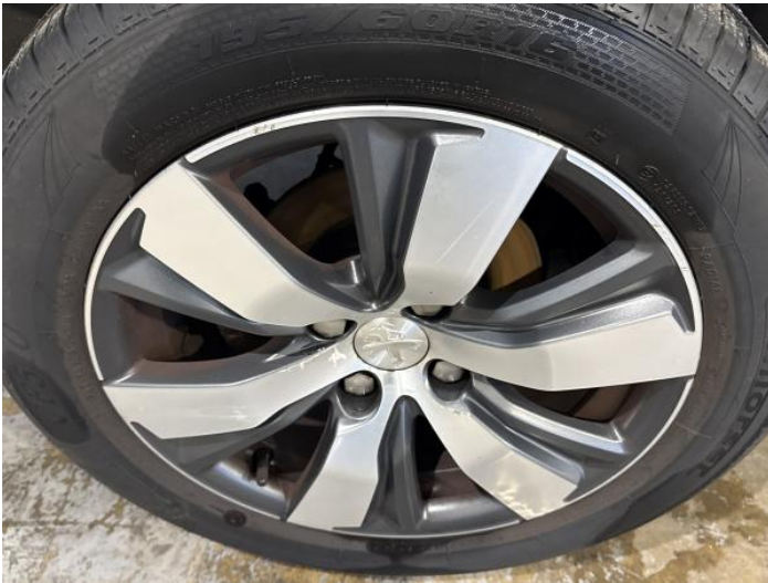
11: Wheel osr Scratched Up To 50mm