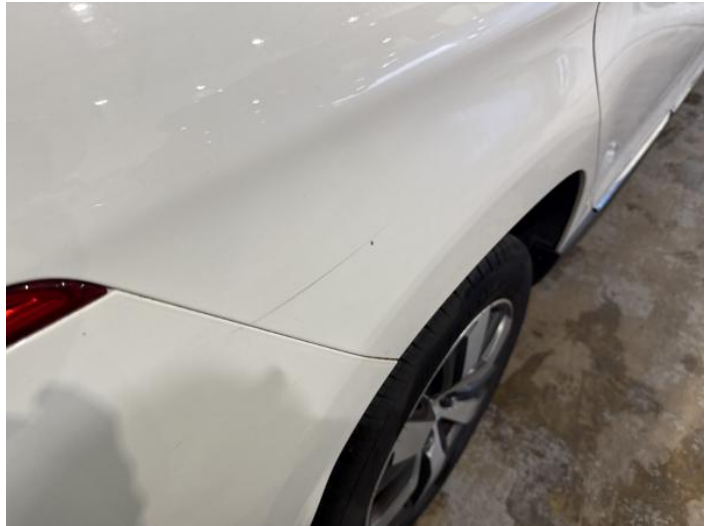
10: Qtr Panel osr Scratched Over 25mm Thru Paint