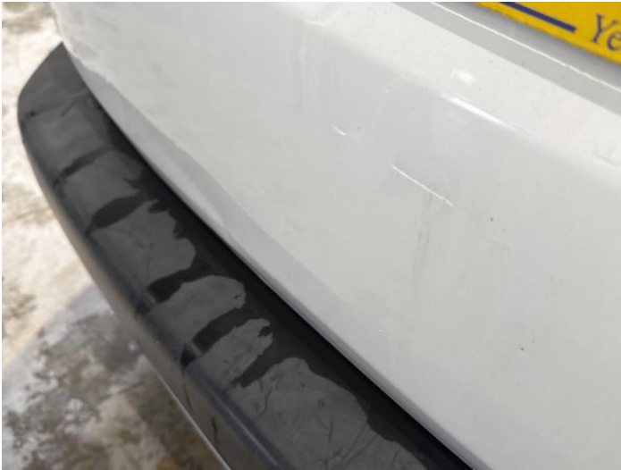
9: Tailgate Dented Over 30mm