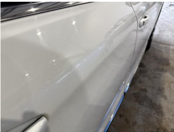
13: Door osr Dented Between 10mm + 30mm