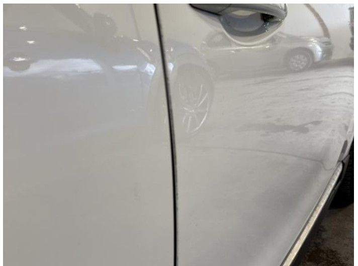
14: Door osf Chipped Edge Chip