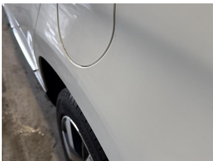
8: Qtr Panel nsr Dented Between 10mm + 30mm