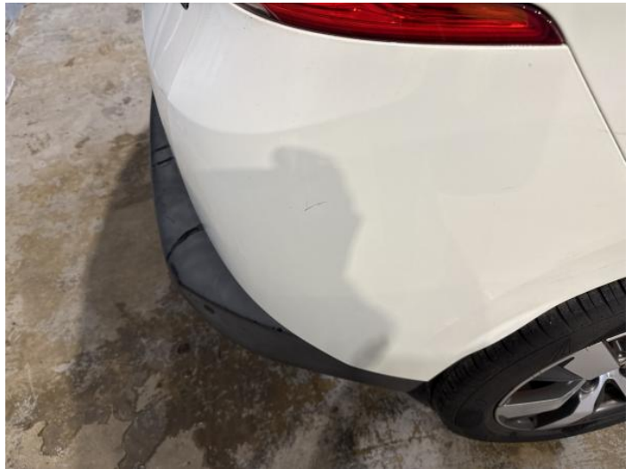
12: Bumper Rear Scratched 25 to 100mm Thru Paint