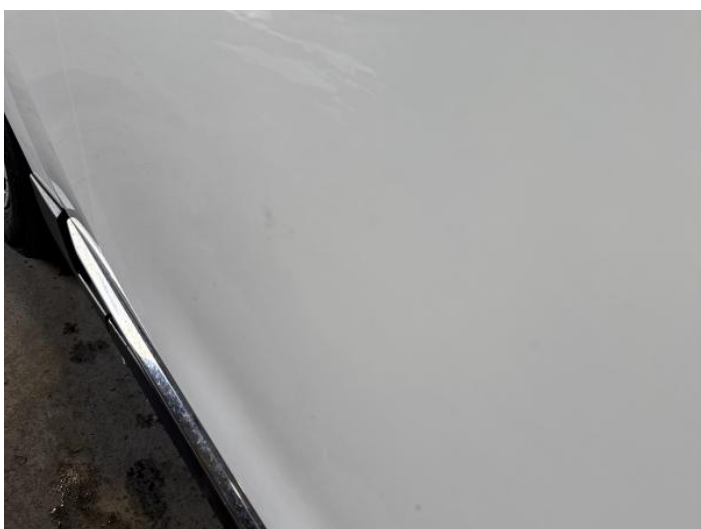
5: Door nsf Scratched UpTo 25mm Thru Paint