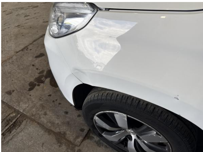
3: Wing nsf Dented Over 30mm