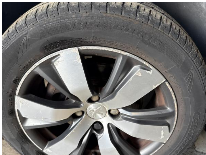
4: Wheel nsf Scratched Over 50mm