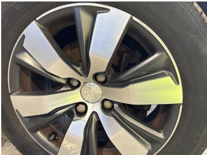
15: Wheel of Scratched Over 50mm