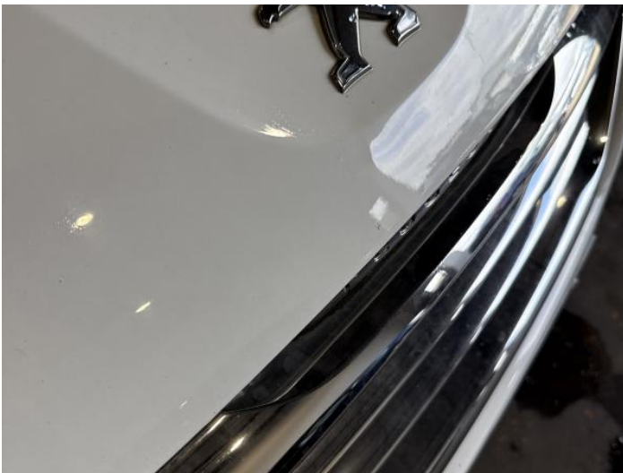
1: Bonnet Dented Between 10mm + 30mm