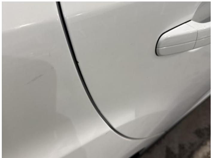
12: Door osr Chipped Edge Chip