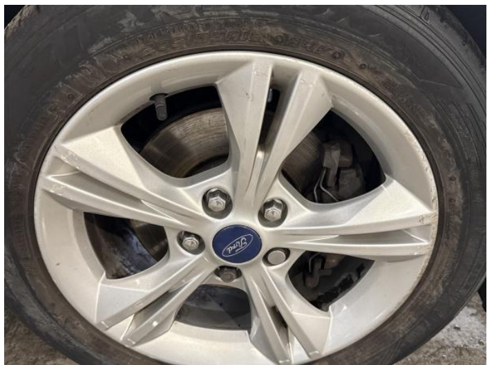
14: Wheel osf Scratched Over 50mm