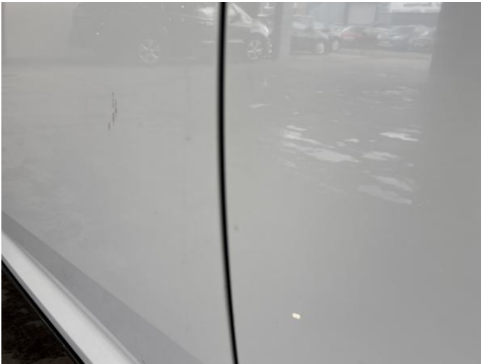
5: Door nsf Chipped Edge Chip