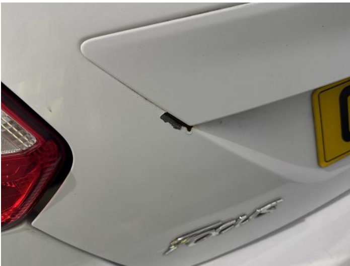
11: Tailgate Rusted Over 5mm