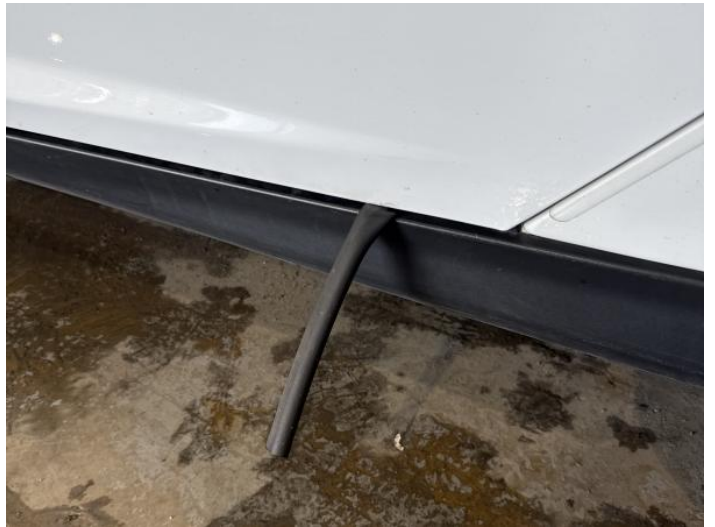
6: Aperture Seal nsr Broken Replace