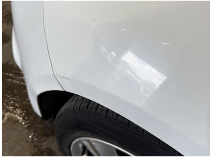
4: Wing nsf Scratched Over 25mm Thru Paint