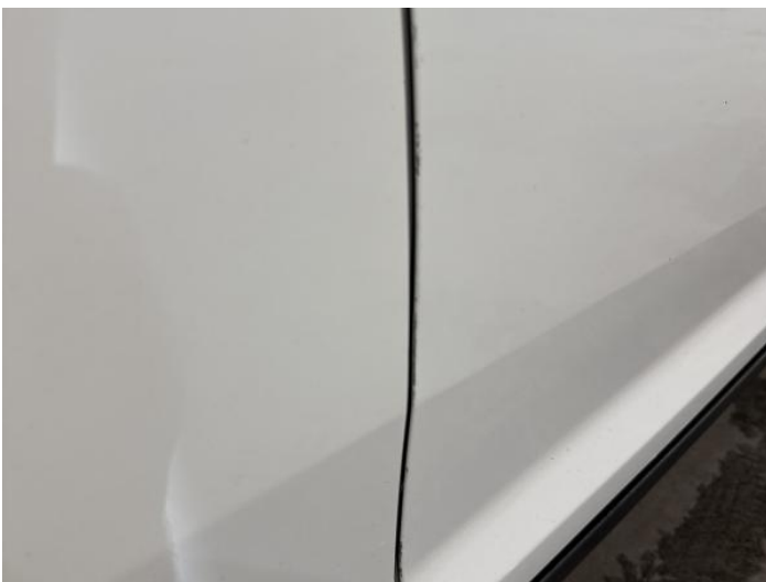
13: Door osf Chipped Edge Chip