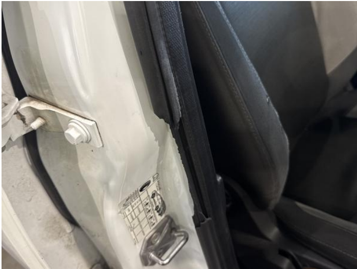
16: Other N/A N/A