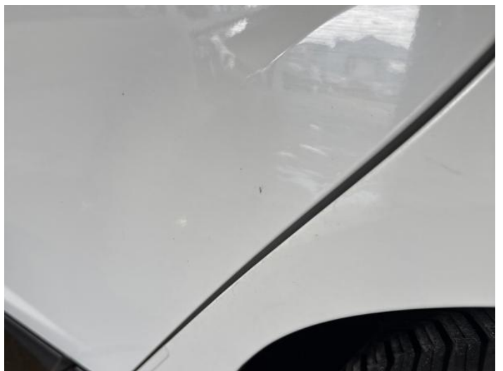
8: Door nsr Chipped 1 To 5