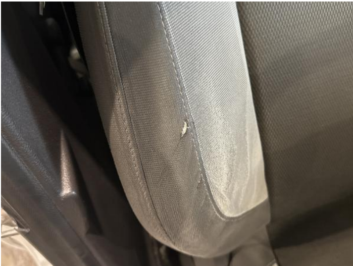
17: Seat Back Cover osf Scuffed UpTo 25mm

Carpet Condition Average Seat Condition Average