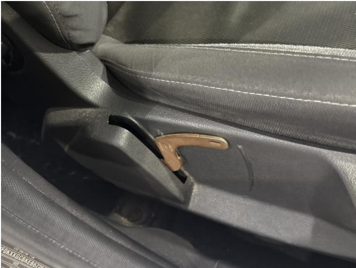
15: Switches And Controls Broken Replace