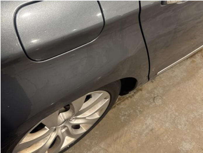
15: Qtr Panel osr Dented Over 30mm