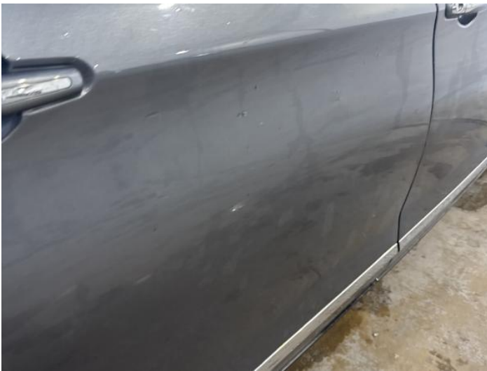
17: Door osr Dented With Paint Damage