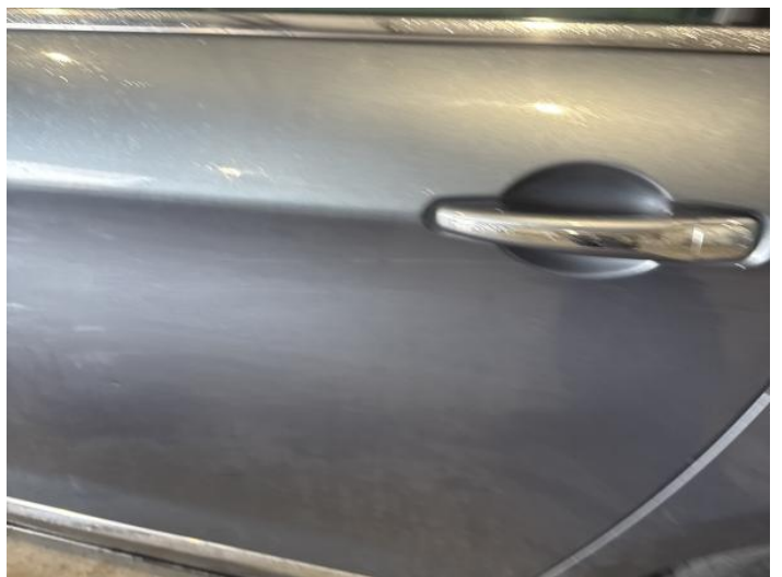
7: Door nsf Scratched Over 25mm Not Thru Paint