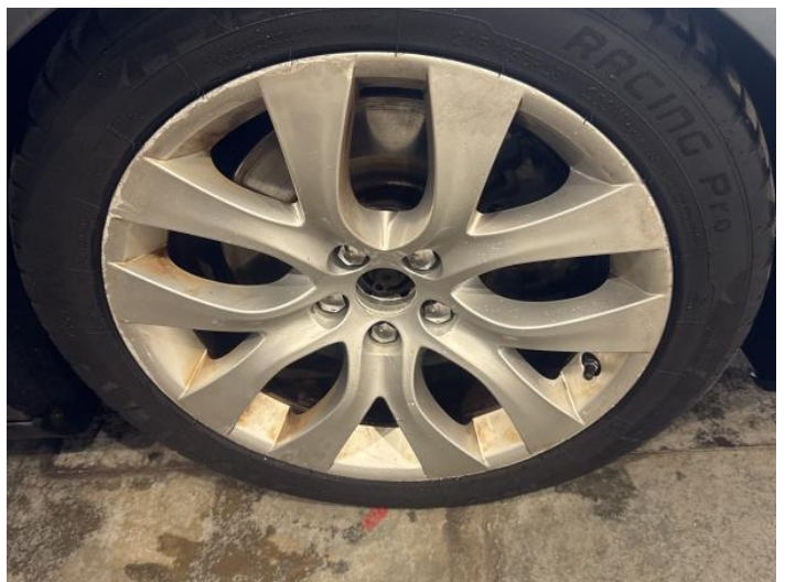
20: Wheel osf Scratched Over 50mm