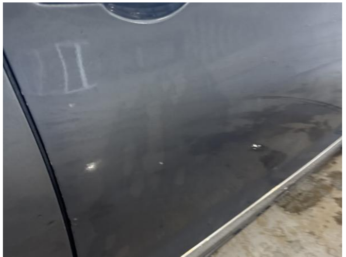
18: Door osf Dented With Paint Damage