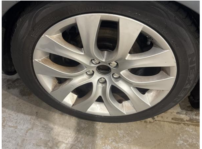
16: Wheel osr Scratched Over 50mm