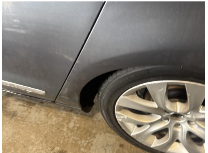
12: Qtr Panel nsr Dented With Paint Damage