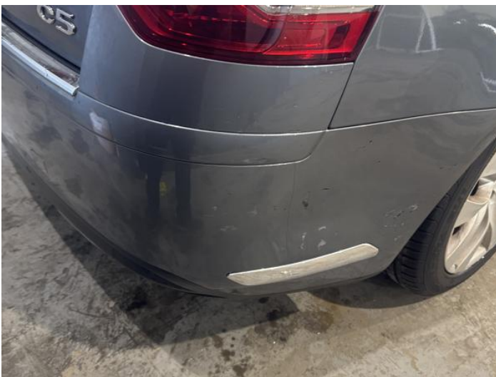
13: Bumper Rear Scratched Over 100mm Thru Paint