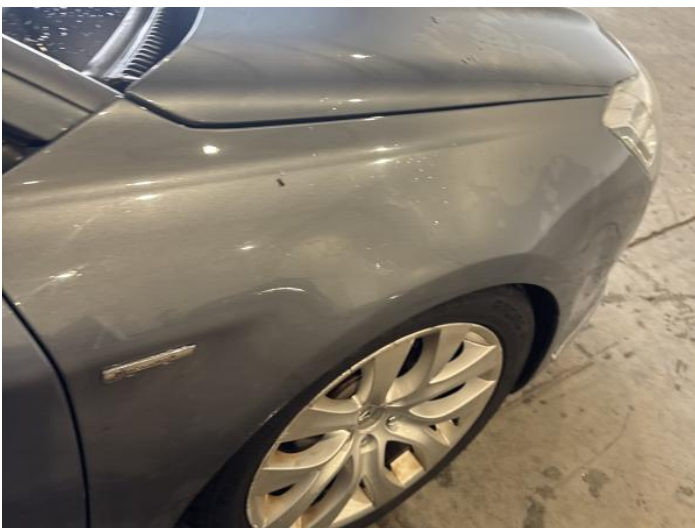
19: Wing osf Poor Previous Repair Poor Paint