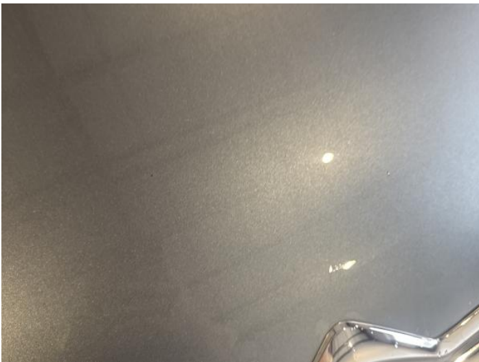
1: Bonnet Poor Previous Repair Poor Paint