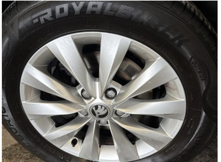
4: Wheel nsf Scratched Up To 50mm