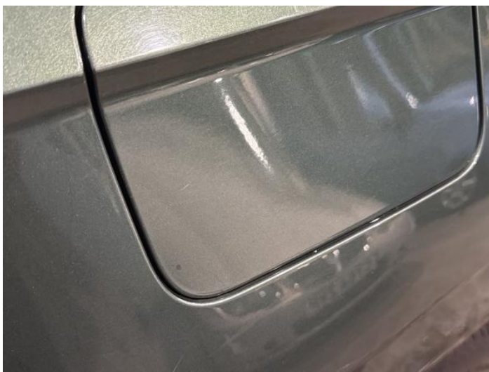
11: Qtr Panel osr Scratched UpTo 25mm Thru Paint