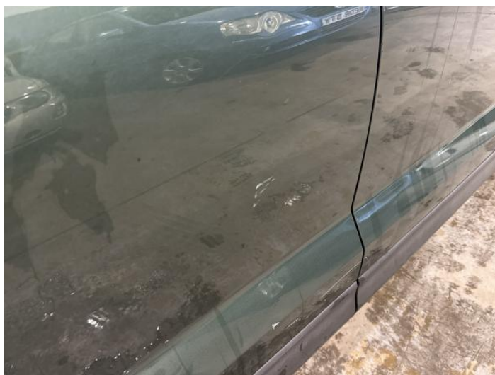
12: Door osr Dented With Paint Damage