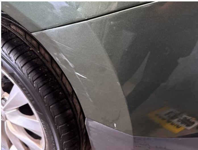
9: Bumper Rear Scratched Over 100mm Thru Paint