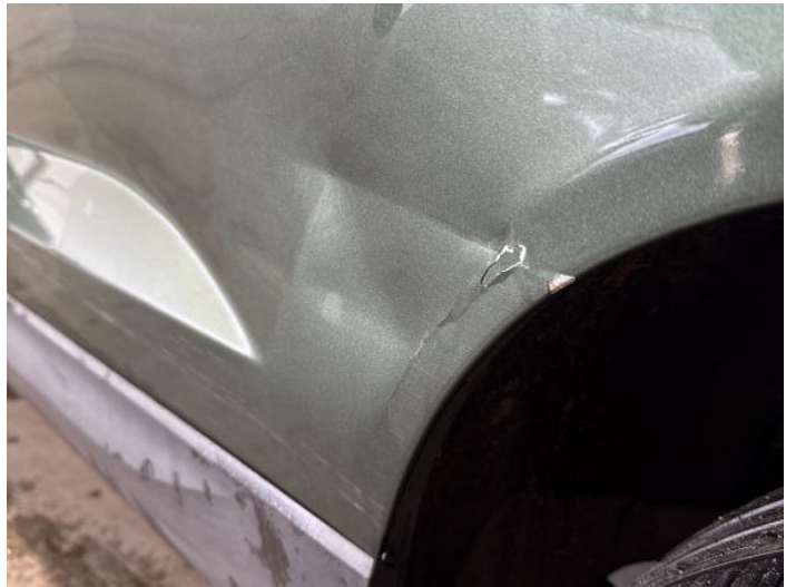
6: Door nsr Dented With Paint Damage