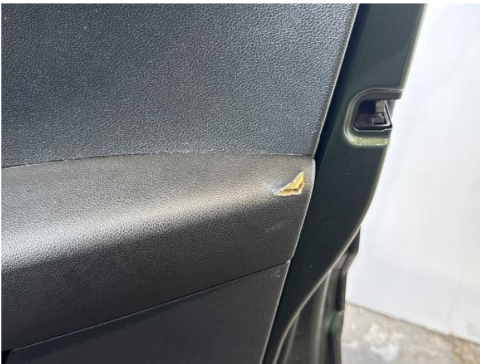
17: Door Pad osf Scuffed UpTo 25mm