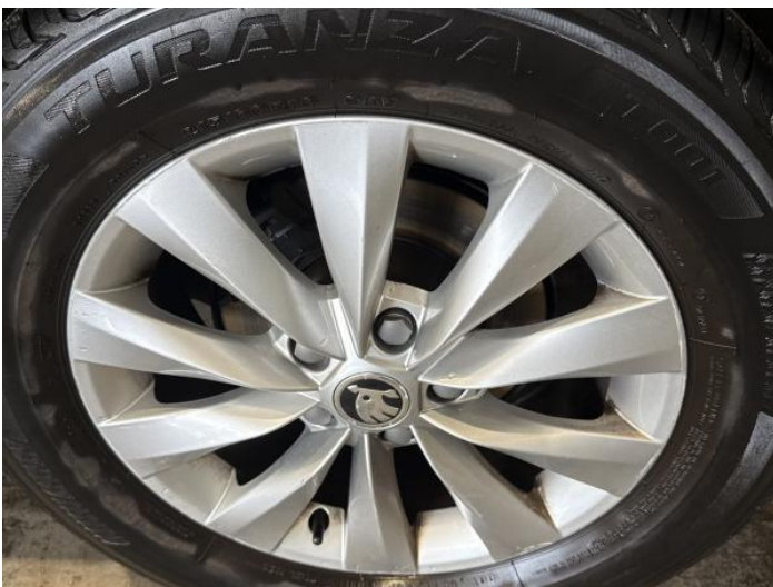
7: Wheel nsr Scratched Over 50mm