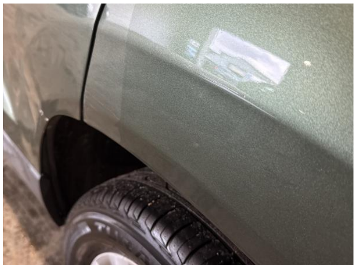
8: Qtr Panel nsr Dented Over 30mm