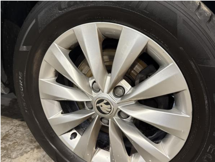
15: Wheel osf Scratched Up To 50mm