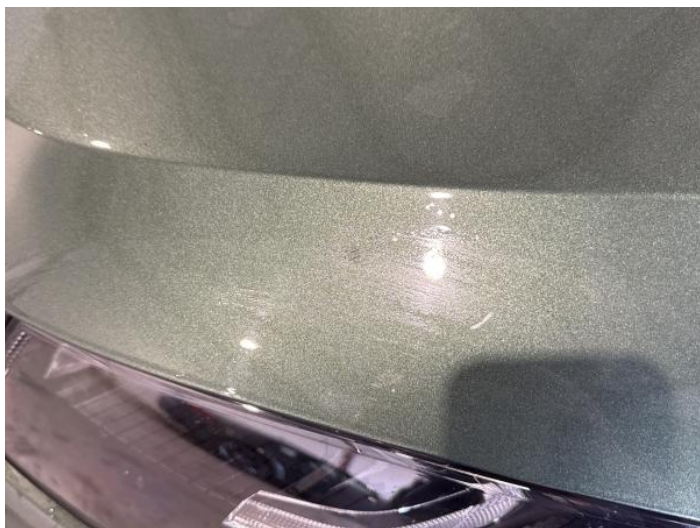
1: Bonnet Scratched UpTo 25mm Thru Paint