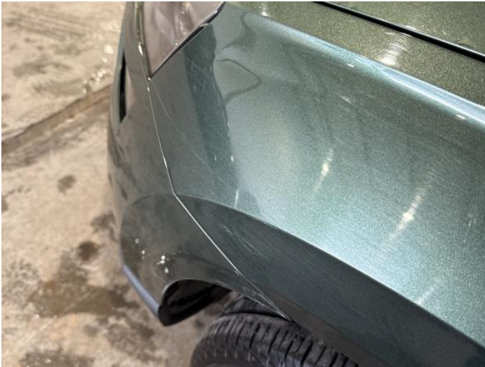
3: Wing nsf Dented With Paint Damage