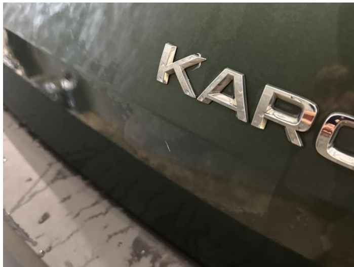
10: Tailgate Scratched UpTo 25mm Thru Paint