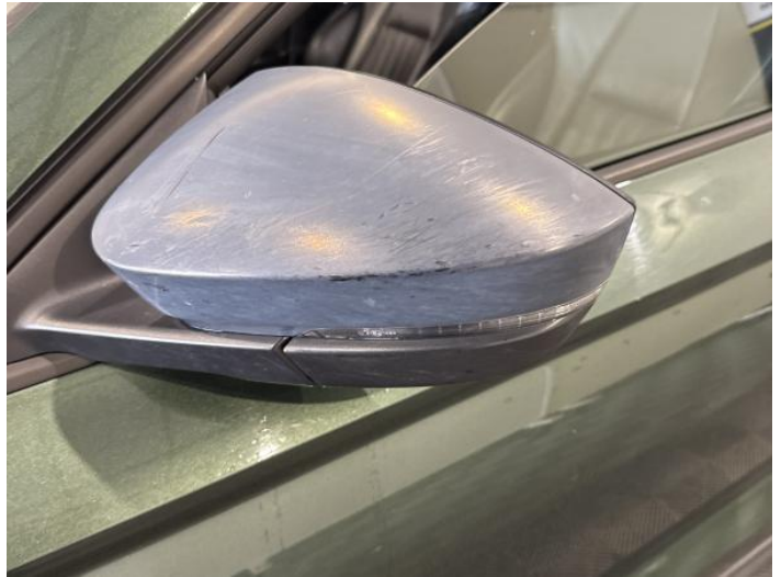
16: Door Mirror Assy nsf Scratched (Painted) Over 25mm Thru Paint