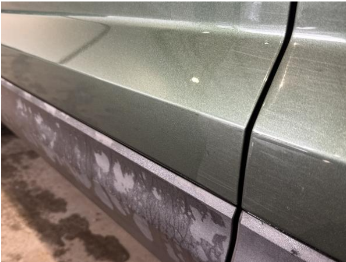
5: Door nsf Scratched Up To 25mm Thru Paint