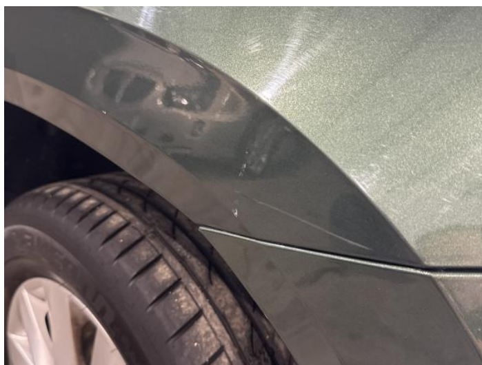
14: Wing osf Dented With Paint Damage