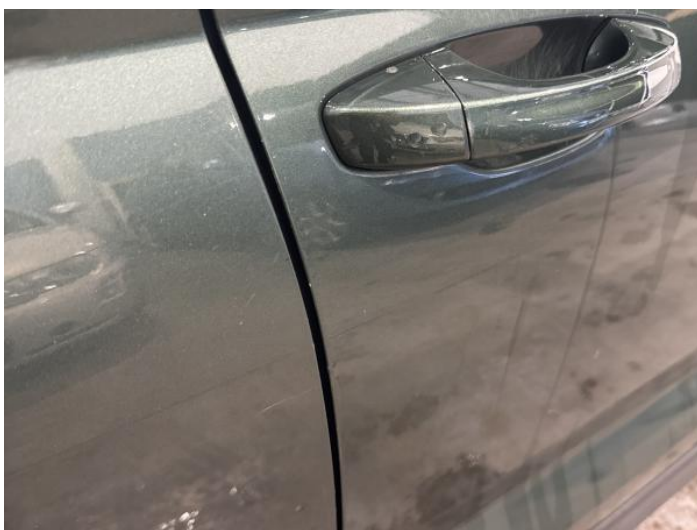
13: Door osf Chipped Edge Chip