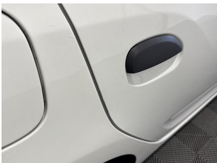
7: Door osr Chipped Edge Chip