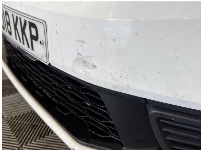
2: Bumper Front Dented With Paint Damage