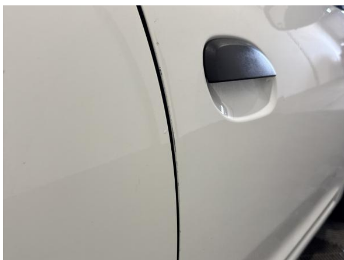
8: Door osf Chipped Edge Chip