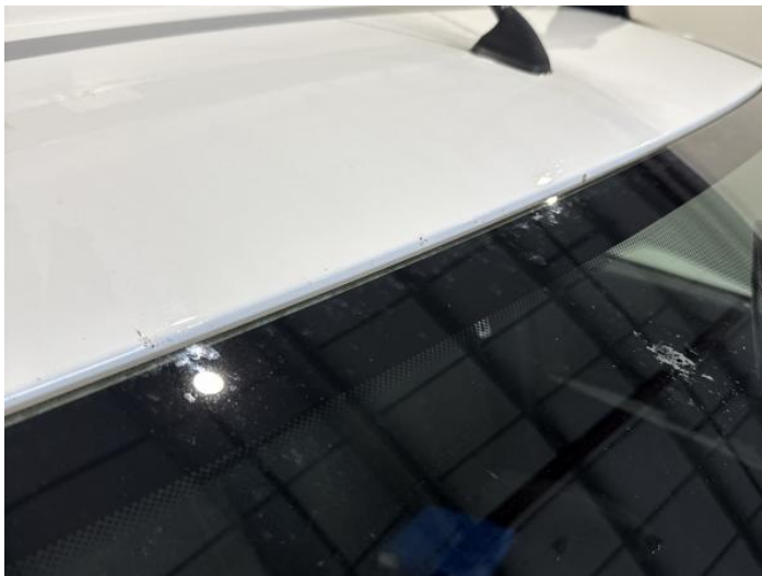
11: Roof Chipped Edge Chip