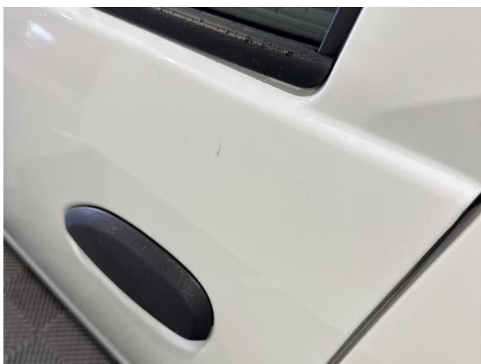
5: Door nsf Scratched UpTo 25mm Thru Paint