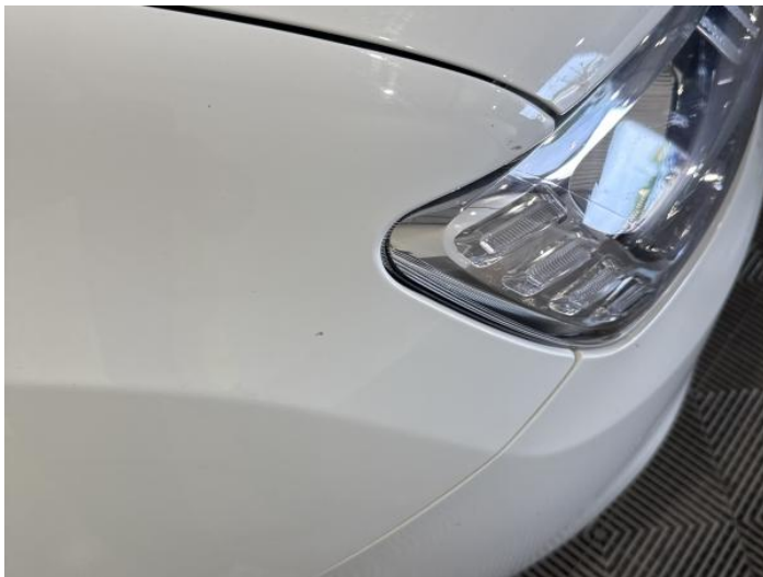
9: Wing osf Chipped 1 To 5