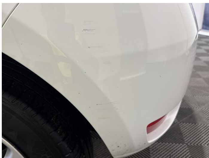
6: Bumper Rear Scratched Over 100mm Thru Paint