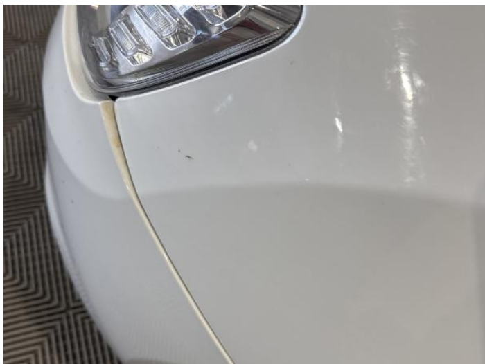
3: Wing nsf Scratched UpTo 25mm Thru Paint