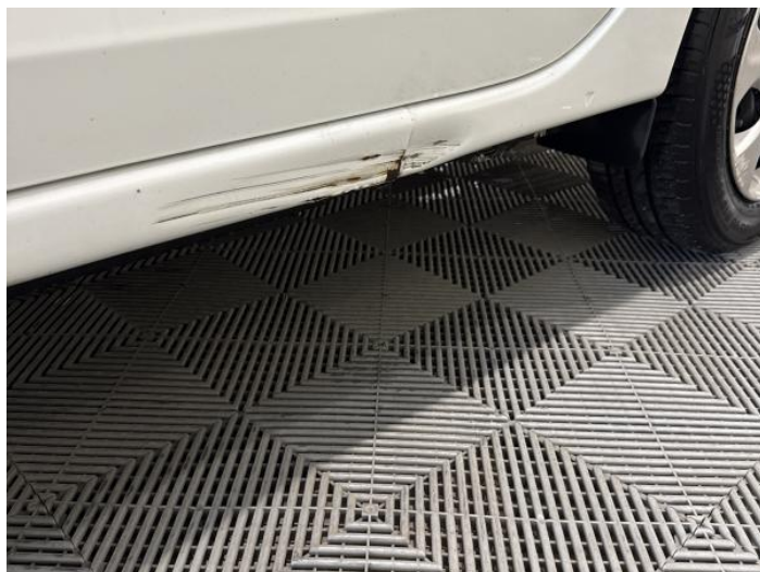
4: Sill ns Dented Over 30mm