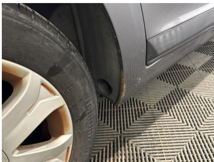
12: Qtr Panel osr Rusted Over 5mm