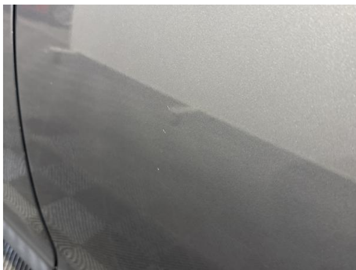
8: Door nsr Scratched UpTo 25mm Thru Paint