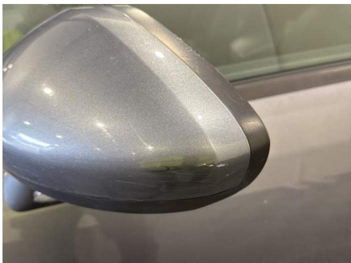
5: Door Mirror Assy nsf Scratched (Painted) UpTo 25mm Thru Paint