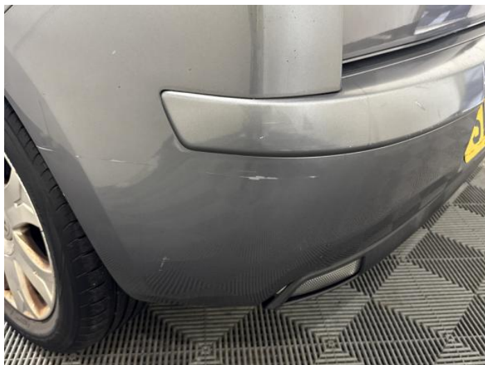
10: Bumper Rear Scratched Over 100mm Thru Paint