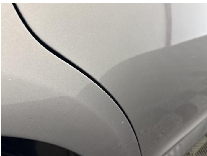
13: Door osr Chipped Edge Chip