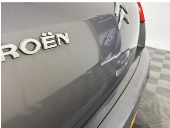
11: Tailgate Poor Previous Repair Rippled UpTo 30%