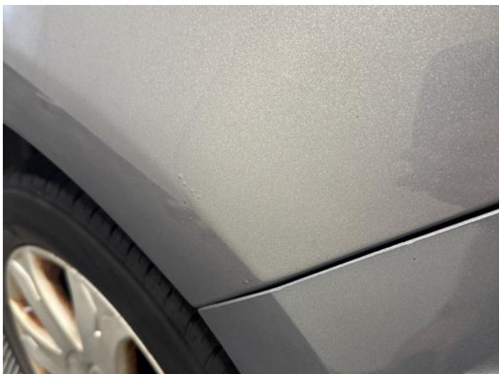
9: Qtr Panel nsr Poor Previous Repair Rippled UpTo 30%