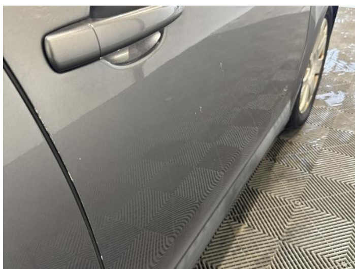
14: Door osf Dented Over 30mm