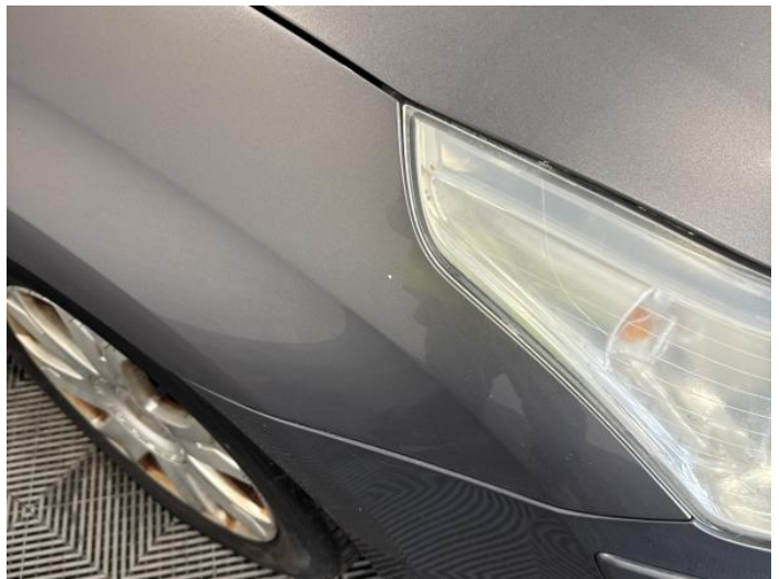
16: Wing osf Chipped Multiple Chips