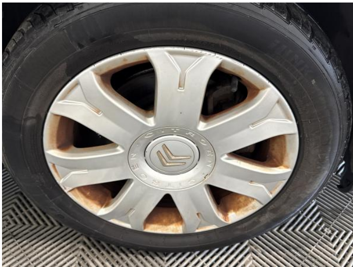
15: Wheel osf Scratched Over 50mm