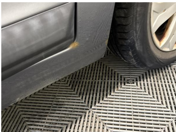
7: Sill ns Rusted Over 5mm