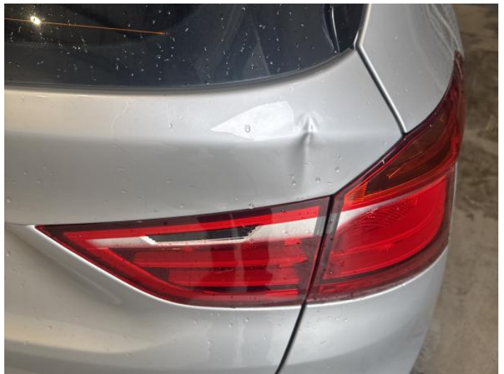
2: Boot Lid Dented Over 30mm