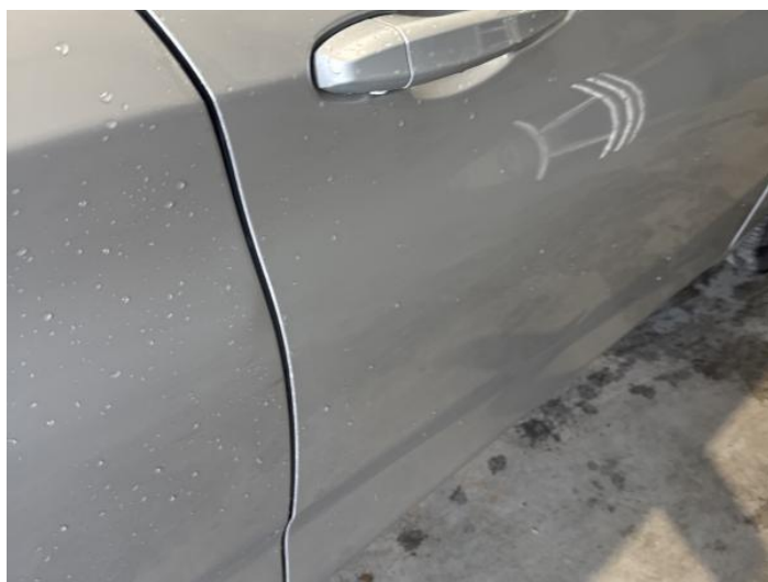
8: Door osf Dented Over 30mm