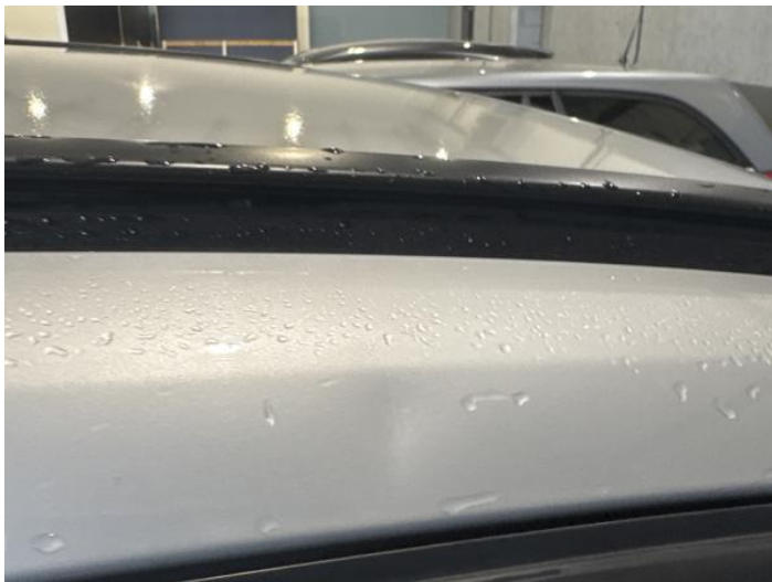
5: B Post os Dented Over 30mm