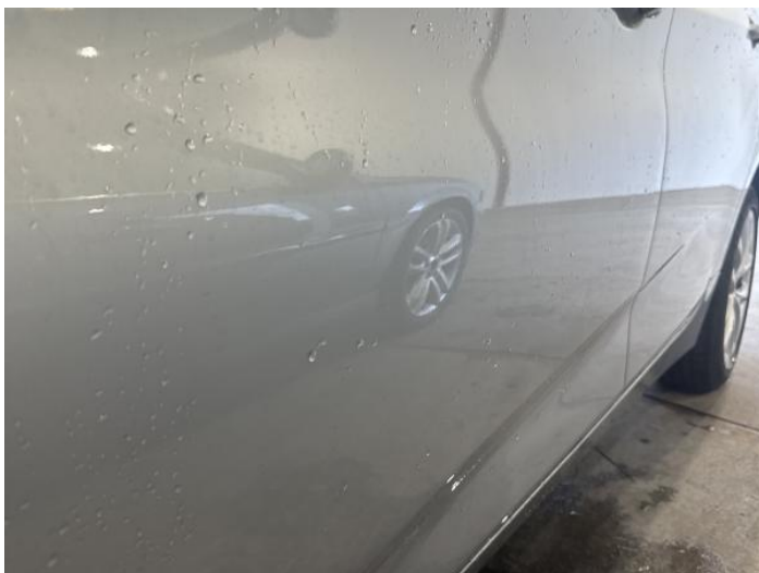
16: Door nsf Dented Over 2 UpTo 10mm