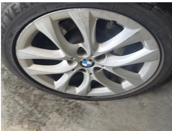
7: Wheel osr Scratched Over 50mm