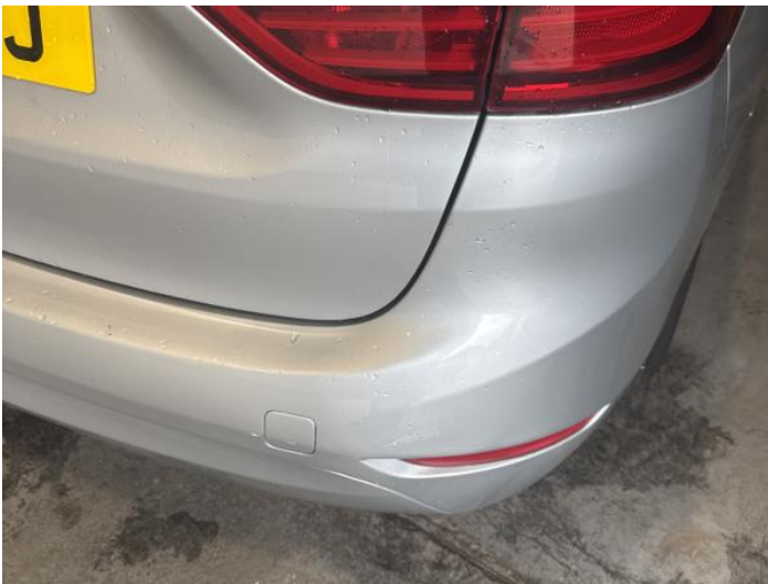
1: Bumper Rear Poor Previous Repair Poor Paint