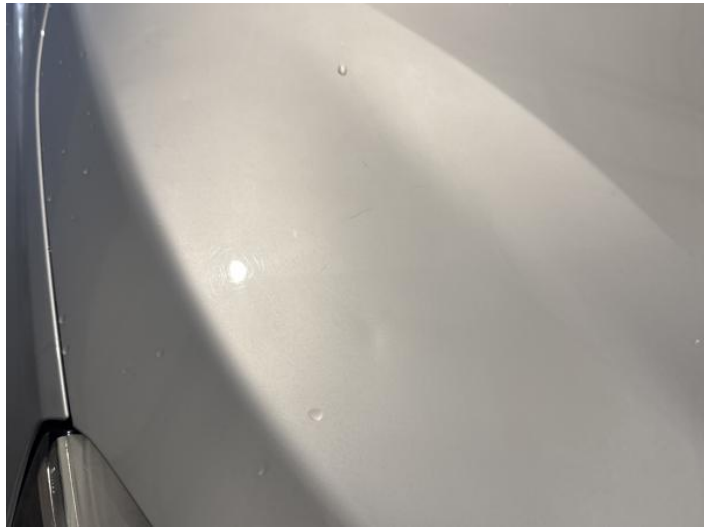
12: Bonnet Dented With Paint Damage