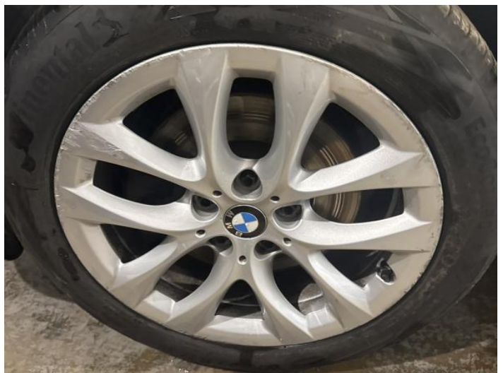
14: Wheel nsf Scratched Over 50mm