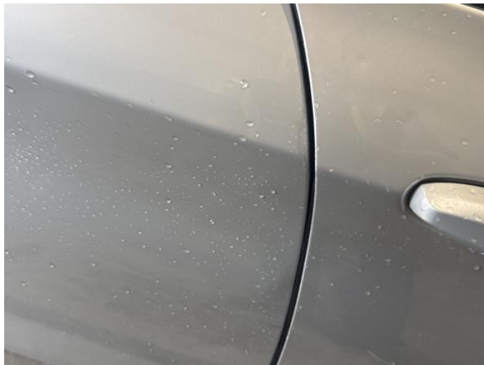
6: Door osr Dented Over 30mm