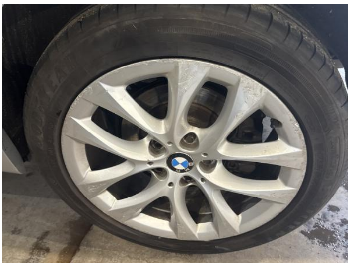
19: Wheel nsr Scratched Over 50mm