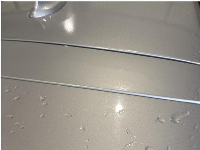
3: Roof Dented Over 30mm