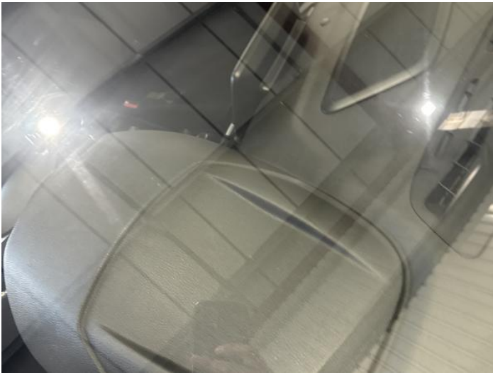
11: Screen Front Chipped UpTo 10mm