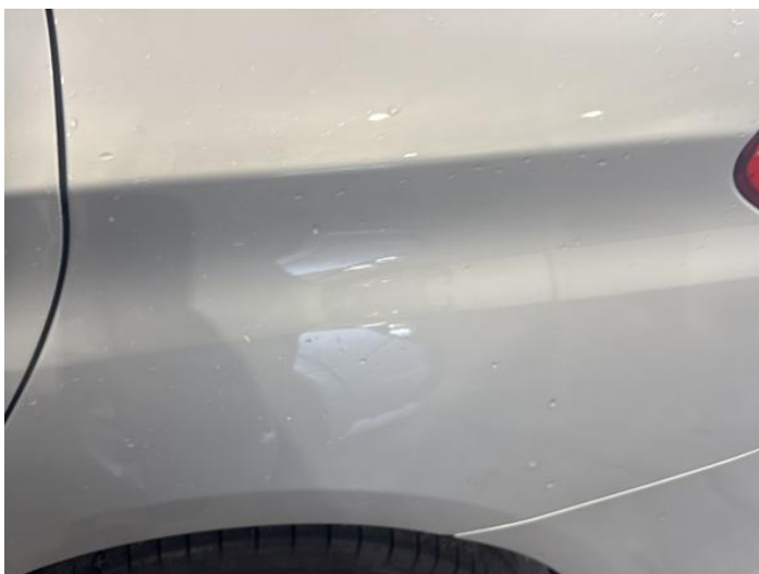
18: Qtr Panel nsr Dented Over 2 UpTo 10mm