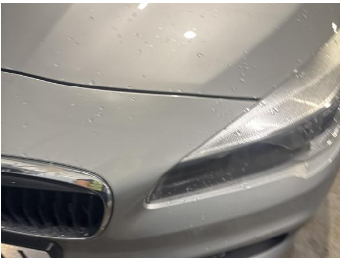
13: Bumper Front Poor Previous Repair Poor Paint