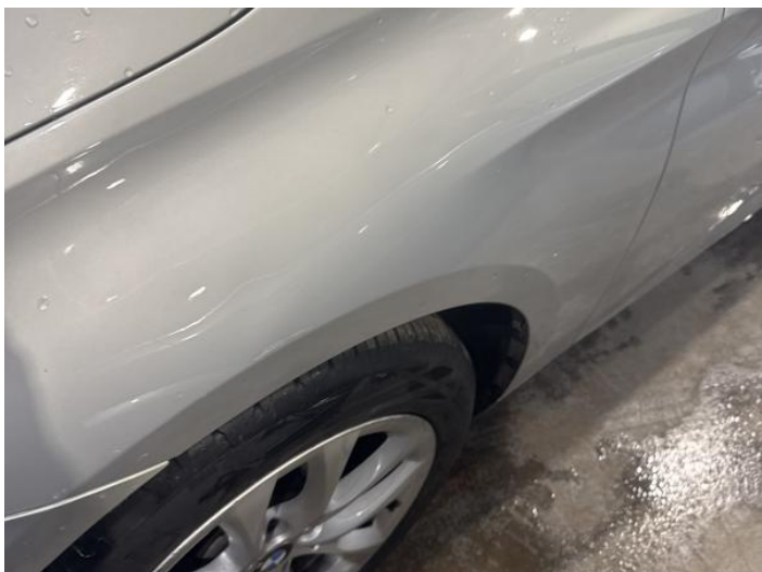
15: Wing nsf Dented With Paint Damage