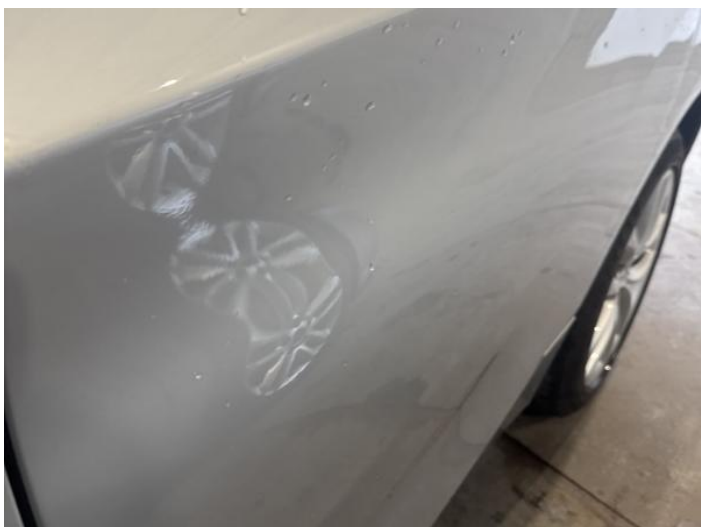
17: Door nsr Dented Over 30mm