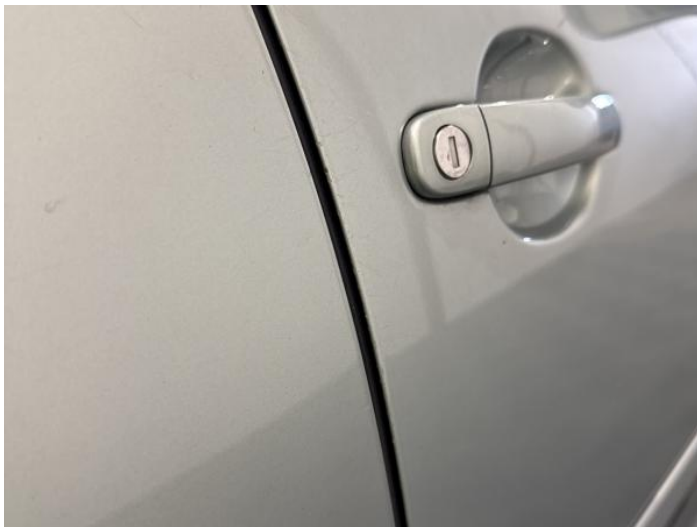
15: Door osf Chipped Edge Chip