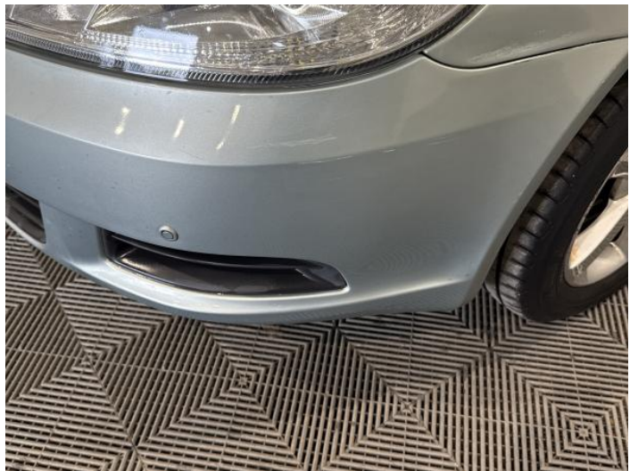
2: Bumper Front Scratched Over 100mm Thru Paint