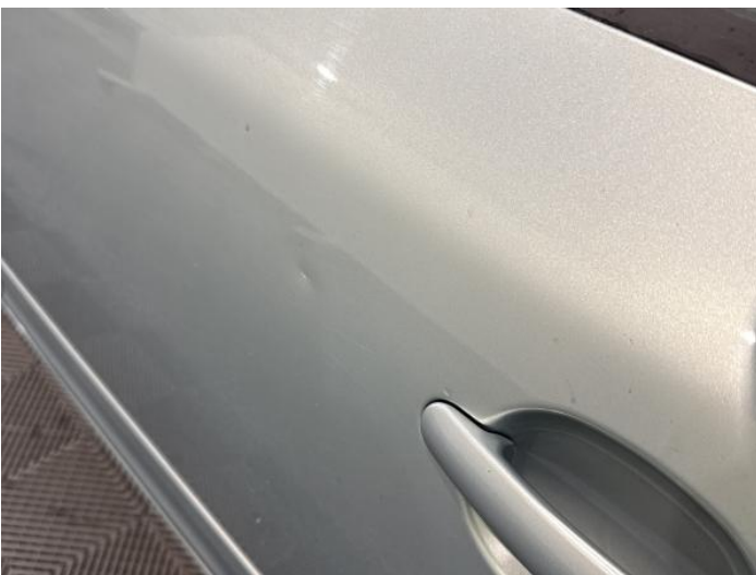
7: Door nsr Dented Between 10mm + 30mm