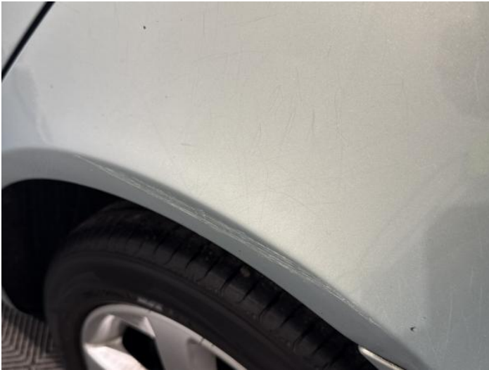
9: Qtr Panel nsr Dented With Paint Damage