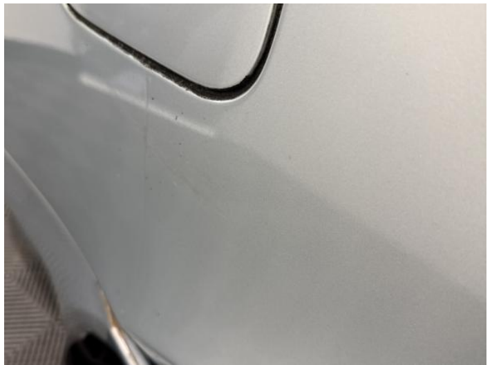
12: Qtr Panel osr Scratched Over 25mm Thru Paint