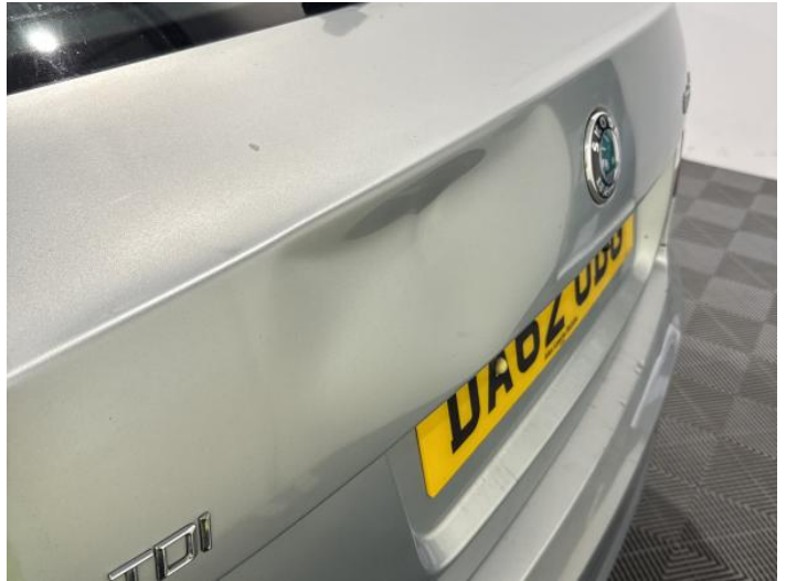
10: Tailgate Dented Over 30mm