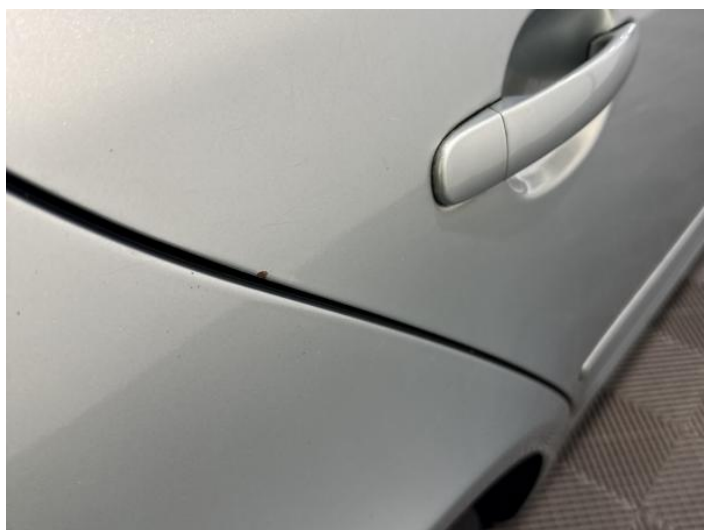
14: Door osr Scratched UpTo 25mm Thru Paint