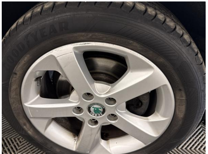
16: Wheel osf Scratched Over 50mm