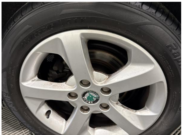
8: Wheel nsr Scratched Over 50mm