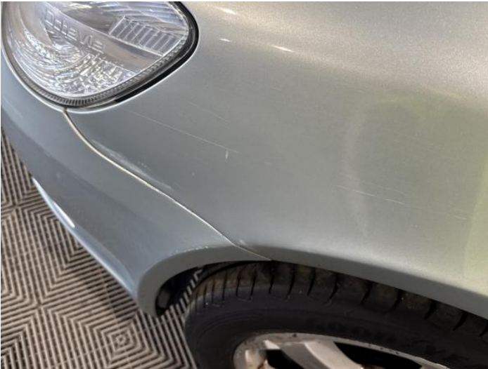
3: Wing nsf Dented With Paint Damage