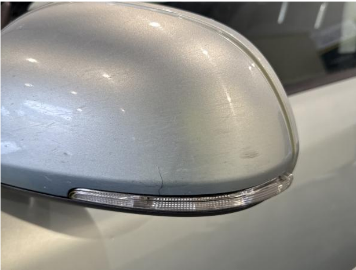
5: Door Mirror Assy nsf Scratched (Painted) UpTo 25mm Thru Paint