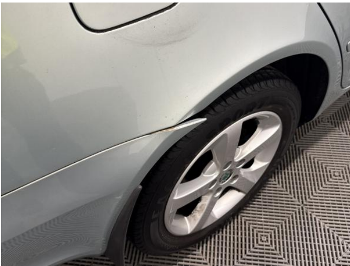
11: Bumper Rear Dented With Paint Damage