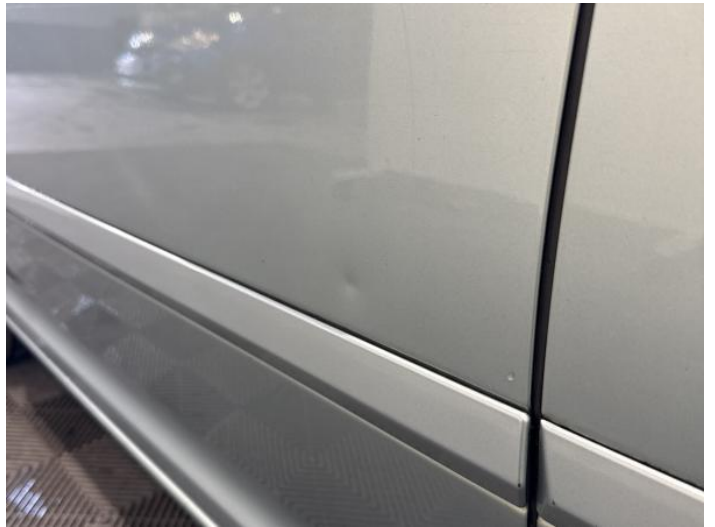
6: Door nsf Dented Between 10mm + 30mm