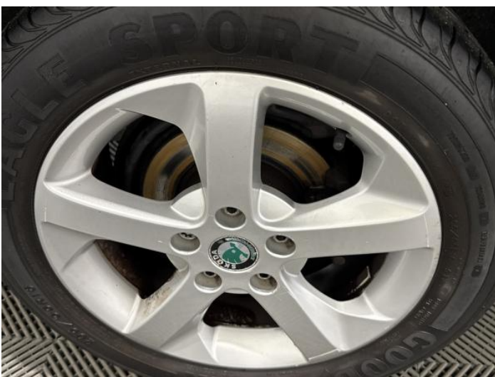
13: Wheel osr Scratched Over 50mm