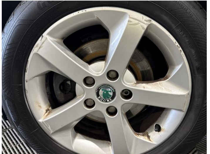
4: Wheel nsf Scratched Over 50mm