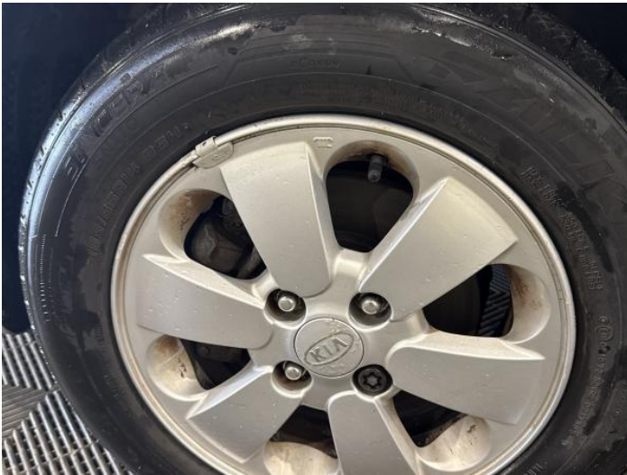
5: Wheel nsf Scratched Over 50mm