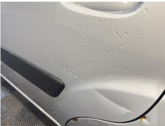
7: Door nsr Dented Over 30mm