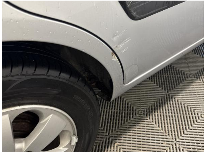
10: Qtr Panel osr Scratched Over 25mm Thru Paint