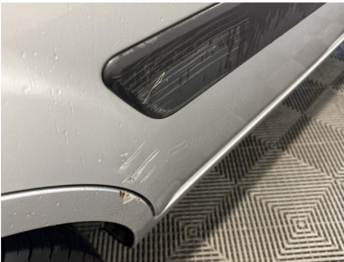
11: Door osr Dented With Paint Damage