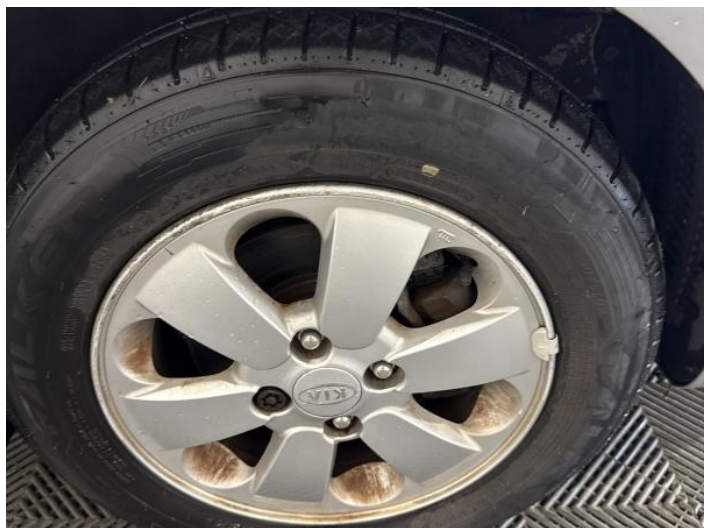
14: Wheel osf Scratched Over 50mm