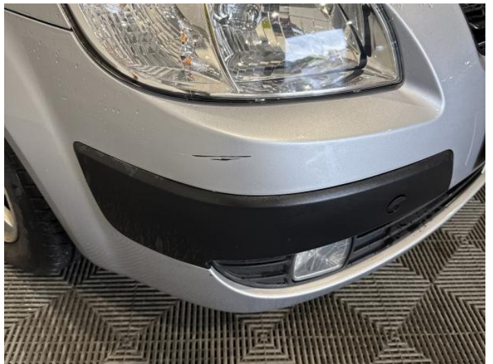
2: Bumper Front Scratched Over 100mm Thru Paint