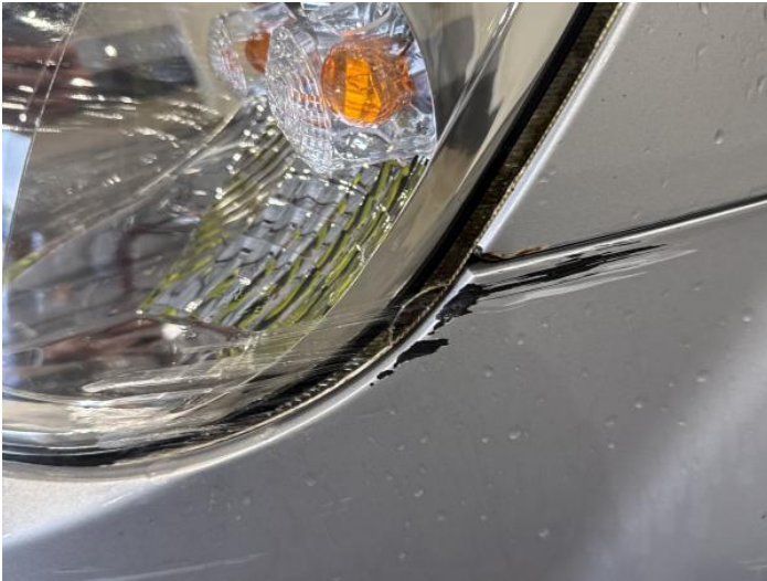
3: Headlamp nsf Broken Replace