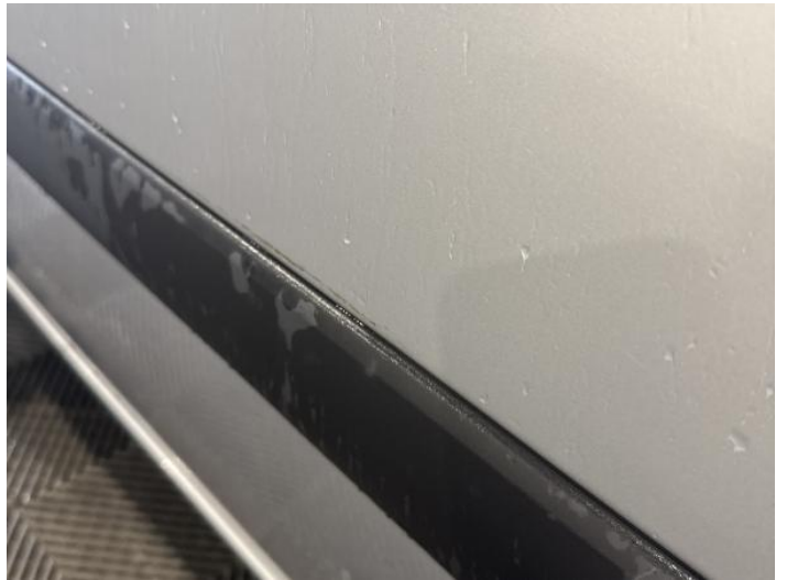
6: Door nsf Chipped 1 To 5