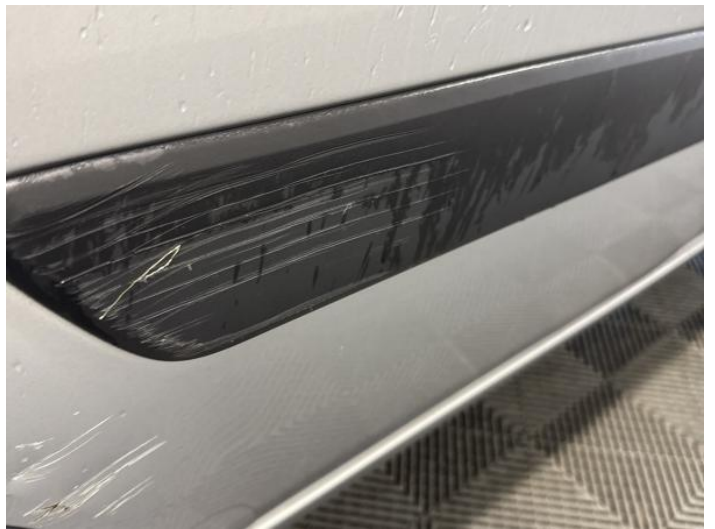
12: Door Moulding osr Scuffed (Unpainted) Over 100mm