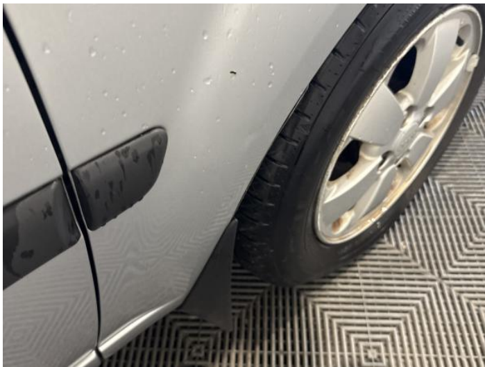
15: Wing osf Dented With Paint Damage