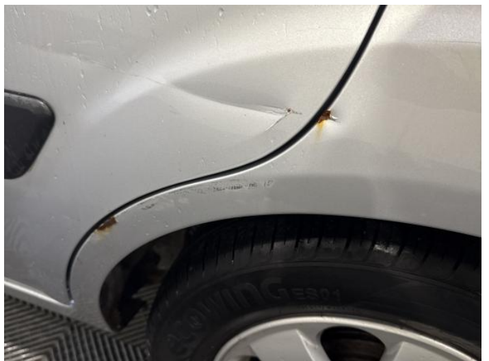
8: Qtr Panel nsr Dented With Paint Damage