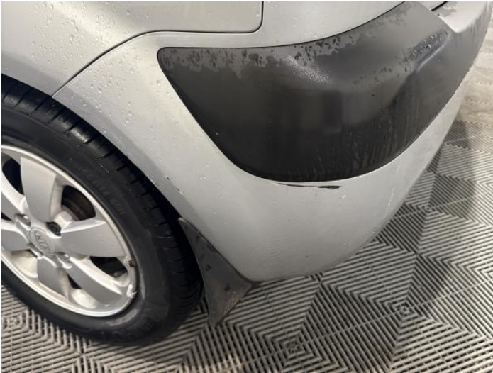
9: Bumper Rear Scratched Over 100mm Thru Paint