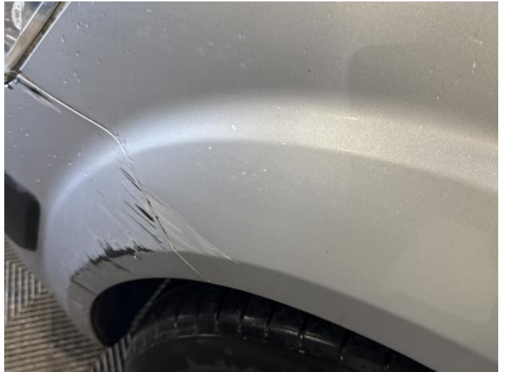
4: Wing nsf Dented With Paint Damage