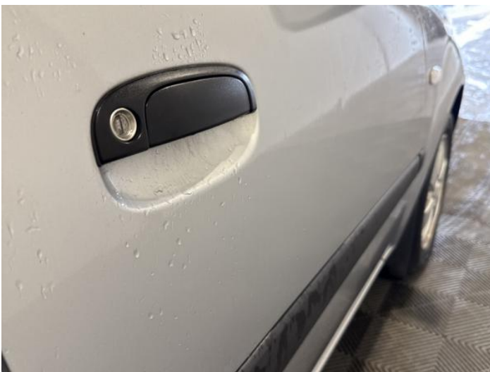
13: Door osf Dented Over 30mm