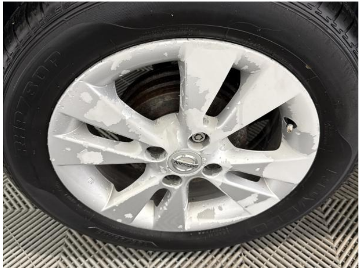
12: Wheel osr Scratched Over 50mm