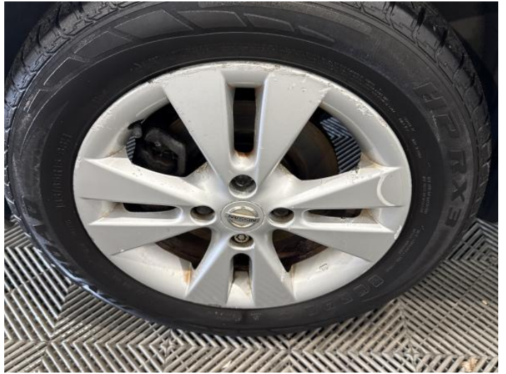
4: Wheel nsf Scratched Over 50mm