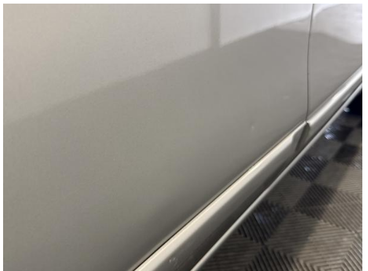
14: Door osr Dented Between 10mm + 30mm