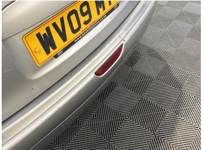
10: Bumper Rear Dented With Paint Damage