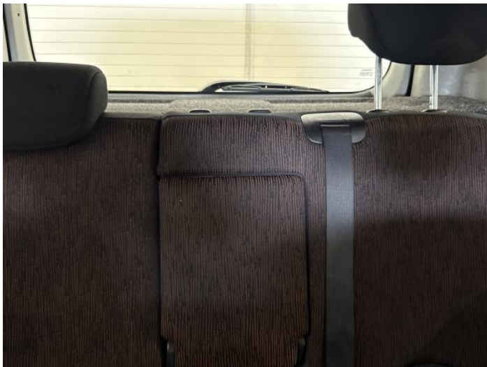
1: Headrest Assy Rear Seat Centr Missing Replace