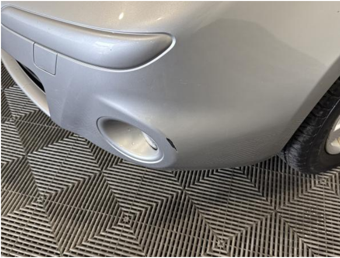
3: Bumper Front Scratched Over 100mm Thru Paint