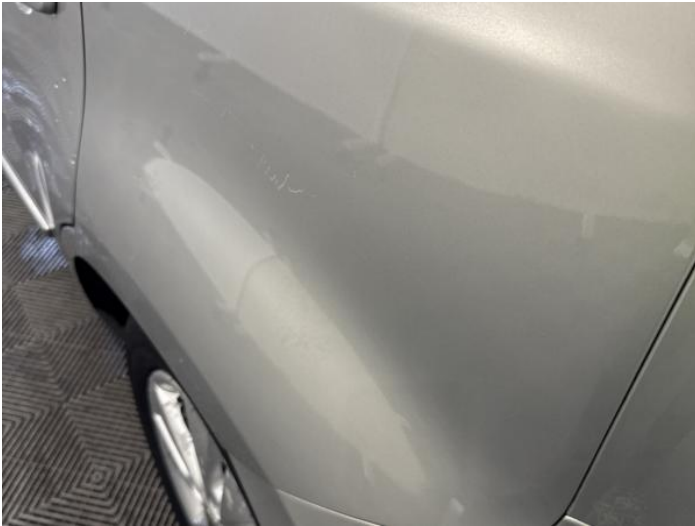
9: Qtr Panel nsr Scratched Over 25mm Thru Paint