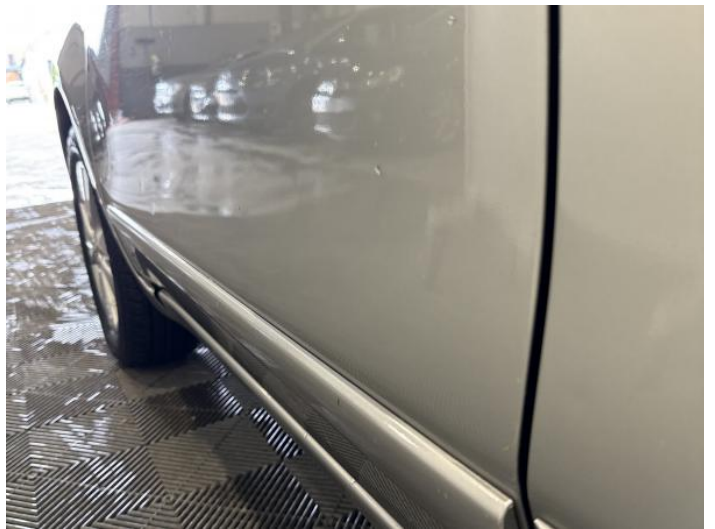
6: Door nsf Dented Over 30mm