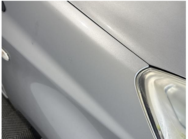
18: Wing osf Chipped 1 To 5