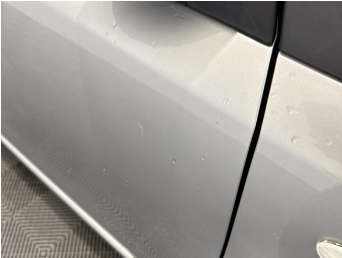
15: Door osf Dented Between 10mm + 30mm