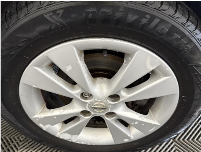
17: Wheel osf Scratched Over 50mm