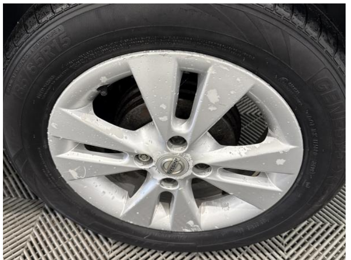
8: Wheel nsr Scratched Over 50mm