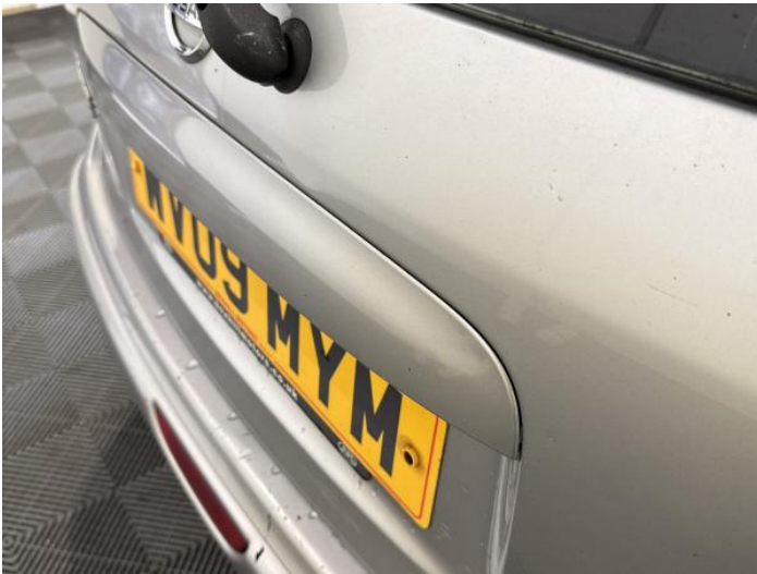
11: Tailgate Dented Over 30mm