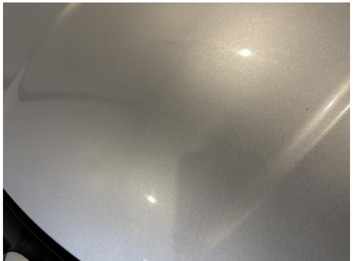
2: Bonnet Dented Over 30mm