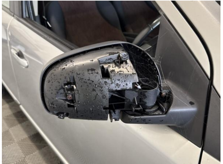
16: Door Mirror Assy osf Missing Replace