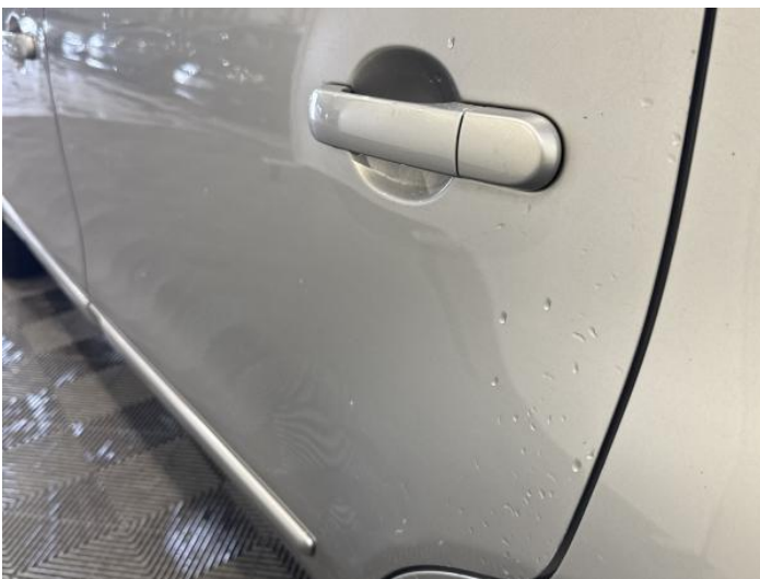
7: Door nsr Dented Over 30mm