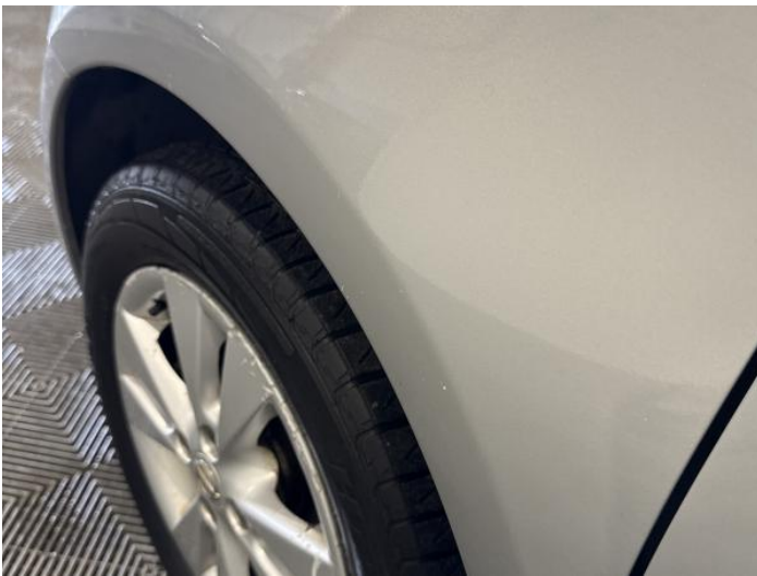
5: Wing nsf Chipped Multiple Chips