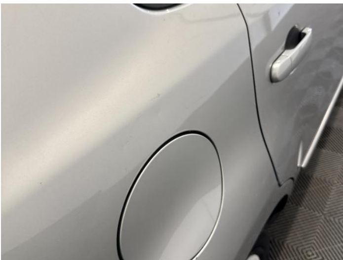
13: Qtr Panel osr Dented Between 10mm + 30mm