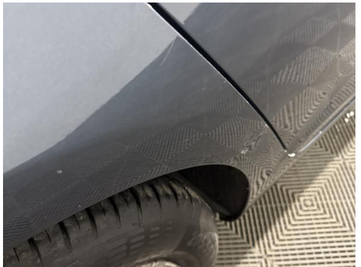
12: Qtr Panel osr Dented With Paint Damage