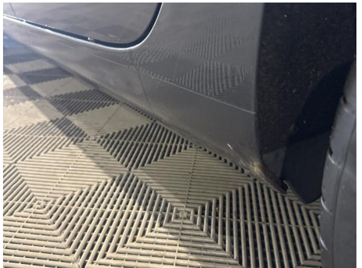
6: Sill ns Dented Over 30mm