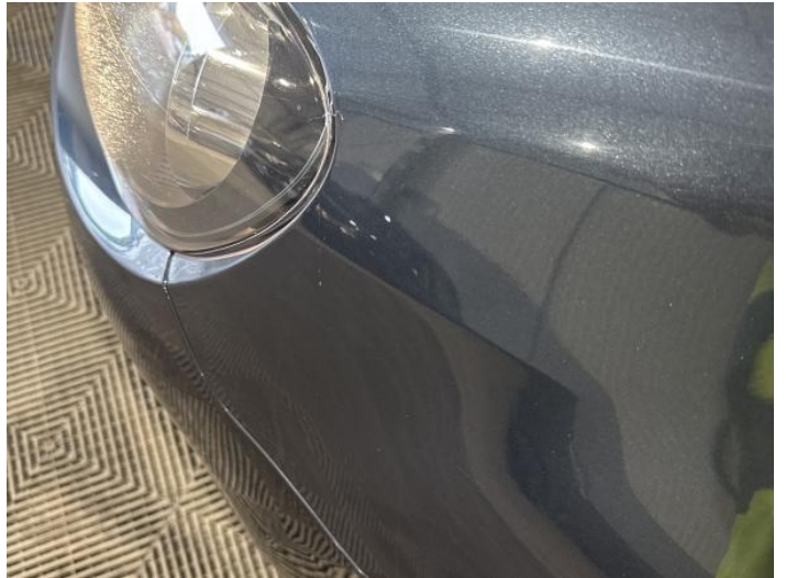
4: Wing nsf Chipped 1 To 5