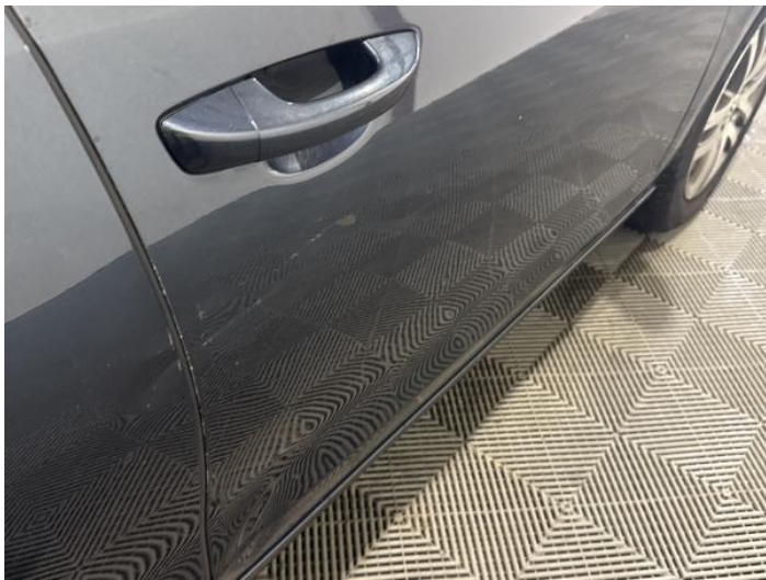
15: Door osf Dented Over 30mm