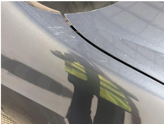
17: Wing osf Scratched Over 25mm Thru Paint