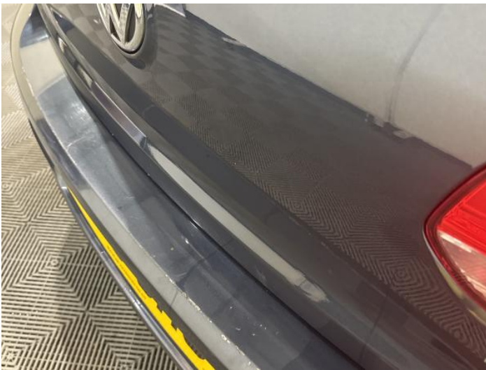
11: Tailgate Scratched Over 25mm Thru Paint