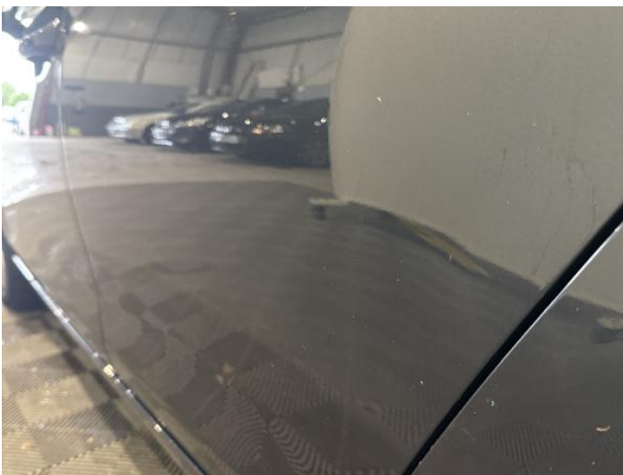
7: Door nsr Dented Over 30mm