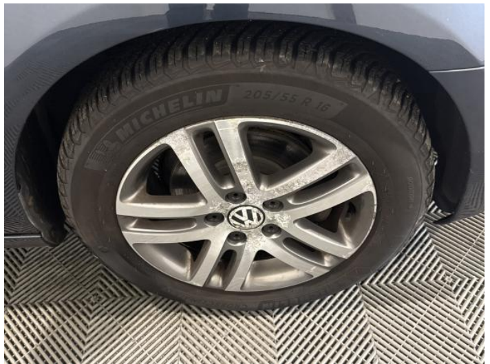
16: Wheel osf Scratched Over 50mm