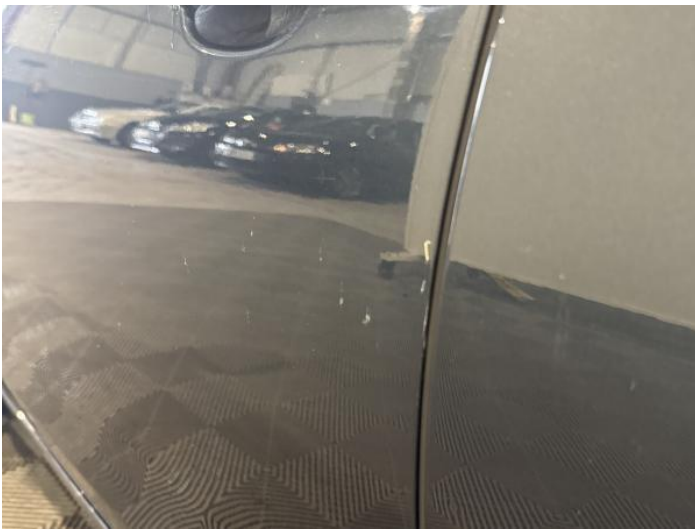
5: Door nsf Dented Between 10mm + 30mm