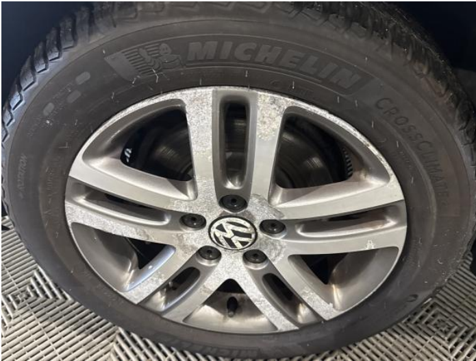
3: Wheel nsf Scratched Over 50mm