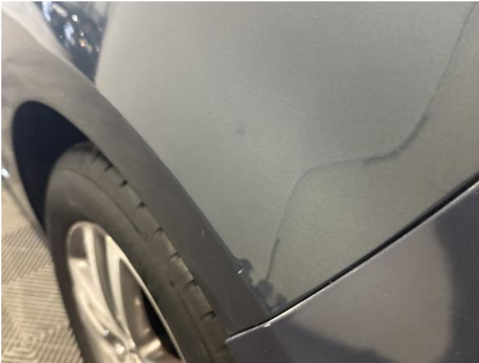
9: Qtr Panel nsr Dented Between 10mm + 30mm