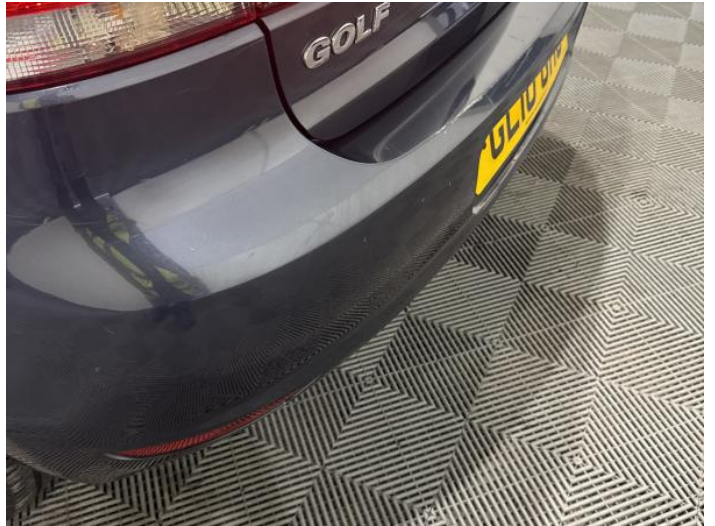
10: Bumper Rear Scratched Over 100mm Thru Paint