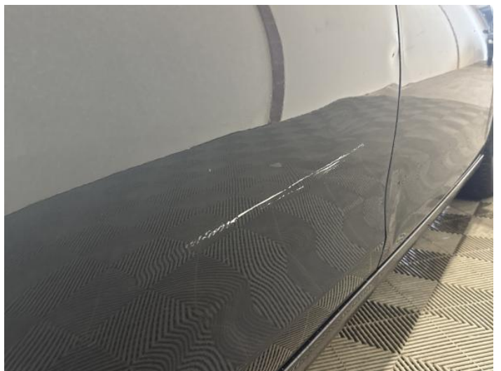
14: Door osr Dented With Paint Damage