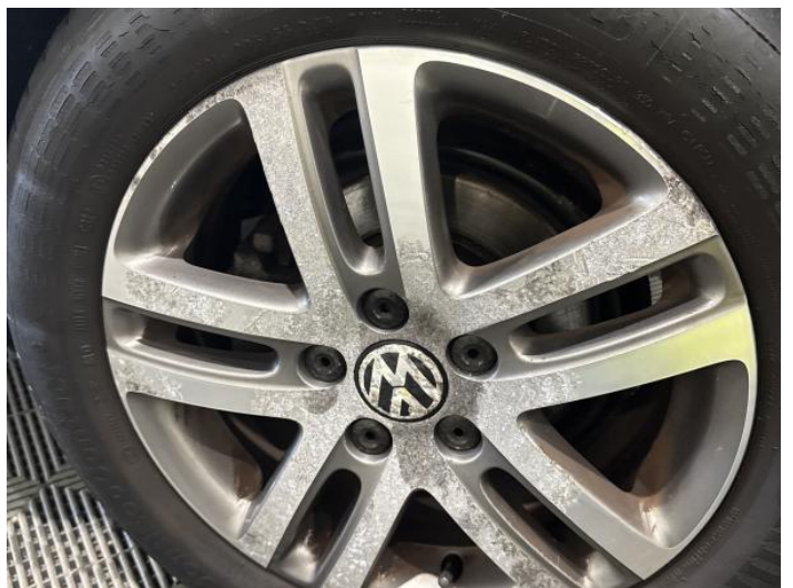
8: Wheel nsr Scratched Over 50mm