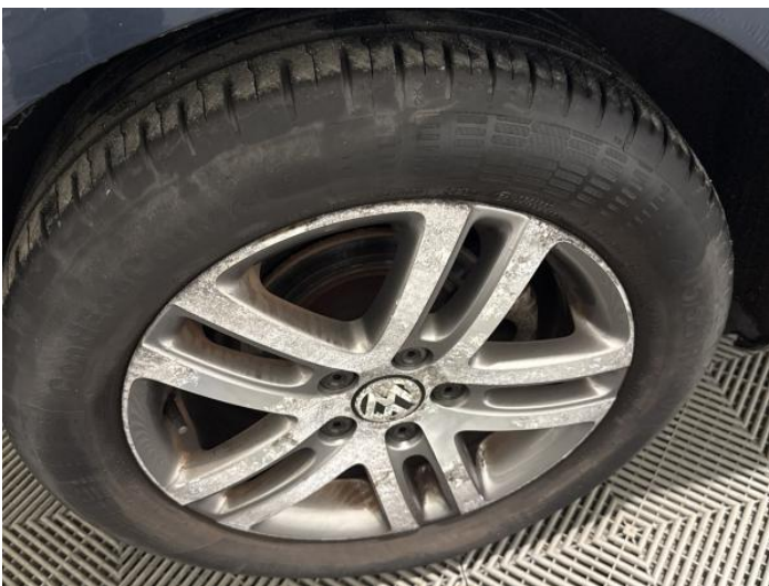
13: Wheel osr Scratched Over 50mm