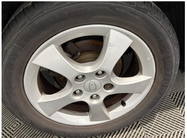
12: Wheel osr Scratched Over 50mm