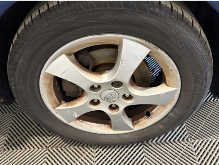
16: Wheel osf Scratched Over 50mm