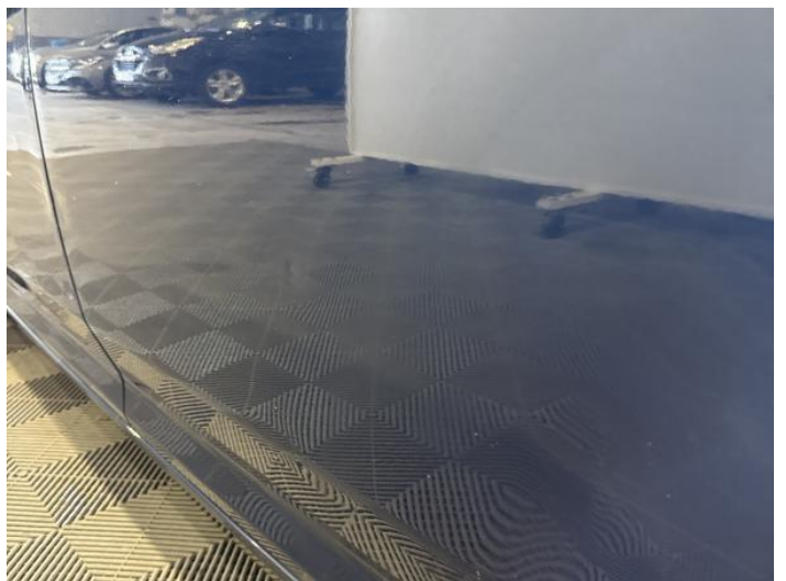
8: Door nsr Dented Over 30mm