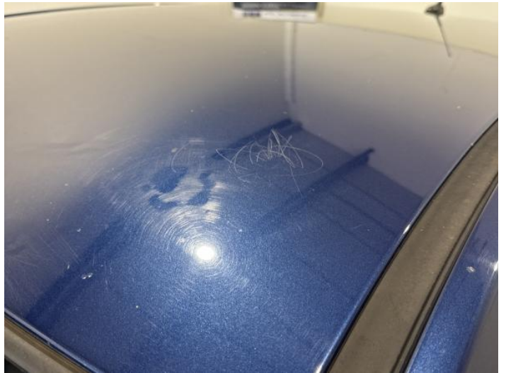
6: Roof Scratched Over 25mm Thru Paint