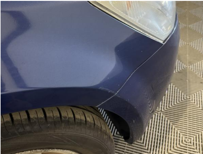
17: Wing osf Scratched Over 25mm Thru Paint