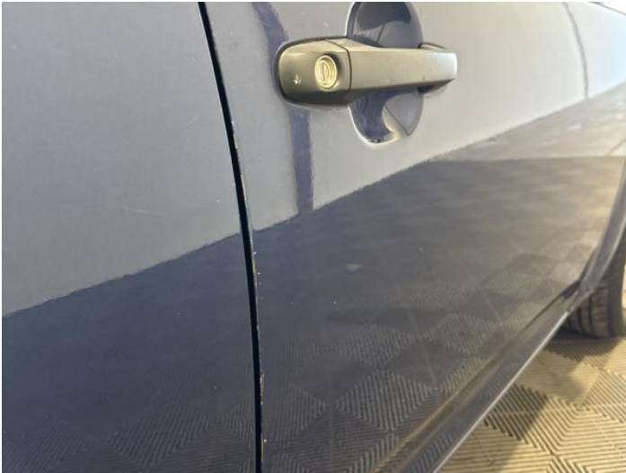
15: Door osf Scratched Over 25mm Thru Paint