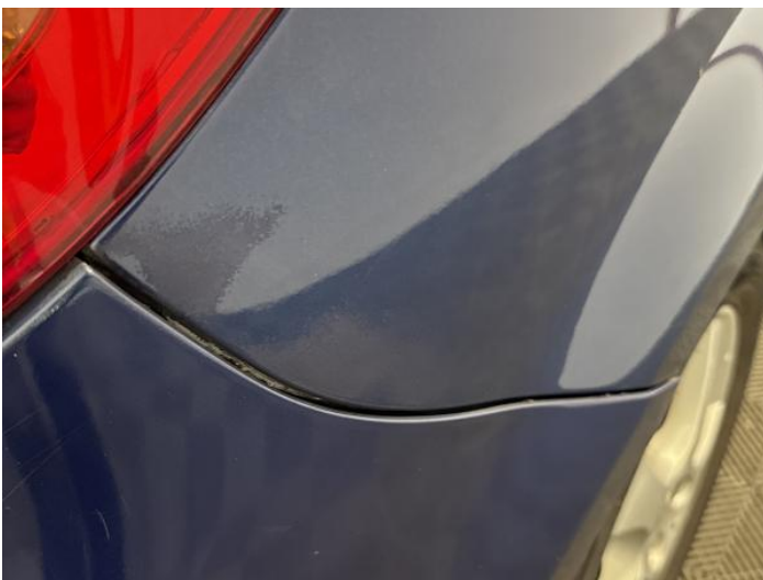
13: Qtr Panel osr Scratched Over 25mm Thru Paint