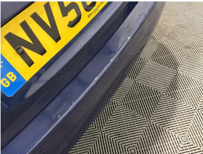
11: Bumper Rear Poor Previous Repair Paint Flake