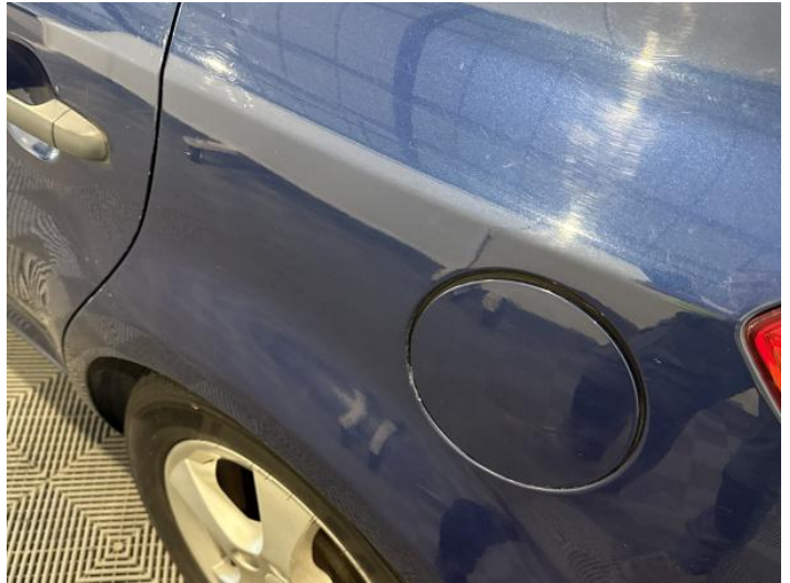
10: Qtr Panel nsr Dented With Paint Damage