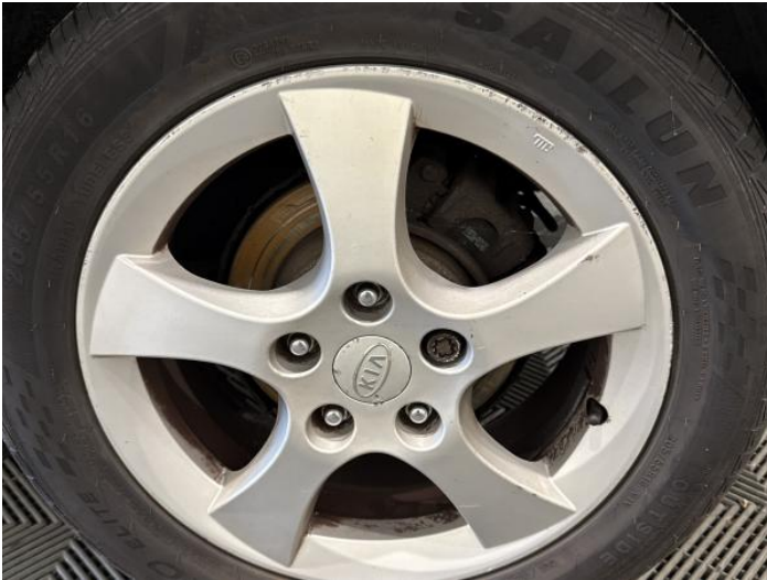
9: Wheel nsr Scratched Over 50mm