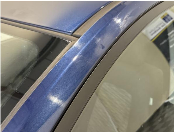
5: A Post ns Scratched Over 25mm Thru Paint