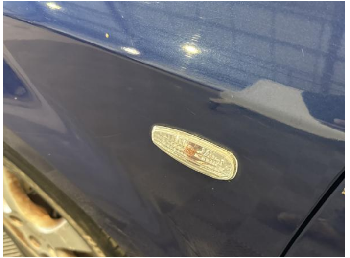
4: Wing nsf Chipped 1 To 5