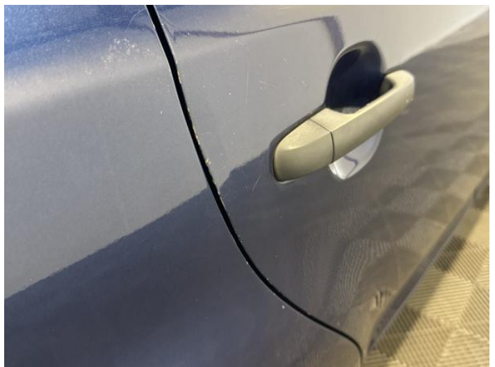
14: Door osr Scratched Over 25mm Thru Paint