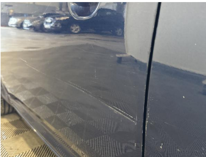
7: Door nsf Dented With Paint Damage