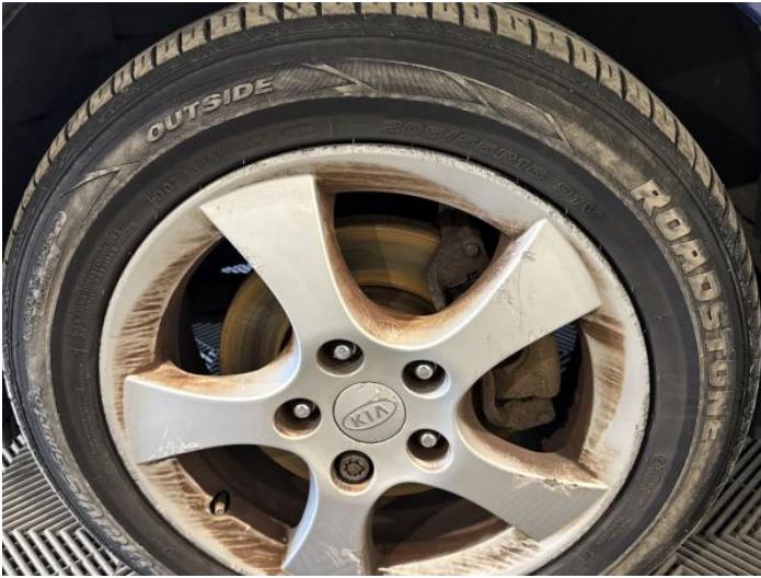
3: Wheel nsf Scratched Over 50mm