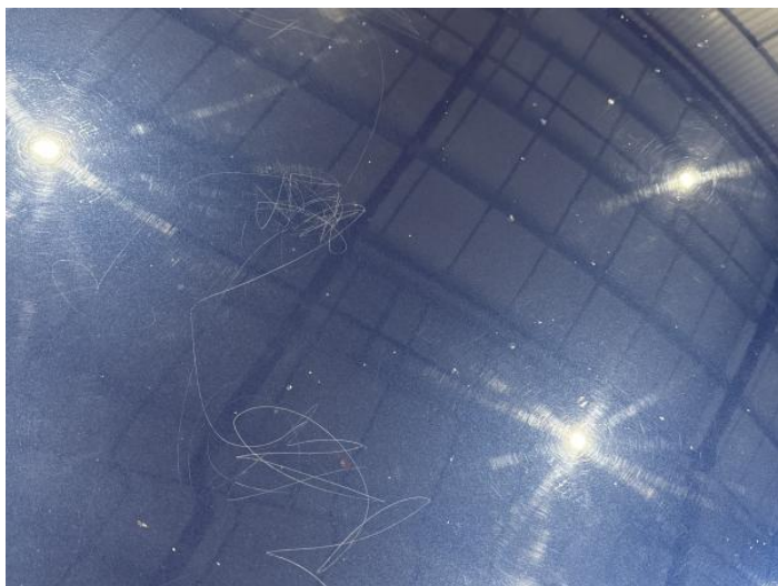
1: Bonnet Scratched Over 25mm Thru Paint