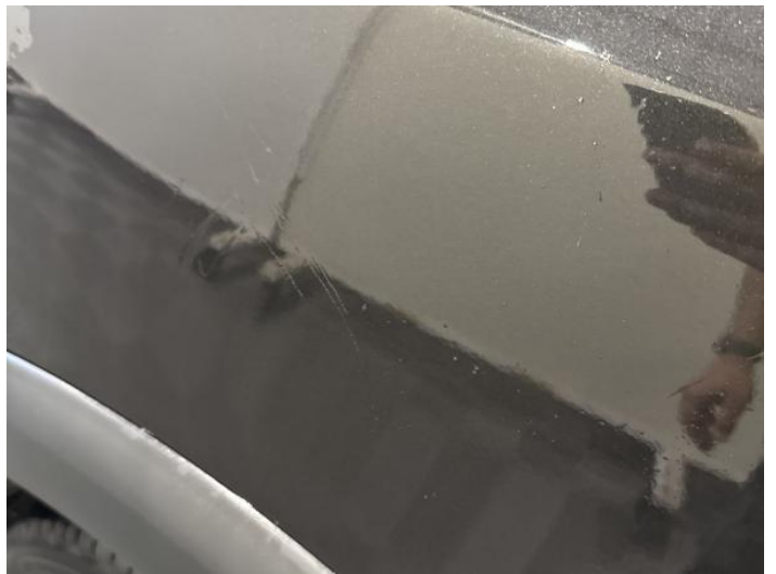
6: Qtr Panel nsr Scratched Over 25mm Thru Paint