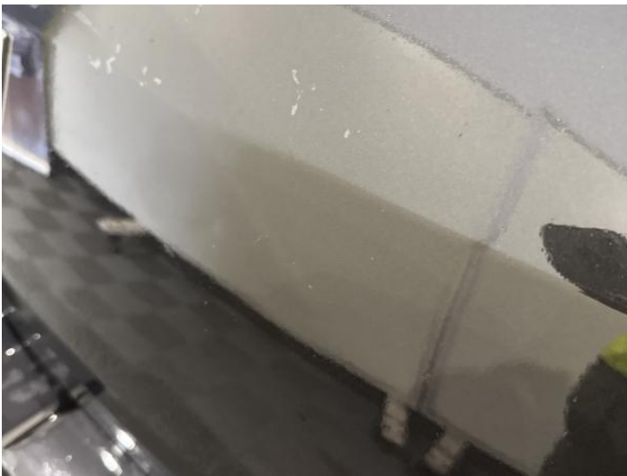
11: Tailgate Dented Between 10mm + 30mm