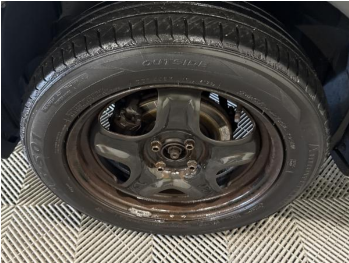
3: Wheel Trim nsf Missing Replace