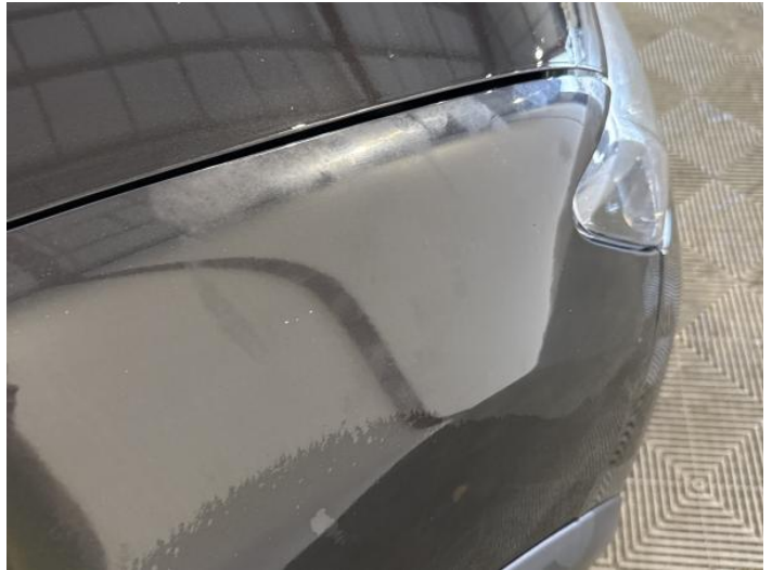
10: Wing osf Scratched Over 25mm Thru Paint