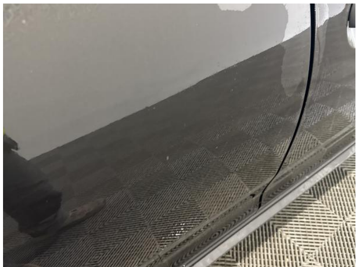
8: Door osr Scratched Over 25mm Thru Paint