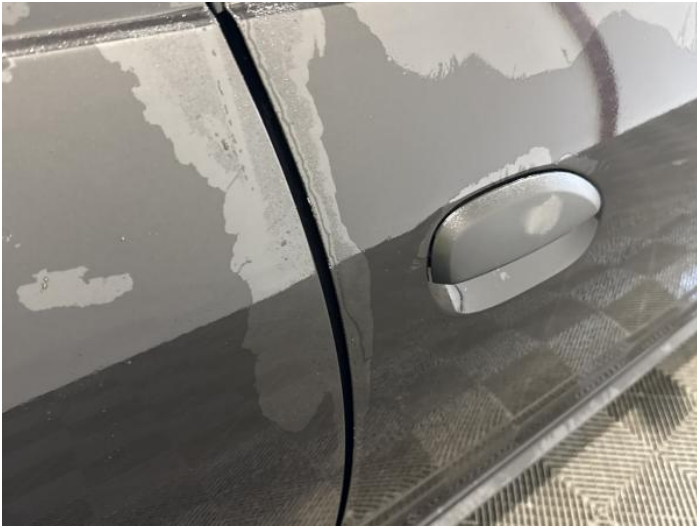
9: Door osf Chipped Edge Chip