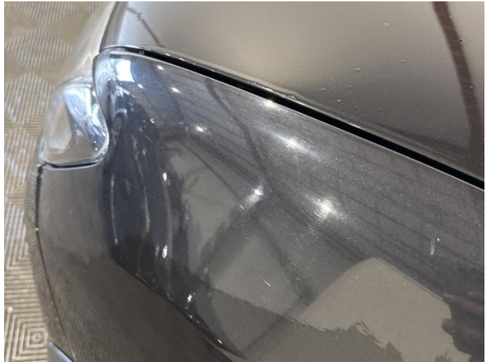
4: Wing nsf Scratched UpTo 25mm Thru Paint