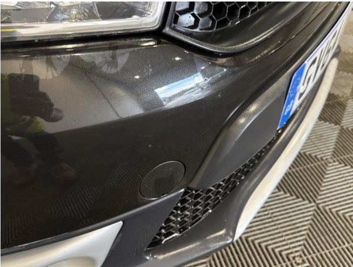
1: Bumper Front Chipped Multiple Chips