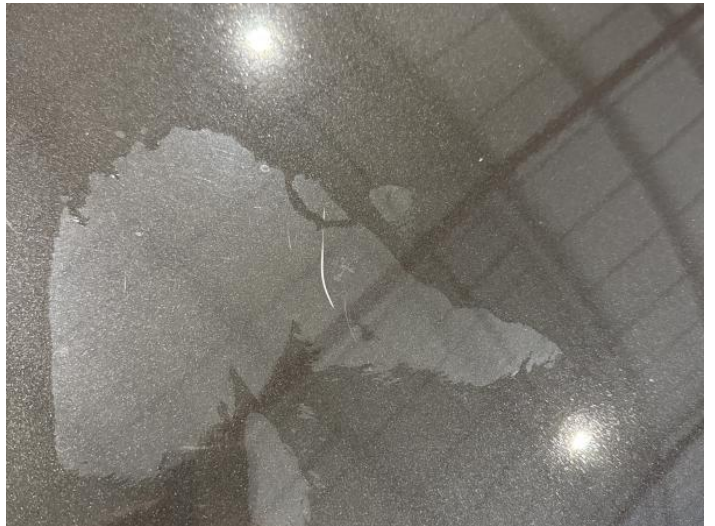
2: Bonnet Scratched Over 25mm Thru Paint