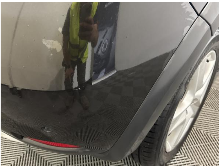
7: Bumper Rear Scratched 25 to 100mm Thru Paint