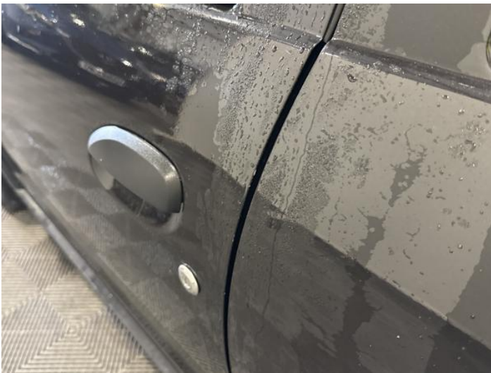
5: Door nsf Chipped Edge Chip