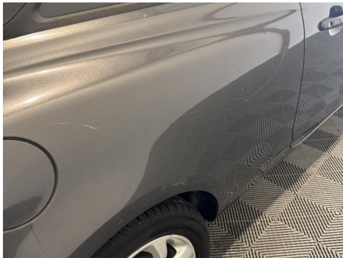
10: Qtr Panel osr Dented With Paint Damage