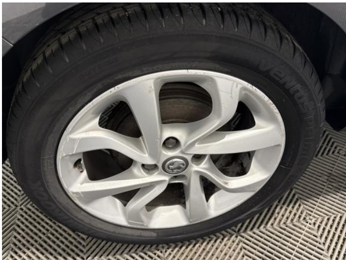
9: Wheel osr Scratched Over 50mm