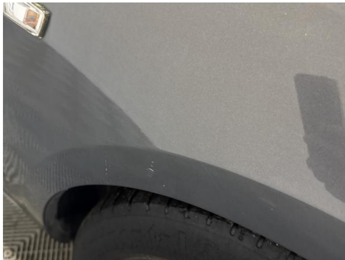
12: Wing osf Scratched UpTo 25mm Thru Paint