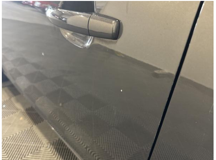
6: Door nsf Dented Over 30mm