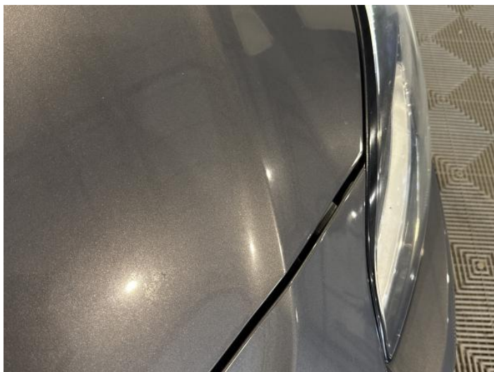
1: Bonnet Dented Over 30mm