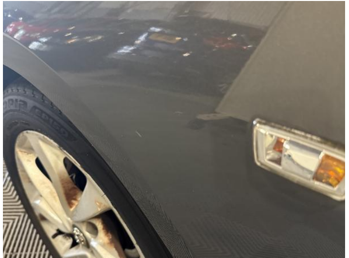
4: Wing nsf Dented Over 2 UpTo 10mm