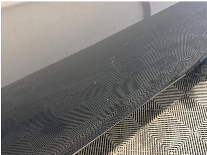
11: Door osf Scratched Over 25mm Thru Paint