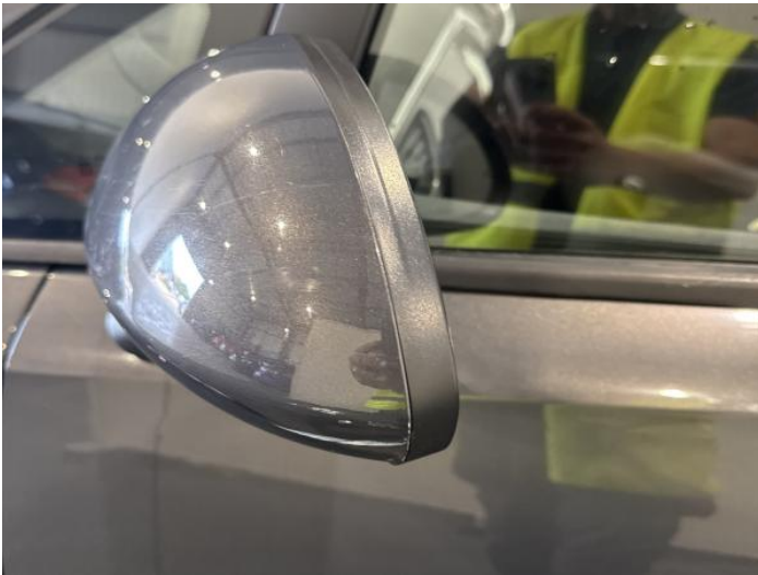
5: Door Mirror Assy nsf Scratched (Painted) UpTo 25mm Thru Paint