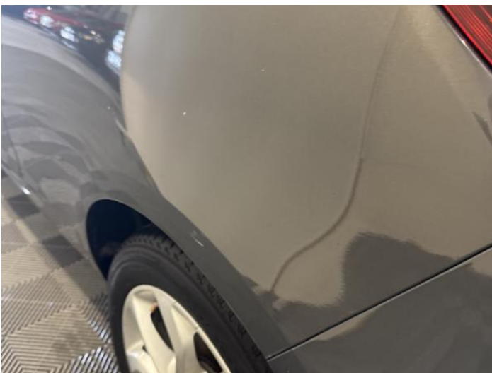
7: Qtr Panel nsr Scratched Over 25mm Thru Paint