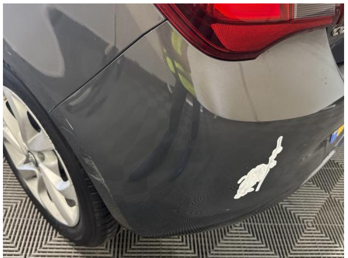
8: Bumper Rear Scratched Over 100mm Thru Paint