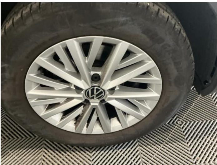
19: Wheel osf Scratched Up To 50mm