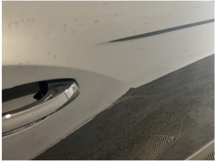
16: Door osr Scratched Over 25mm Thru Paint