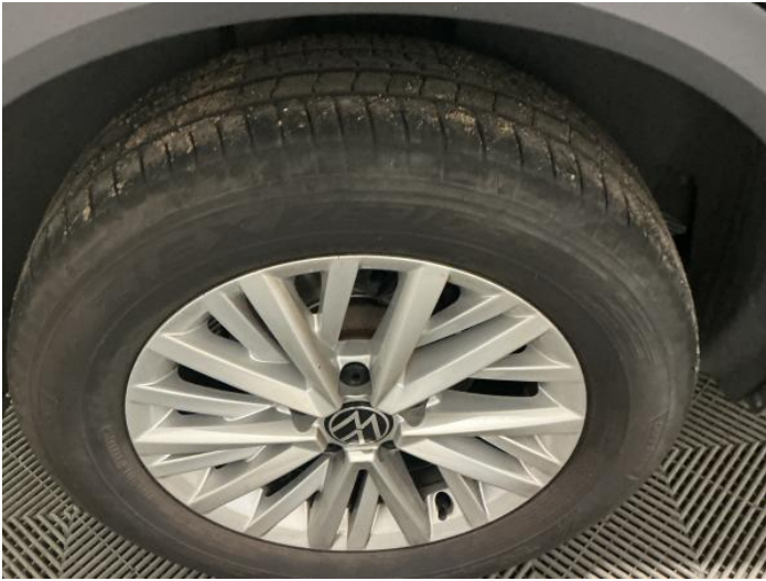
15: Wheel osr Scratched Over 50mm