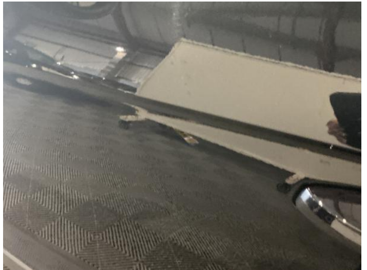
6: Door nsf Chipped 1 To 5