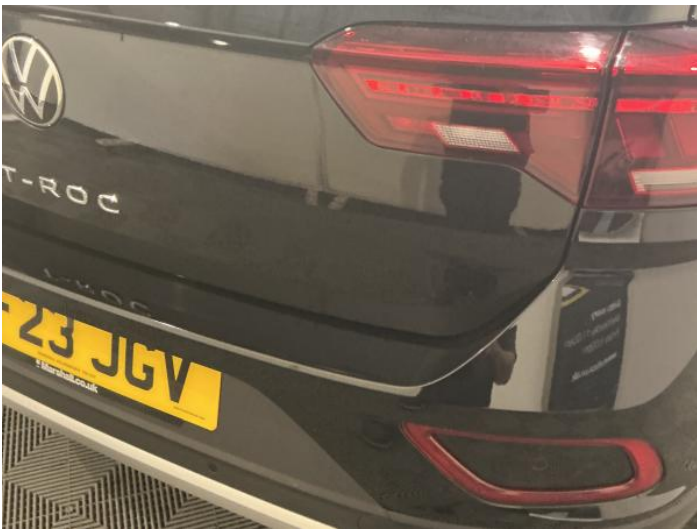
11: Bumper Rear Chipped Multiple Chips