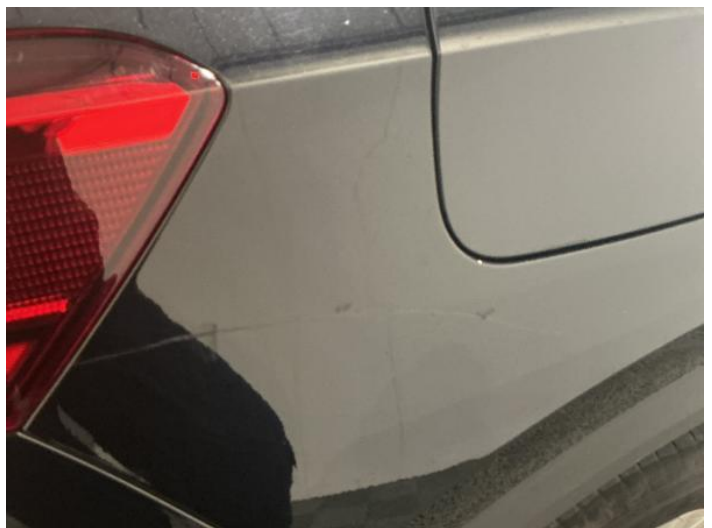
14: Qtr Panel osr Scratched Over 25mm Thru Paint