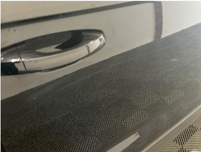
17: Door osf Scratched Over 25mm Thru Paint