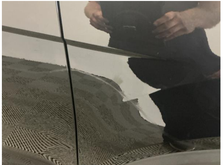
18: Wing osf Scratched Over 25mm Thru Paint