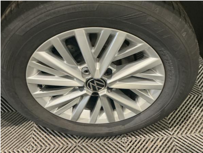
9: Wheel nsr Scratched Up To 50mm